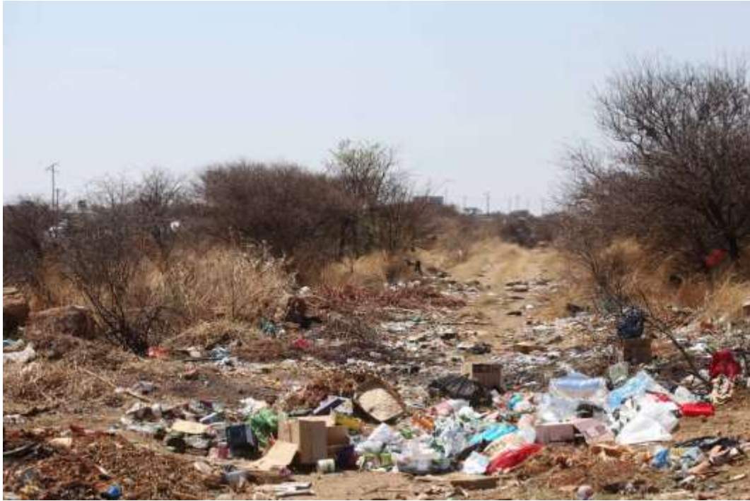
Photo 3 View of dirt track that runs through the site.