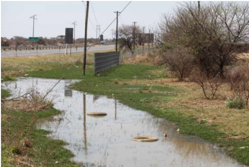
Photo 4 View of the northwestern boundary of the site where fowl-smelling water is present which may indicate polluted water that gathers.