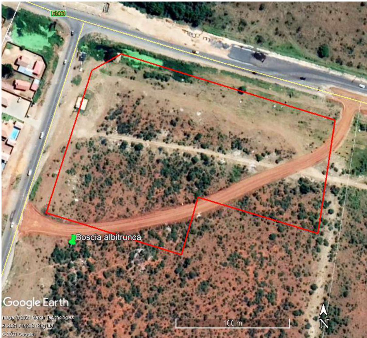
Figure 2 Indication of the presence of an individual of the Protected tree species Boscia albitrunca outside the site (Green marker). No plant or animal species of particular conservation concern appear to be present at the site.