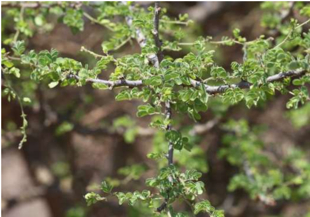
Photo 6 Foliage of the widespread Senegalia mellifera (Black Thorn) of which a few are present at the site.