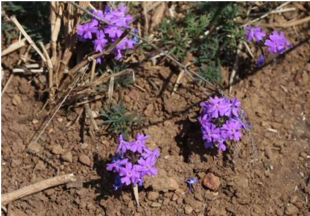
Photo 8 The alien invasive weed Verbena aristigera , at the site.