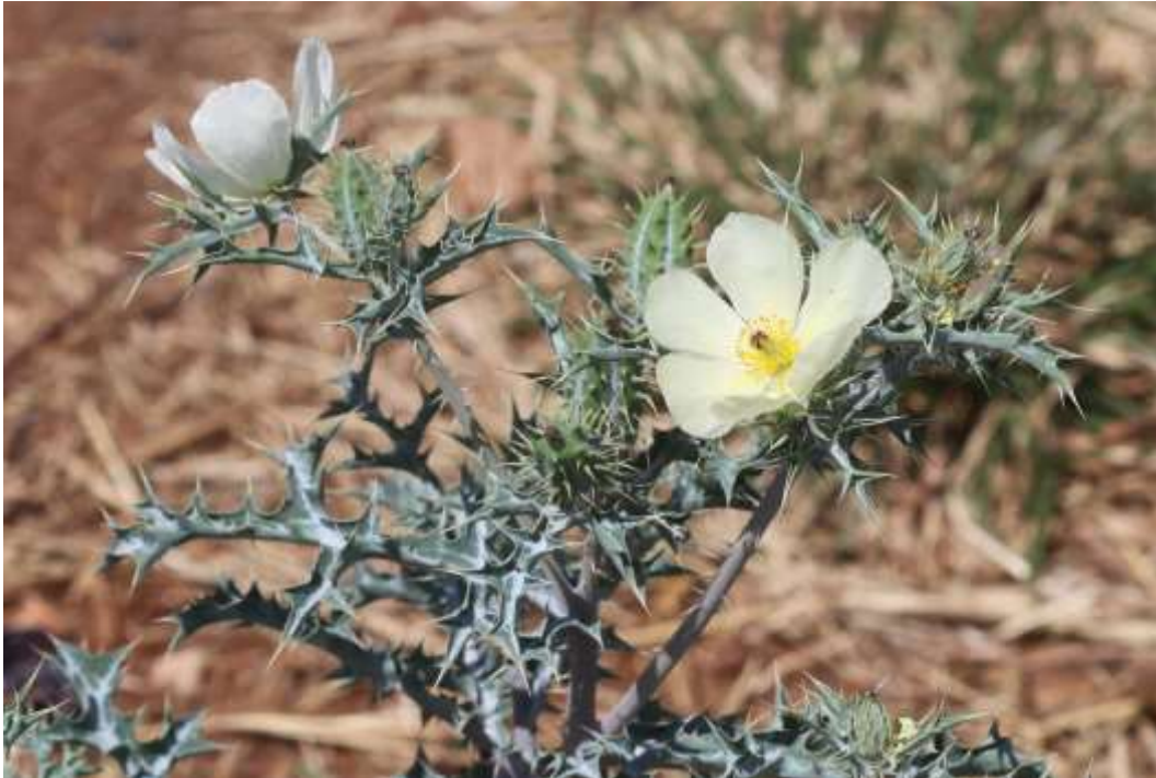
Photo 7 The alien invasive weed, Argemone ochroleuca at the site.