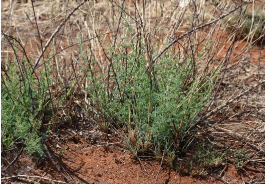
Photo 5 Resprouting Vachellia hebeclada (Candlepod Thorn) at the site.