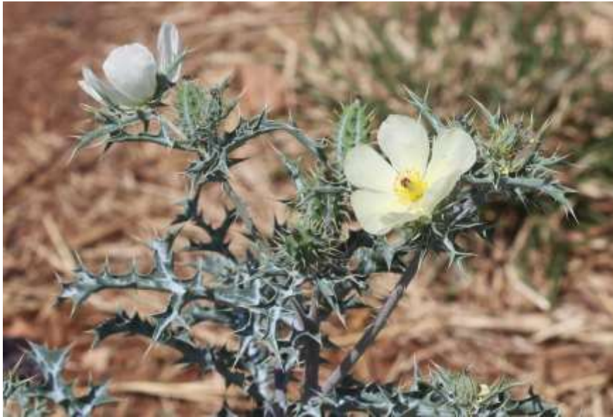
The alien invasive weed Argemone ochroleuca at the site.

Erven 3726, 3727 and 3728, Mahikeng, North West Province