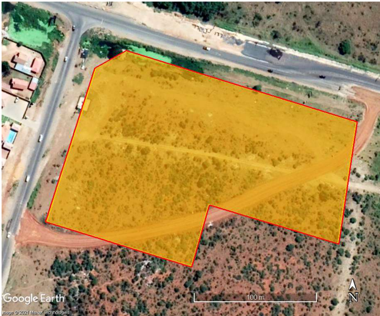
Figure 3 Indications of ecological sensitivity at the site.