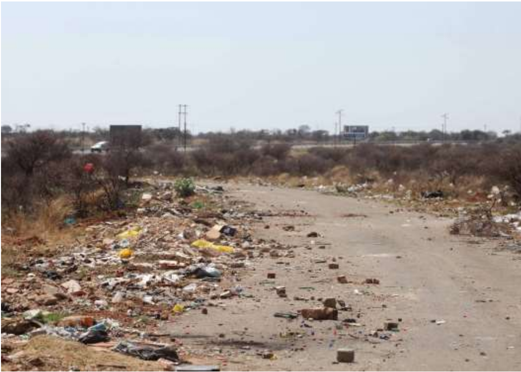
Photo 1 View of an old road that runs through the site. Informal dumping at the site is extensive.