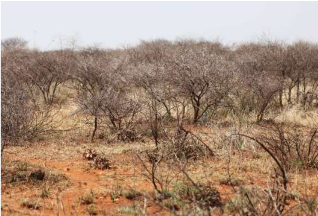
Photo 2 View of part of the site. Bush encroachment of shrub-height Vachellia species (Thorns) is noticeable at some areas at the site.