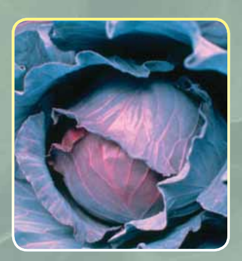
SUPER RED 90

This uniform variety has tight, medium tall wrappers surrounding solid, round heads with dark red color. Excellent field holding ability gives this variety flexibility in harvesting.