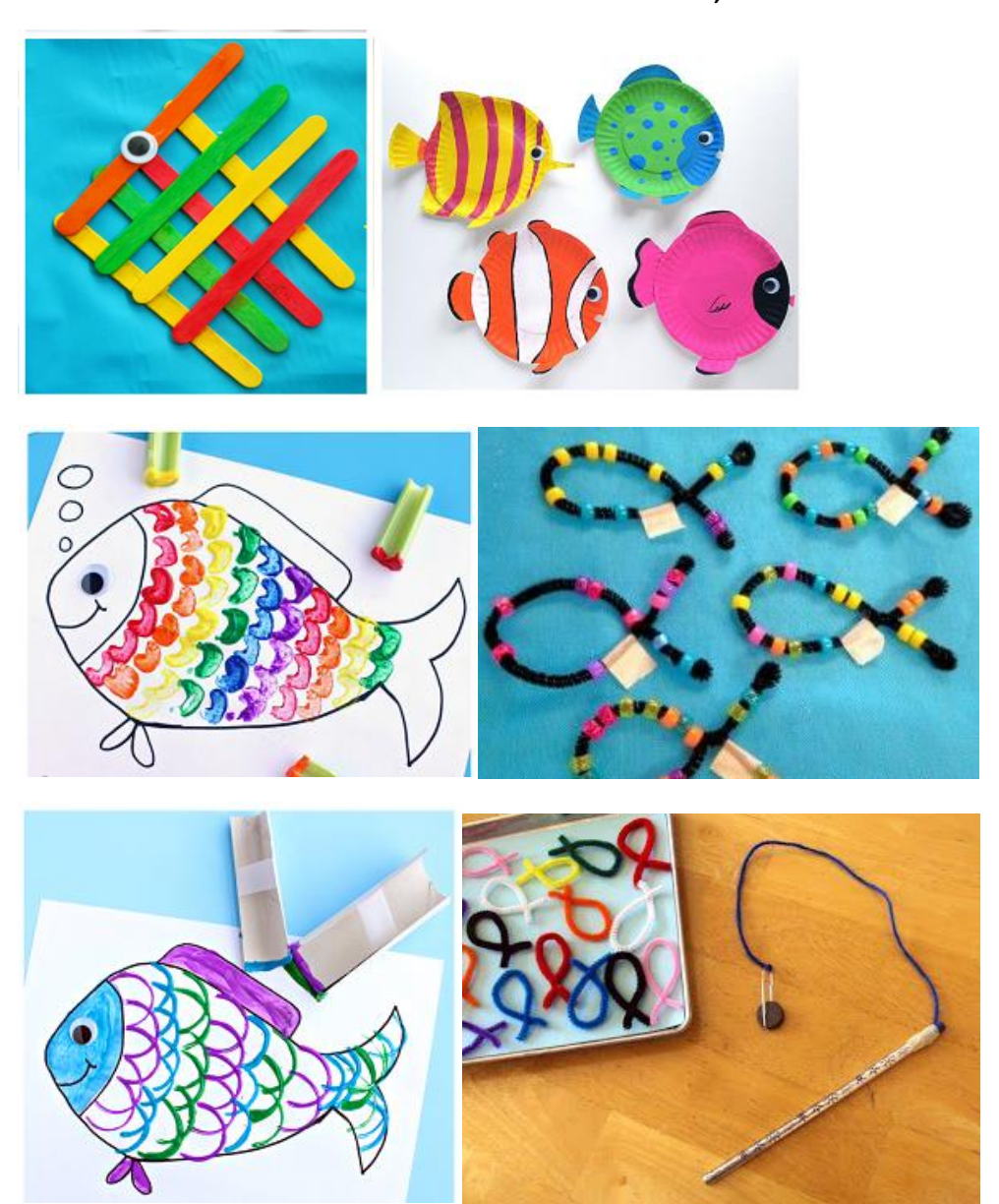
Jesus Feeds the Five Thousand: Craft, Activities and Games