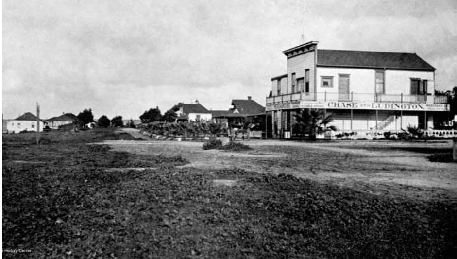
Chase & Ludington Store, 1903.