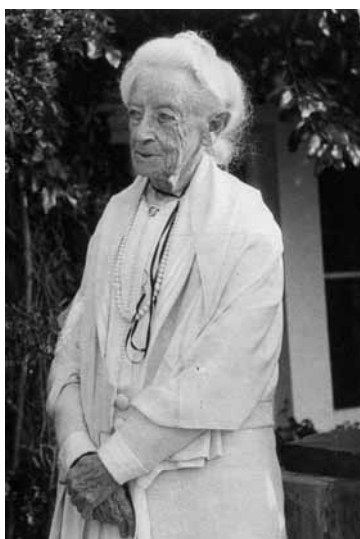
Ellen Browning Scripps, ca. 1925.