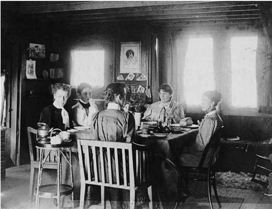
La Jolla women enjoying lunch in the Green Dragon cottage, 1894.