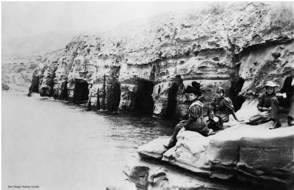
La Jolla Cove, ca. 1900.