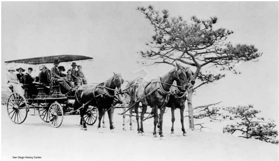
A popular activity in early San Diego was the “Tally-Ho” ride, a sightseeing excursion to La Jolla. Photo taken among the Torrey Pines, 1905. ©SDHC #13358.

But of the time when we as newcomers first discovered its hidden mysteries, when we set out on a journey of exploration from the hill boundaries of the far stretching mesa, along meandering and half-obliterated cow paths, over hillocks and down ravine, through straggling vines and thickets of fragrant sagebrush and blossoming greasewood and clumps of yellow poppies; past the structural homes of the kangaroo rat and the caverned mounds which were the habitat of the ground squirrel; invading the haunts of the quail and the lizard and the horned toad; startling the frightened jack rabbit, and the self-centered road runner, and