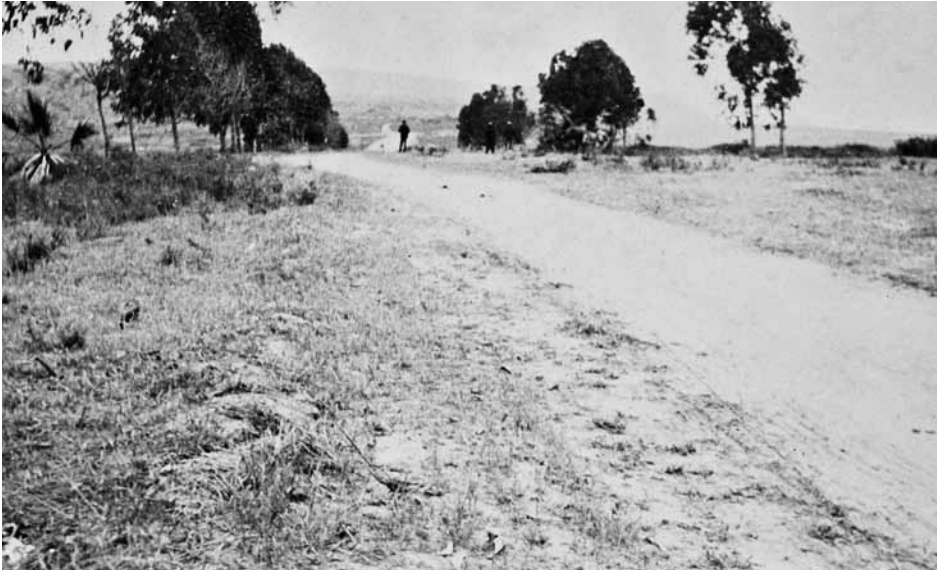
Girard Avenue, La Jolla, 1894, looking south.