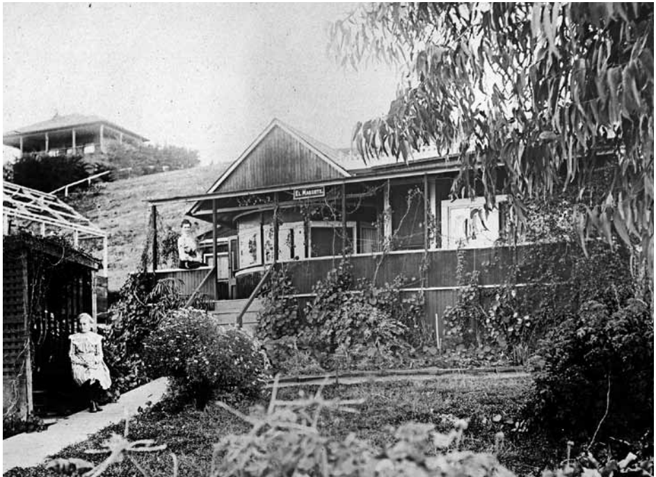
An early La Jolla cottage, “El Mascote,” ca. 1900.

There was a hotel of capacity at that time, with 2 or 3 cottages as an appendage, for the overflow of patronage—which never came. It had been built by some bold projector in the days of the boom, when resident lots that lay out on the tide lands or hung vertically above the eye-range changed hands at fabulous prices. Speculation ran high, and hotels were built to catch the eastern tourists, who were coming out in legions in 1886, enticed by the competing rates of rival railroad companies. I remember there was one day when the round trip rates between Chicago and San Diego went down to one dollar. Of course, the tourists were ‘caught’ as people always are—or ought to be—who try to get something for nothing; but they didn’t ‘stay caught’; and a mighty ‘slump’ followed the boom; and the property stakes rotted out in time, and the hotels became the