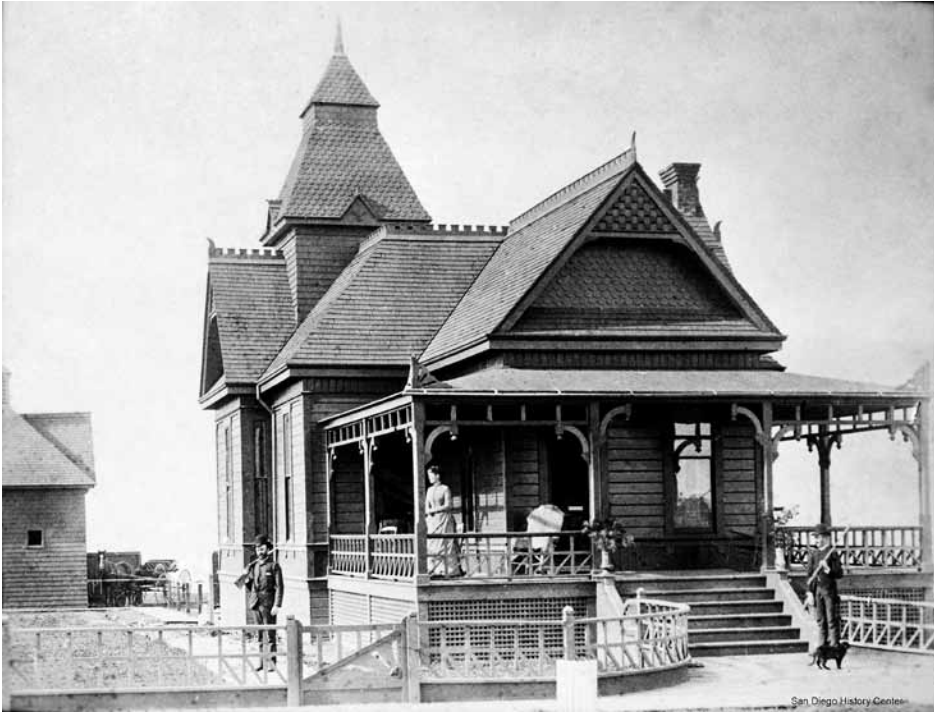
Botsford Cottage, located at the corner of Ivanhoe Avenue and Prospect Street, La Jolla. Frank T. Botsford, who surveyed and subdivided La Jolla Park in 1887, lived with his family in this cottage until 1891. Members of the Scripps family used Botsford Cottage as a vacation rental before the construction of South Moulton Villa. ©84:15150-72.

and study; a means of mental growth, spiritual culture,” and the development of women’s “natural forces and resources.” 39