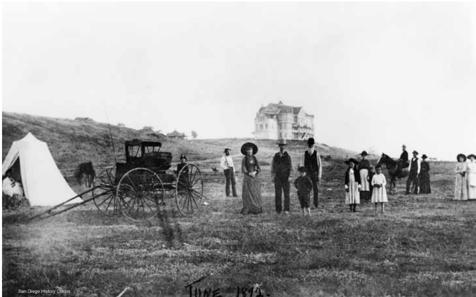
Before the La Jolla Park Hotel opened to the public, visitors to La Jolla camped in tents. Photo dated June 1892.

In 1894, the village began to attract visitors year-round after the San Diego, Old Town, and Pacific Beach Railway extended its services to La Jolla. It now took only an hour to get from the Santa Fe depot to the intersection of Prospect Street and Fay Avenue. An article in Sunset Magazine noted, “Until recently La Jolla’s