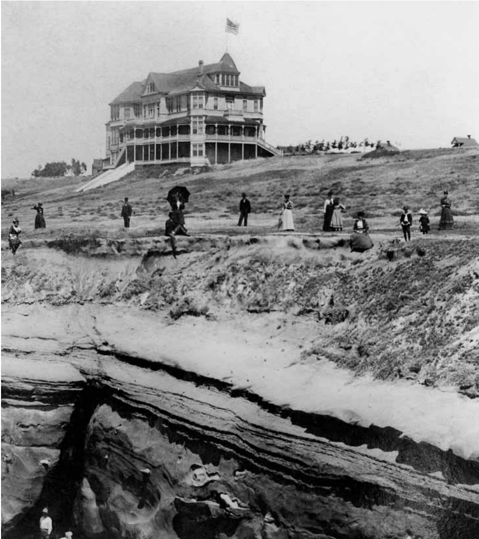
La Jolla Park Hotel in the mid-1890s. ©SDHC #4996.

In the summer, there were card parties, dances, suppers, and picnics almost every day. Holidays, in particular, drew crowds into La Jolla. On July 4, 1898, the railroad brought an estimated 1,600 people into town to see the fireworks and an “illuminated dive” in which daredevil Horace Poole covered his body with oil and set himself afire before jumping into the ocean from a springboard placed over the caves. 28 High school students came for “straw rides” and an occasional “Tally Ho” while tourists gathered abalone shells by the shore at low tide. 29 In 1898, the railroad offered an excursion “and gave each ticket holder a piece of watermelon.” 30 Fishing was popular, and people regularly caught sea bass, barracuda, spotted