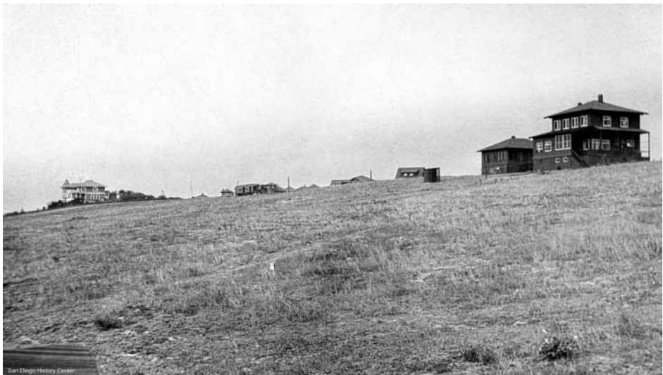
Ellen Browning Scripps's home, left, was located along Prospect Street.