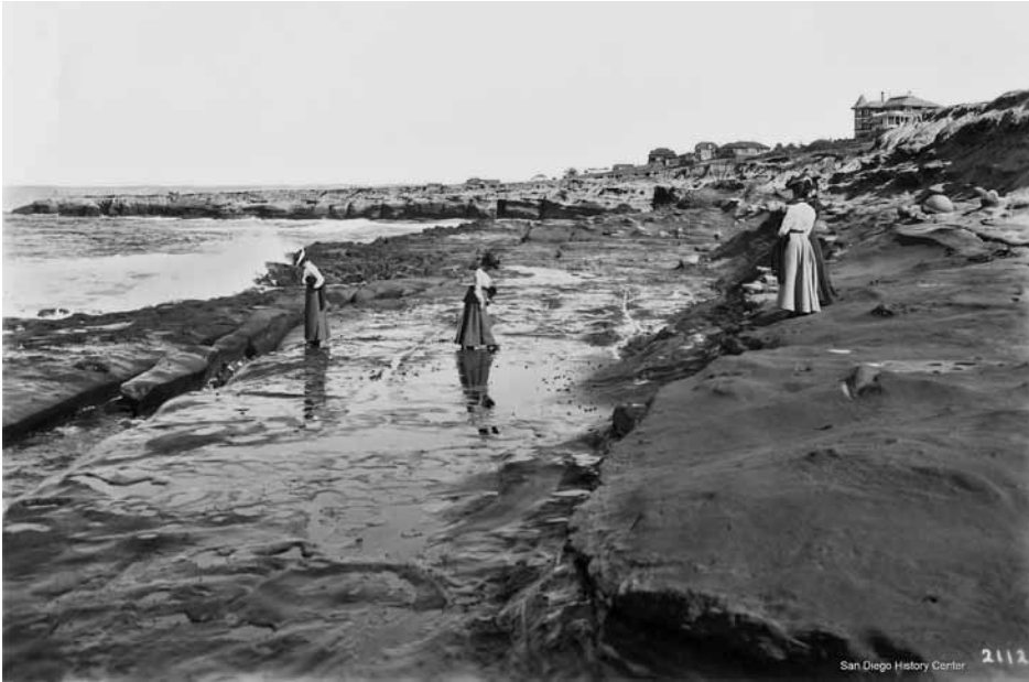
Women collecting sea shells and mosses in the La Jolla tide pools. South Moulton Villa stands on the top of the bluff, right. Photo, 1902.

the Torrey pines. She later described her philanthropy as a testament to “loyalty to truth, social service, and infinite human progress.” 47