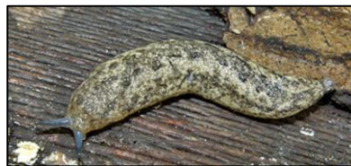
Philomycus carolinianus

Just as shell-less marine gastropods, nudibranchs, the land mollusks have their own shell-less representatives - the not-so-colorful slugs. Florida has native slugs, but most often you will encounter the larger introduced European slugs that can be an agricultural pest. Traditionally an environmentally friendly way to trap harmful slugs was to leave a shallow saucer of beer near locations of slug damage. It is not known if the slugs are attracted to the beer or if the ingested libation is toxic, but presumably the slugs died happy.