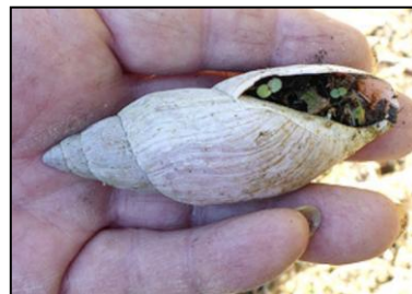
Euglandina rosea St. Johns County, Florida - 83.5 mm. from JaxShells

In an incredibly stupid decision, our Rosy Wolf Snail was introduced to many areas of the tropics to theoretically hunt down the agricultural pest (oh, by the way, the Achatina also carries disease). The Rosy Wolf Snail largely ignored the Achatina and instead killed the valuable native tropical land shells. Now the Rosy Wolf Snail is an unwanted and hard to eliminate pest on those islands.