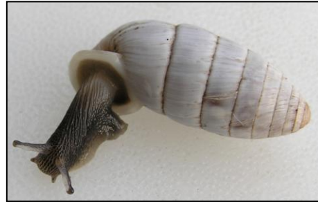
Cerion incanum

behind sand dunes. They tolerate some salt spray, and are not found far away from the sea. The Peanut Shells are more numerous in the Bahamas and Cuba, and some Caribbean islands.