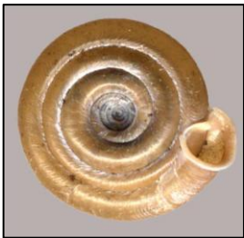
Polygyra septemvolva

Land shells are found in almost every land habitat. Some climb trees to hide from predators; others climb grasses near the shoreline. Most however are found at ground level, often just below ground or underneath rocks or vegetation. The majority of land shells are less than an inch long, but that does not mean they are difficult to find. One of the most common genera of land shells, the Polygyra (Greek for multiple coiled) can be found in urban to forested regions, from the sand dunes of the shores, from moist areas near woodlands and disturbed urban cites. The Polygyra well adapted to many habitats can often be seen by the hundreds, but don't worry. They are not harmful and do not eat your garden plants. They are clever enough to seek refuge climbing trees or even walls when local flooding occurs, and then quickly return to land when the water recedes.