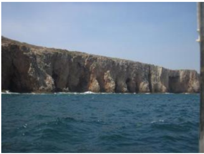
Figure 1. Sagres promontory where most of the complex of caves are distributed.

Explored caves and tunnels differ in length and on the opening of the vault (2 to15 meters depth and maximum length of 180 meters). Their opening/mouth during low tide occurs in shallow water between 6 and 18 meters depth and is mostly exposed to the swell and tidal movements. The maximum depth within the caves may vary between 5 and 15 meters (anecdotal information).