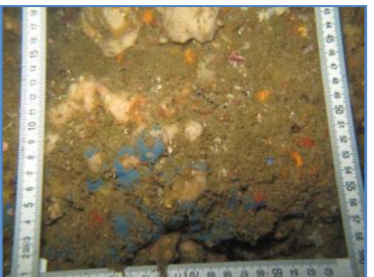
Figure 3. Photo quadrate inside a sea cave.

Some important variables for the analysis of the communities' zonation should be obtained. To measure those variables some equipment can be deployed at each surveying station along the caves: