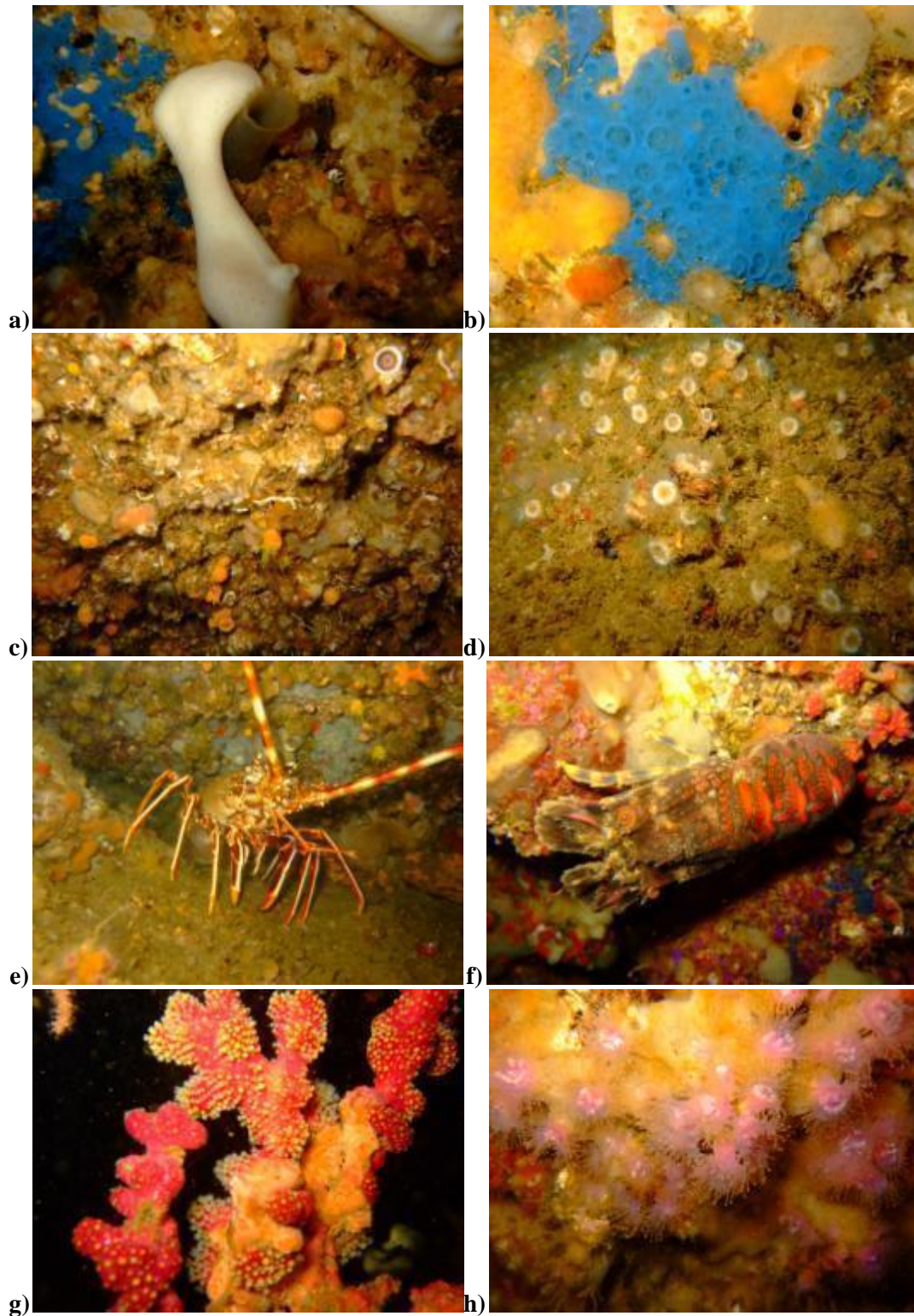
Figure 4: Photographs from the seabed environment in submerged sea caves of Sagres: a) Terpios gelatinosa and Chondrosia reniformis ; b) Hymedesmia versicolor ; c) Astroides calycularis ; d) Polycyathus muelleriae ; e) Palinurus elephas ; f) Scyllarus arctus ; g) Alcyonium coralloides ; h) Corynactis viridis .