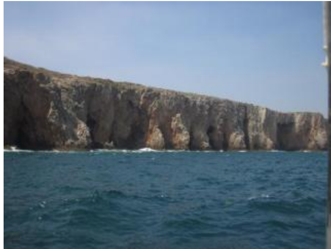
Figure 1. Sagres promontory where most of the complex of caves are distributed.

Explored caves and tunnels differ in length and on the opening of the vault (2 to 15 meters depth and maximum length of 180 meters). Their opening/mouth during low tide occurs in shallow water between 6 and 18 meters depth and is mostly exposed to the swell and tidal movements. The maximum depth within the caves may vary between 5 and 15 meters (anecdotal information).