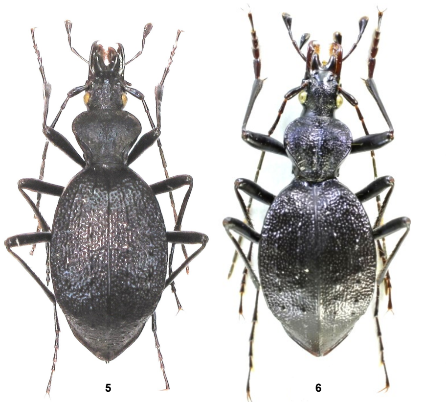
Figs. 5-6. Cychrus ( Shuocyhropsis ) huangcao sp. nov. (holotype female): 5- habitus dorsal aspect; Cychrus ( Shuocyhropsis ) brezinai Deuve, 1993, paratype female Gongga Shan, Sichuan: : 6- habitus dorsal aspect. Bar equals 10 mm.