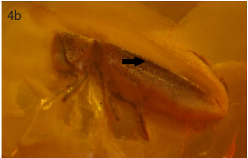
Fig. 4a-b. Gatrallus zjantaru Zahradnik & Háva, 2014: holotype, habitus, dorso-lateral aspect.