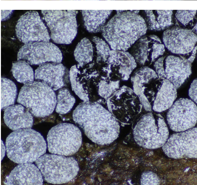
7 June 2014 Badhamia panicea (#0148) on dead C. aristata.