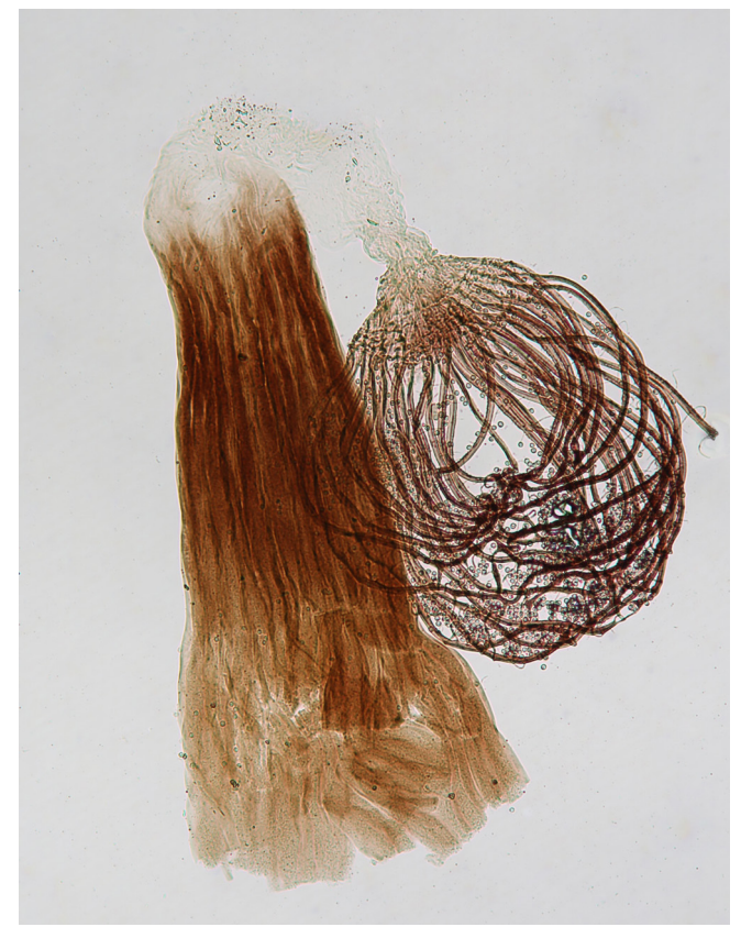
25 Dec. 2014. Cribraria cancellata var. fusca MEL356, #0286