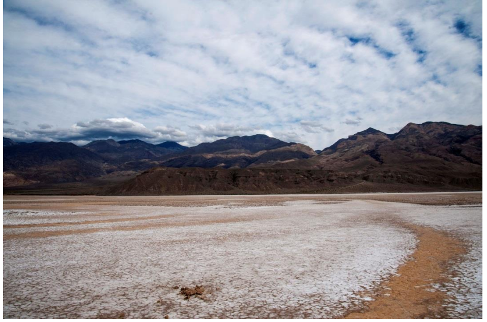
Figure 1. Panamint Lake, Panamint Valley, California. A typical and seemingly inhospitable salt flat.

advancement when the overall climate was cooler and wetter, many large lakes occupied the Southwest. Some of these lakes were even connected to one another via river corridors (Figure 2); a much different past climatic regime is evidenced by the presence of arroyos and dry lake beds. Occasionally these features flood, revealing ancient corridors that aquatic organisms, such as springsnails and pupfish, once used to disperse (2, 3, 4, 5, 6), and today some of the dry lake beds are covered with a salt crust. These crusts form due to chemicals that leach out of the surrounding mountains or are left over from rapid evaporation of water during desertification, often occurring in an enclosed basin that precludes the salts from being washed away. These crusts differ among the lakes in both salinity and chemical composition (7).