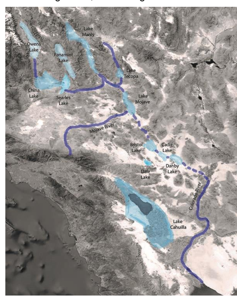
Figure 2. Ancient (2.5 million to 126,000 years BP) waterways in the Mojave and Colorado Deserts of southern California. Dashed lines indicate connections disputed by geologic evidence. This is not comprehensive or to scale, but meant to provide a general idea of what the Southwest was like prior to desertification.

At first glance, salt flats may not appear to be hospitable to animal life (Figure 1). Often located in hot, arid places, they can readily flood, and their salinity presents special challenges to water regulation. However, there is evidence that these seemingly inhospitable habitats may act as refugia (a location of an isolated population of a once more widespread species) for terrestrial arthropods (1). Soda Lake in Mojave National Preserve is one such salt flat that is a remnant of a much wetter period in the history of southwestern North America. The Desert Southwest, which includes some of the driest deserts on Earth, was largely composed of riparian woodland and scrub habitats before the Quaternary began (1.64 million years ago). During the Pleistocene (2.5 million to 11,700 years ago) there were several advances and retreats of glaciers, and during times of