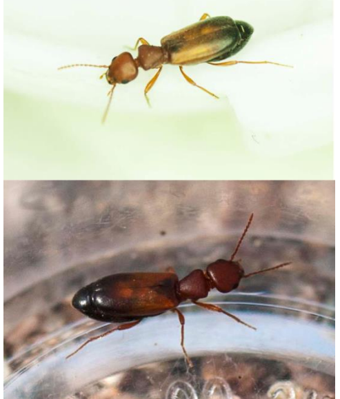
Figure 6. Salt flat ant-like flower beetles of the genus Tanarthrus .