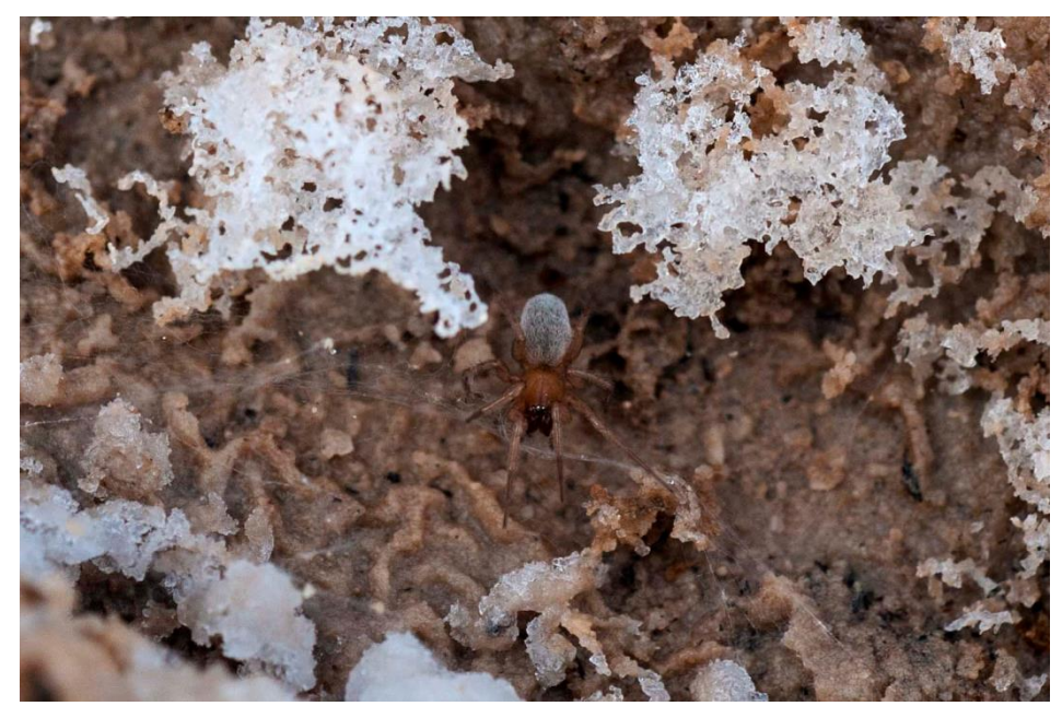
Figure 3. The spider ( Saltonia incerta ) on its web made within the thin layer between salt crust and soil substrate on the surface of the dry lake bed.

We analyzed both a mitochondrial DNA gene (Cox1) and a nuclear DNA gene (H3) for 81 spiders from 13 salt flats in 6 drainage systems