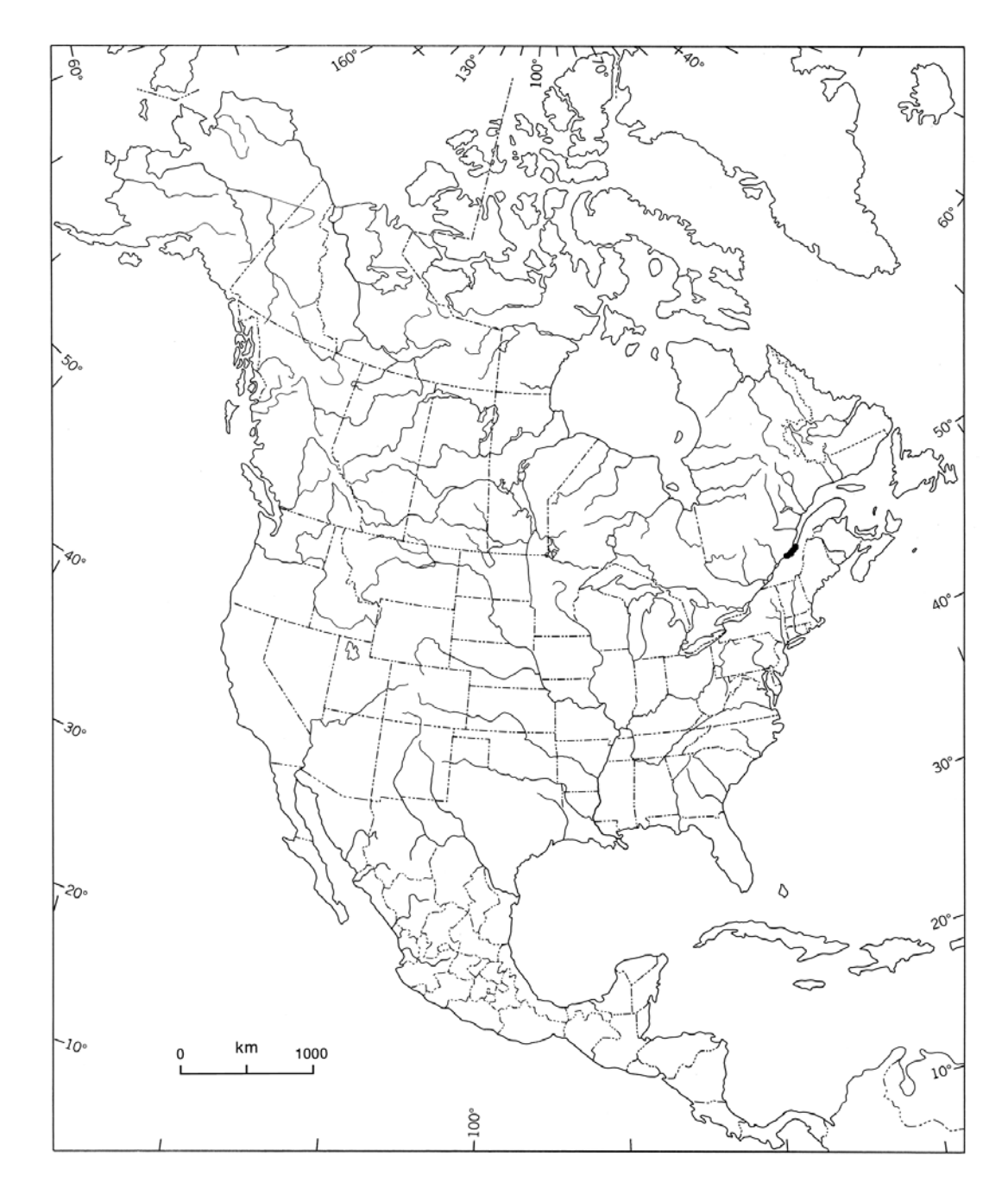
Figure 2. Global range of Victorin's gentian.