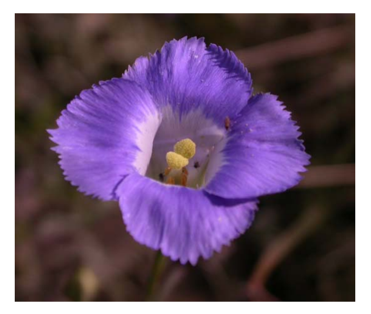
Figure 6. Pollinators in a Victorin's gentian flower.