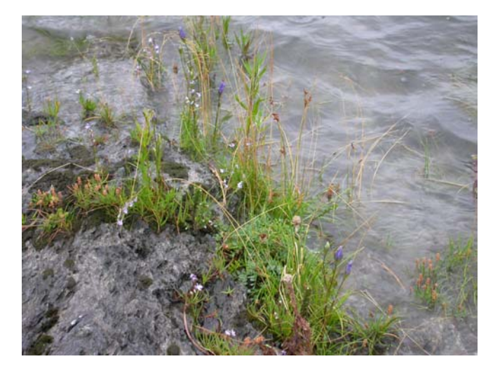
Figure 4. Victorin's gentian habitat at Saint-Vallier.

The habitat of Victorin's gentian is the portion of the littoral located in the transition zone between the mid-and upper littoral portions of the freshwater and slightly brackish estuarine intertidal zone. This zone is covered by water for two to three hours per day during equinoctial high tides (Figure 4), but is seldom reached by low high tides. Brouillet et al. (1996) observed Victorin's gentian in seven segments (1.45% of the segments sampled) of the 34 sampling sites and all of these segments (100%) were located in the upper littoral zone. The species grows in dense, high prairie cord-grass beds (Figure 5) and sometimes on sparsely vegetated raised outcrops. It occurs at the interface of the upper and mid-littoral or near openings in the vegetation of the upper littoral; with lower vegetation, it receives more light than in the upper littoral, where the herbaceous stratum is higher. It prefers thick surficial deposits (over 15 cm) of fine or mixed materials (seldom coarse), with no or very little stoniness (rarely very stony).