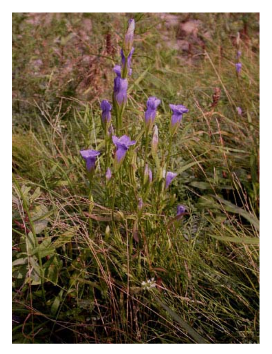
Figure 1. Photograph of Victorin's gentian in its habitat at Saint-Augustin-de-Desmaures.