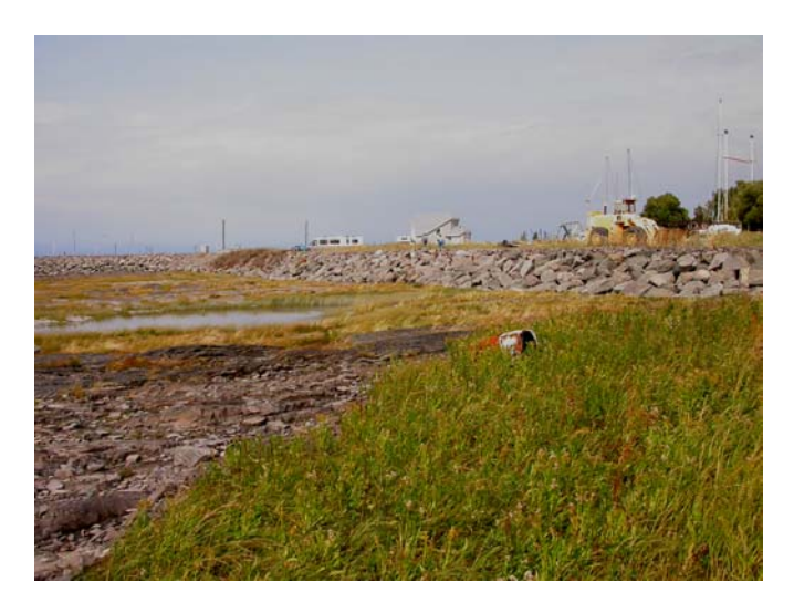
Figure 5. Disturbances of Victorin's gentian habitat at Saint-Jean-Port-Joli.

In his report, Legault (1986) mentions 20 populations of Victorin's gentian, two of which were considered extirpated. Since then, several of the populations have been threatened or destroyed by shoreline filling. Thus, five of the known populations at that time are now extirpated and three are now historic, despite efforts by the author in recent years to locate them (Table 1). As a result, only 10 of the 20 known populations mentioned in Legault's report (1986) are still extant.