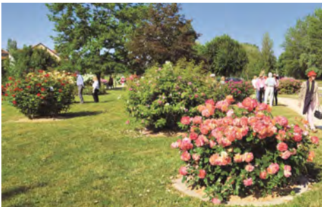
A small section of rose garden at Estavayer-le-lac

We re-entered Switzerland the next day for a tour of the FELCO factory where many of us bought snips and other FELCO products. We were also supplied with a tasty lunch. Then it was off to a winery, Auvernier Castle, where we sat under a huge old cherry tree with a magnificent view over vineyards and a lake in the background, all the while sampling an array of locally made produce!