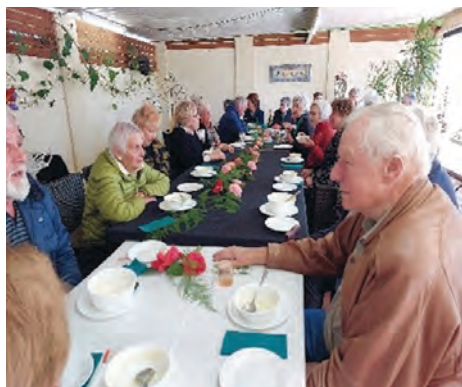
Warming soup and even warmer friendships at the Taylor's place