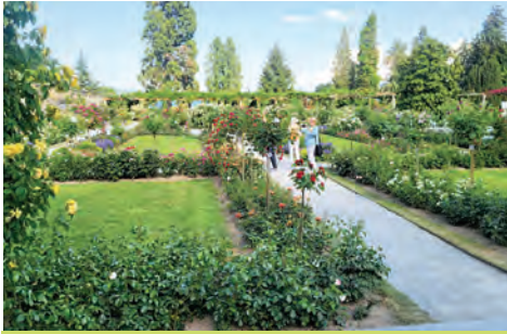
A rose garden on Mainau Island