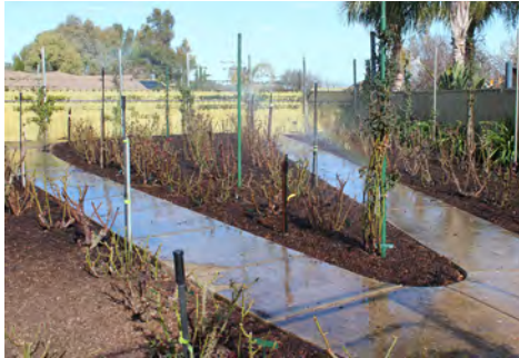
Whoflungdung, the Neutrog mulch recommended by the RSSA.