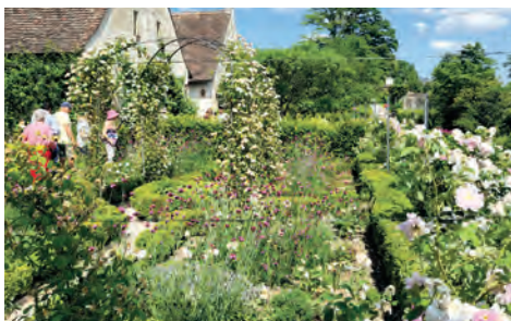
Herb garden and roses at the old monastery, located in Kartause