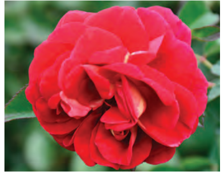
No Surrender

No Surrender is such a fitting name because the siege started in April 1942 and the Australians were not relieved until December of that year. German propaganda described the men as “living like rats.” The Australians took this as a badge of honour and struck an unofficial badge with a rat across it with the words, “No Surrender!” Subsequently, the moniker, The Rats of Tobruk , was “born”. The rose, winner of a Bronze Medal in