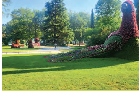
Topiary on Mainau Island

roses beautifying the area, beyond which Lake Constance was an ever present backdrop.