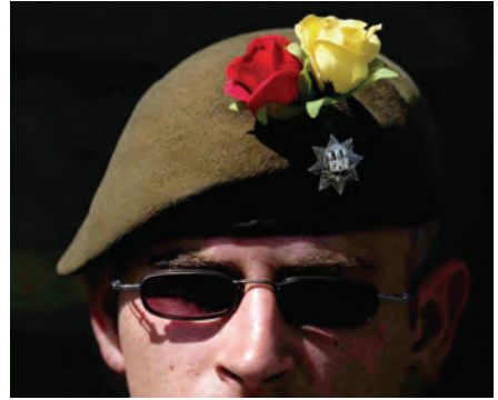
A soldier from the Anglian Regiment with the yellow and red rose worn as a tribute to Minden Day.