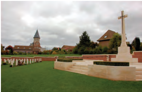
A section of the War Graves and memorial at Fromelles.

The poppy is regarded as the symbol of the First World War but in the War Grave cemeteries it is the rose which is most often planted. The most popular of these is a red Floribunda called (of course) Remembrance (Harkness, 1992). Red roses are chosen because they are a good contrast with the white gravestones and crosses.