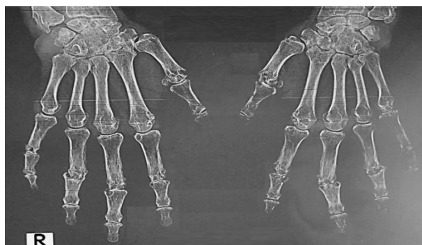
Fig-2: X-ray of both hands facing, from the recent hospitalization. Structural progression of both carps, MCP, PPI, IPD and onset resorption of the phalangeal tufts of both hands marked on the left with a subperiosteal resorption of the second phalanges of the left hand

The medical history didn't show any personal or family psoriasis, frostbite of the hands or Raynaud's phenomenon. The patient had no dry eye syndrome and no respiratory signs. Also, no toxic exposure, particularly to vinyl chloride was found.