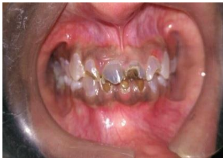
Fig-2: Showing generalised Opalescent teeth with brownish blue discoloration