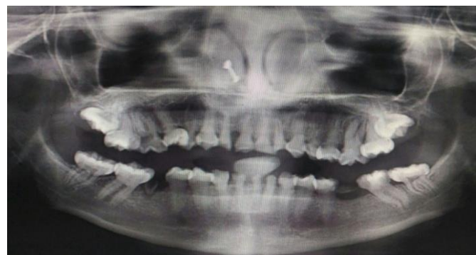
Fig-9: Orthopantomograph showing obliteration of Pulp spaces, bulbous crowns with cervical constrictions, Short and malformed roots, typical tulip tooth appearance