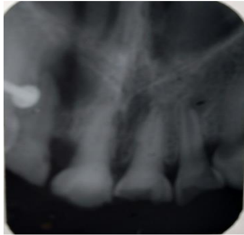
Fig-7: Intraoral periapical Radiograph of maxillary Anteriors showing pulp Exposures seen irt 21, 22