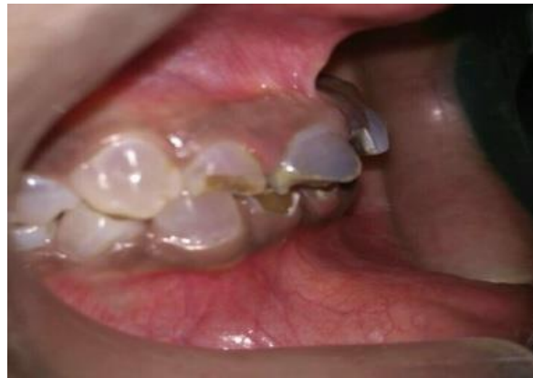
Fig-4: Showing decreased vertical dimension