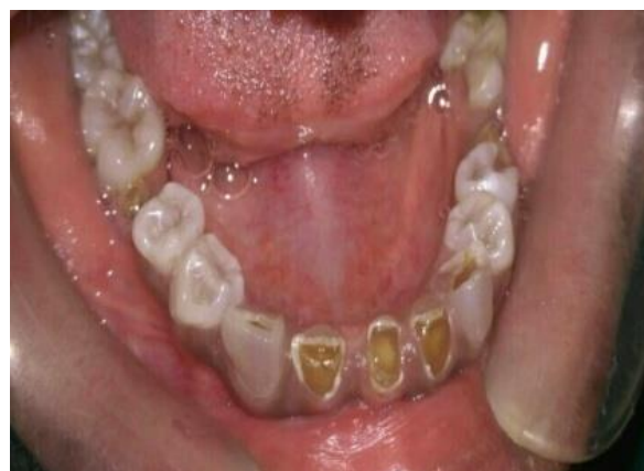
Fig-6: Mandibular arch showing generalised chipping of enamel