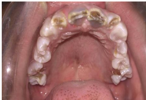
Fig-5: Maxillary arch showing fracture of cusps in multiple teeth