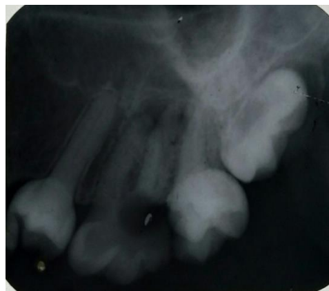
Fig-8: Radiograph of maxillary posterior teeth showing bulbous crowns