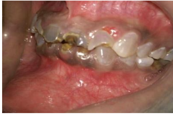
Fig-3: Showing loss of enamel