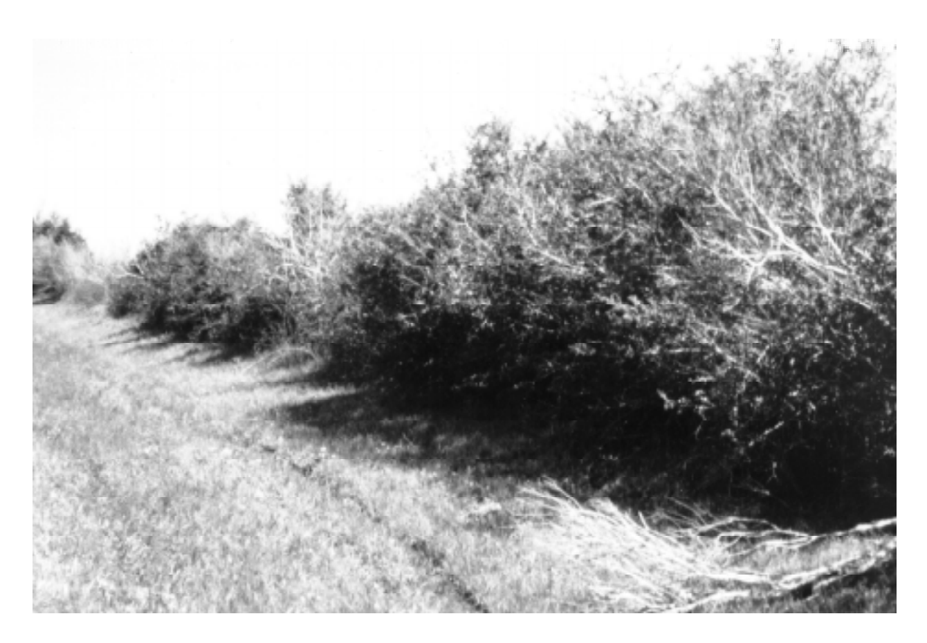
Figure 2. Yaupon thicket along a roadside in south-central Texas

on sites subjected to winds, limited salt spray and, in some instances, moderate amounts of salt in the soil (Wigginton 1963). Yaupon grows well in shade and sun, but best growth and maximum fruit production occur in open areas (Halls 1977).