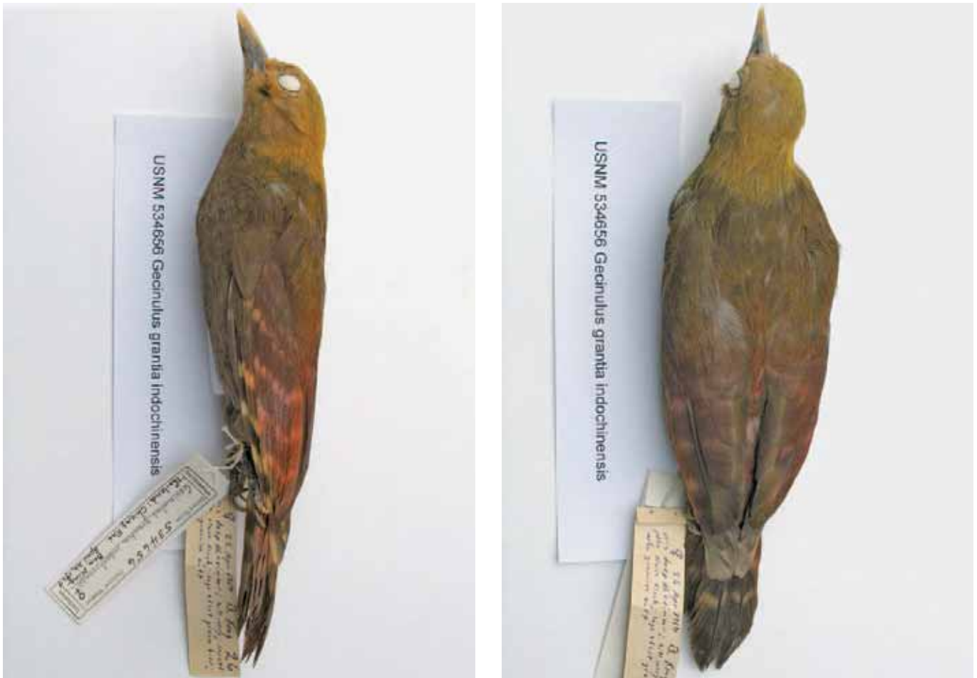
Figure 9. USNM 534656 (dorsal view and lateral view), collected Chiang Khong, Chiang Rai, northern Thailand, 26 April 1964, by B. King. Note the extensively greenish mantle which is atypical for any subspecies of Gecinulus grantia .

assignable as to species with 100% confidence. (So far, purely aural records are not known to have provided the basis for any northern Lao reports of either species: J. W. Duckworth in litt. ). If G. grantia and G. viridis do intergrade widely, then intermediates might be expected to show a highly variable mix of characters, and those individuals with only subtle differences from either parent species might easily be overlooked. On the other hand, if both occur sympatrically without intergradation in their zone of contact, such sympatry might remain undetected if one species was rare, and the other relatively common at any given site.