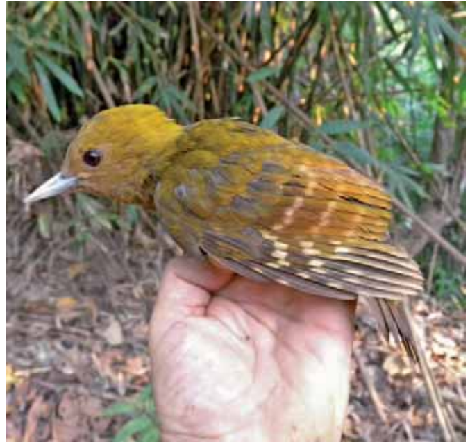
Figure 4. Lateral view female Gecinulus in the hand, Ban Saen Jai, 16 April 2010. Note the extensively barred primaries and secondaries, and rufous-tinged secondaries.

Throat and forecrown unmarked, pale brownish. Mid-crown, hind-crown and ear-coverts yellowish-olive. Mantle and lower back bronze-olive (olive-green); upperwing-coverts concolorous dull bronze-green. Rump feathers extensively tipped (maroon) reddish and uppertail-coverts dull bronze-olive. Underparts (breast, belly and undertail-coverts) dull, dark olive. Prominent white spotting/