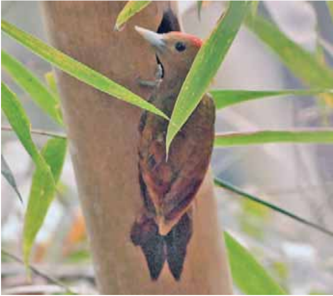
Figure 2. Male Gecinulus at nest, Ban Saen Jai, 3 April 2010. (Rungsrit Kanjanavanit)