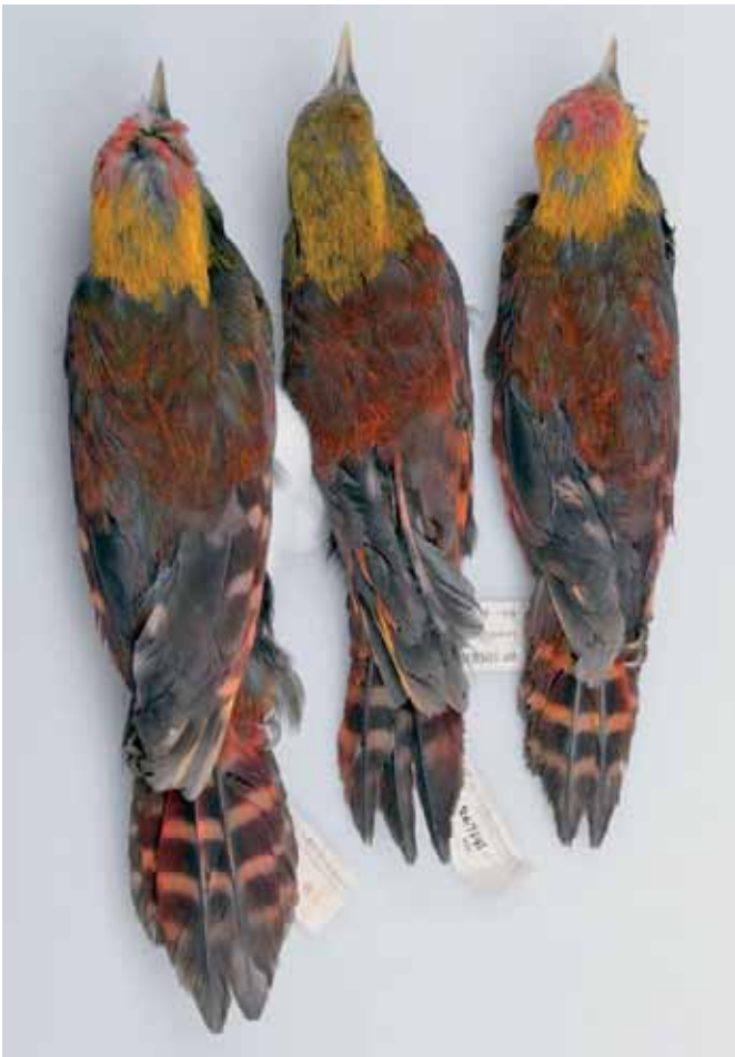
Figure 7. Dorsal view of three specimens of G. grantia indochinensis from Lo-Tiao, Bokeo, Laos. From right to left MCZ 267140 (male); MCZ 267141 (female), MCZ 267142 (male).

the mantle, recalling the Saen Jai bird, although it possesses rufous-tinged, rather than whitish, bars on the folded wing. The tail-bars, however, are whitish rather than rufous-tinged and neither as broad nor as boldly contrasted as in any G. grantia (Figure 9).