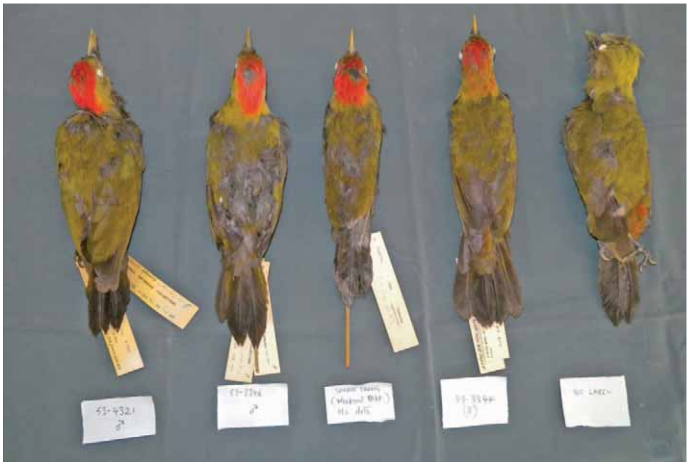
Figure 6. Dorsal view of four Thai-taken male/male-plumaged specimens, and one female specimen, of Gecinulus viridis . Note the restricted areas of red on the hind-crown on the right-hand-most red-crowned individual, CTNRC 53-3344, from Mae Jan, Chiang Rai.

Photographs of King's female specimen from Chiang Khong (USNM 534656) also revealed that it is somewhat intermediate in appearance. It differs from any other G. g. indochinensis or G. g. viridanus specimen in being markedly and evenly green-tinged on