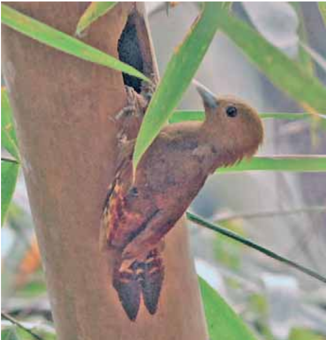
Figure 3. Female Gecinulus at nest, Ban Saen Jai, 3 April 2010. (Rungsrit Kanjanavanit)

indistinct pale bars, with a slight rufous tinge evident at times (Figure 2).