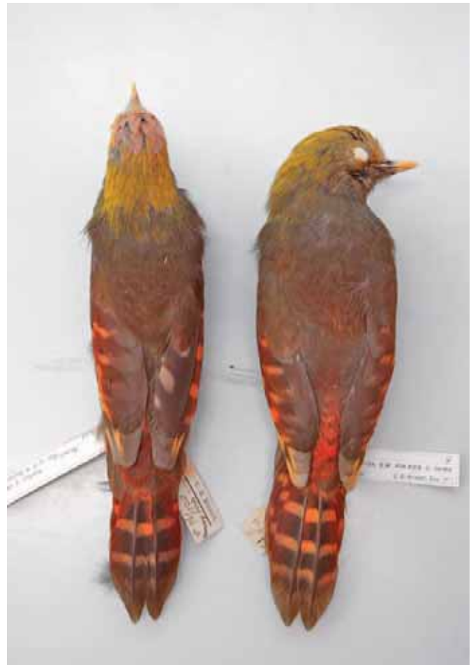
Figure 8. Dorsal view of two specimens of G. grantia viridanus, BMNH 1900.1.18.328 (male, left) and BMNH 1905.12.24.423 (female, right).

The existence of a female Gecinulus , clearly outside the normal range of variation of Bamboo Woodpecker, somewhat intermediate in plumage between G. viridis and G. grantia , and the existence of another female Gecinulus (USNM 534656, labelled G. g.