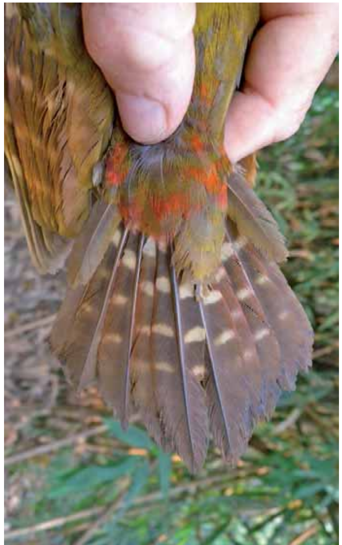
Figure 5. Rump, uppertail-coverts and spread tail of female Gecinulus in the hand, Ban Saen Jai, 16 April 2010. Note the prominent barring on inner and outer webs of rectrices 1–5. (P. D. Round)