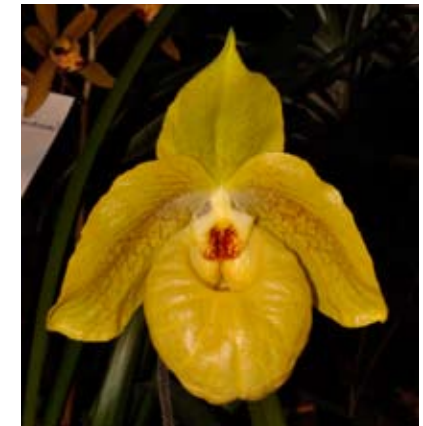
Paphiopedilum Norito Hasegawa 'Sunny Day' , exhibitor Santa Barbara Cymbidium Society.

Casa de las Orquideas also won the Best First Blooming Pink Cymbidium Seedling with Cym. (Enchanted Profile × Helen Tangcay) 'Nancy' , and had the Best Specimen Cymbidium in Cym. Marie Bashir 'Shocking' (Wallacia × Mighty Mouse), a stunning plant in art shade stripes of orange and yellow. Another unique award for this display is the Best Group of 3 Cymbidium Plants, Each a Different Clone, which included Cym. Hazel Fay 'Shocking' AM/AOS, B/CSA, (Mighty Mouse × Karen). They really did assemble quite a prestigious group of