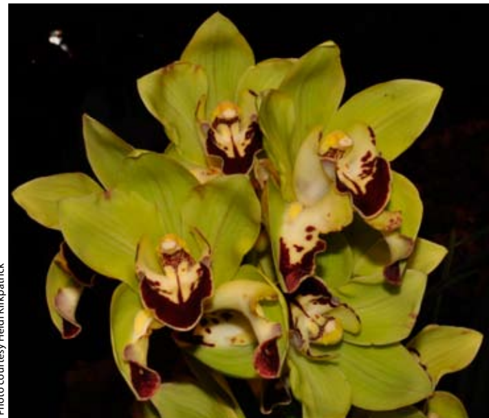
Cymbidium Psychotic 'Green Dragon' , exhibitor Casa de las Orquideas.

but instead a good cymbidium growing companion. Laelia anceps 'SanBar Pink Virtue' caught the judges' attention out of a display packed with great Laelia anceps . This particular flower was exceptional for its size and flat pink petals, grown on a specimen size plant that must have taken years to cultivate. And with any plant deemed Best in Show, it drew crowds of people who gawked and jostled for a chance to take a photo. This is an example of the classic