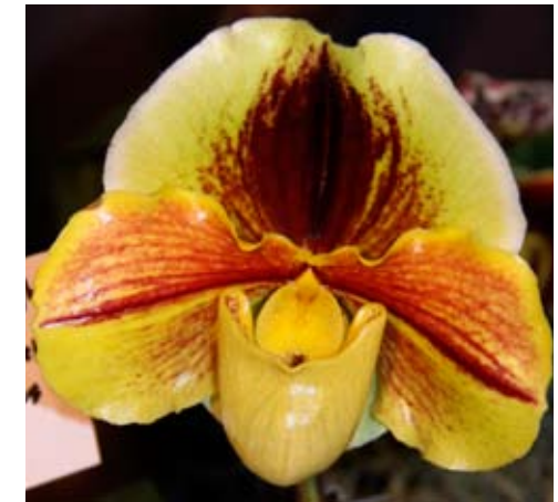
Best Paphiopedilum Standard Complex Hybrid: Paphiopedilum Malibu Lights 'Sycamore Creek' AM/AOS, exhibitor Bill Robson.