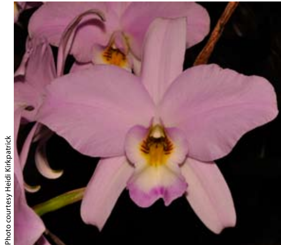
Best in Show: Laelia anceps 'SanBar Pink Virtue', AM/AOS exhibitor Santa Barbara Orchid Estate.