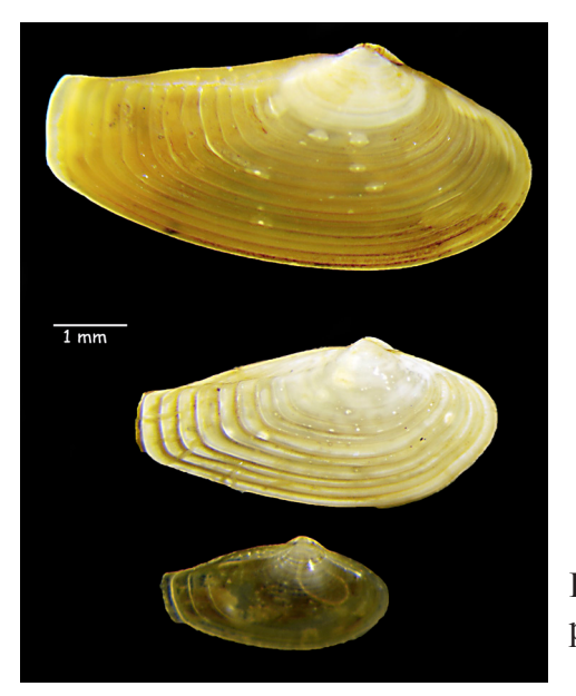
Fig. 2 – Nuculana leonina , Cascadia Slope, EBS-64, 950 m, K. Barwick personal collections (from SCAMIT 2009)

Fig. 1-Nuculana sp B, CSD Bight 2003 Sta. 5034, 394 m, 4AUG03, K. Barwick Cat. #1862.1 (from SCAMIT, 2009)