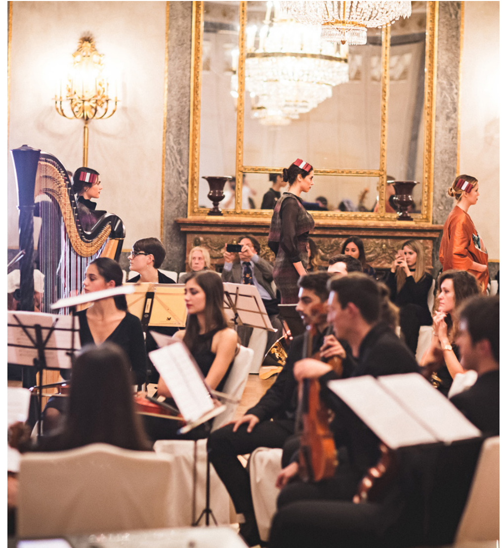
Gentile Catone fashion show, featuring the Orchestra. Venue: Ludovisi Room, Westin Excelsior.

This venture's aim fits perfectly into the issues of the Agenda 2030, that with its 17 sustainable development goals (SDGs), aims to tackle the obstacles