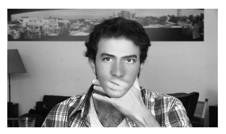
A crisis of disclosure: the ex-soldier in Z <sub>3</sub>2. Courtesy Avi Mograbi

Z_{32} presents the trauma of a perpetrator who has actually committed an atrocity. <sup>22</sup> In contrast to Waltz , which is centered on Folman's quest to reclaim his memory, Z_{32} is centered around the ex-soldier's long confessional process, partly motivated by this visit to the actual site of the atrocity. A renarrativization of the flow of events preceding the killing, through which the veteran strives to overcome his numbed and undeciphered guilt, is repeated cease-