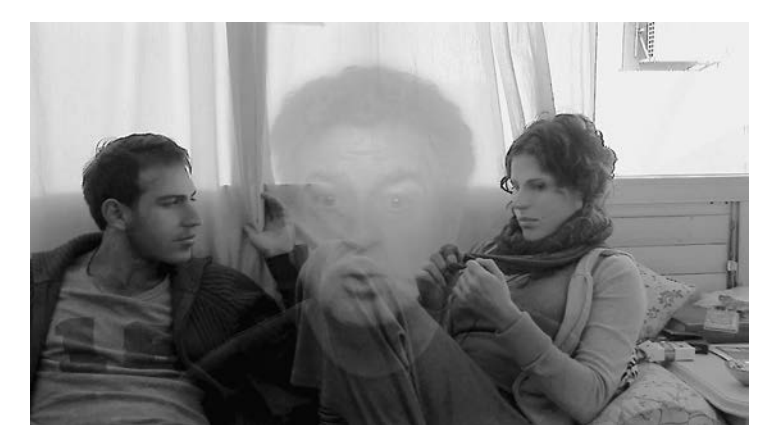
Giving cinematic shelter to a murderer? The director in Z_32 .

As it suggests the apotropaic function of the mask (to ward off evil), the psychoaesthetic shift in Z <sub>3</sub>2 to more "face-like" digital masks hints at constant dialectics with evil and exorcism. Is disclosure (of booby traps, of the atrocity, of the dead, of the perpetrator, of those hiding him) evidence of a culture that fetishizes the act of concealment? At the height of this process of masking, Mograbi superimposes his face between the ex-soldier and his girlfriend, reflecting on the contrast between the faceless masks and his face, literalizing his position as an intermediary.