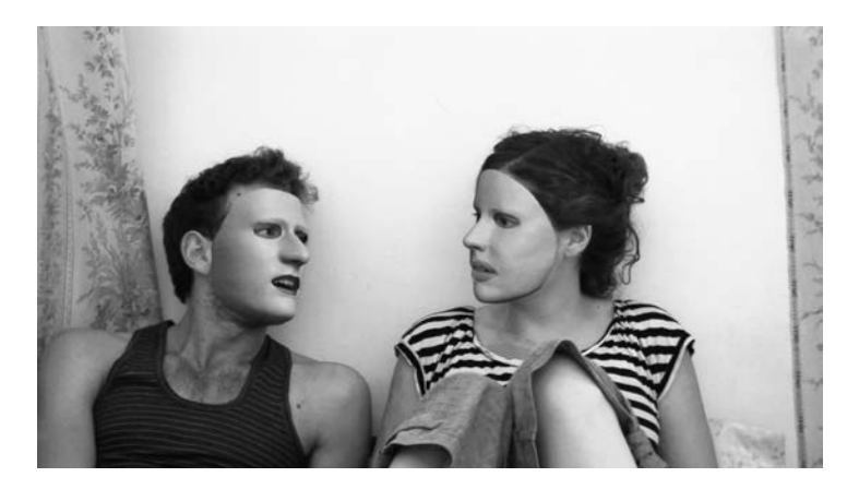
Mask-to-mask: guilt transference in Z <sub>3</sub>2 (dir. Avi Mograbi, France/Israel, 2008).