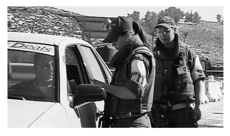
Women soldiers at the checkpoint in To See If I'm Smiling (dir. Tamar Yarom, Israel, 2007).

As in this case, the women attest to a sense of selfhood that was fundamentally enmeshed in violent circumstances by their surrounding militarily disciplined world and the gendered reality of the intifada.