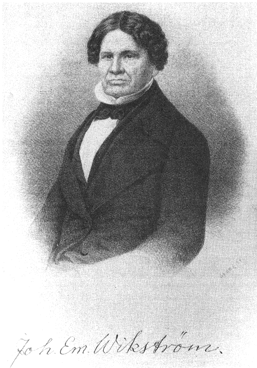
FIGURE 1. Johan Emanuel Wikström. Lithograph by O. Cardon. Original in the collection of portraits at the Bergius Foundation, Stockholm. Used with permission.

Wikström also taught natural history at the Stockholm secondary school from 1821 to 1843. For want of subsidies, he taught two-thirds of this time without salary; he had accepted the mastership solely out of devotion to science and youth.