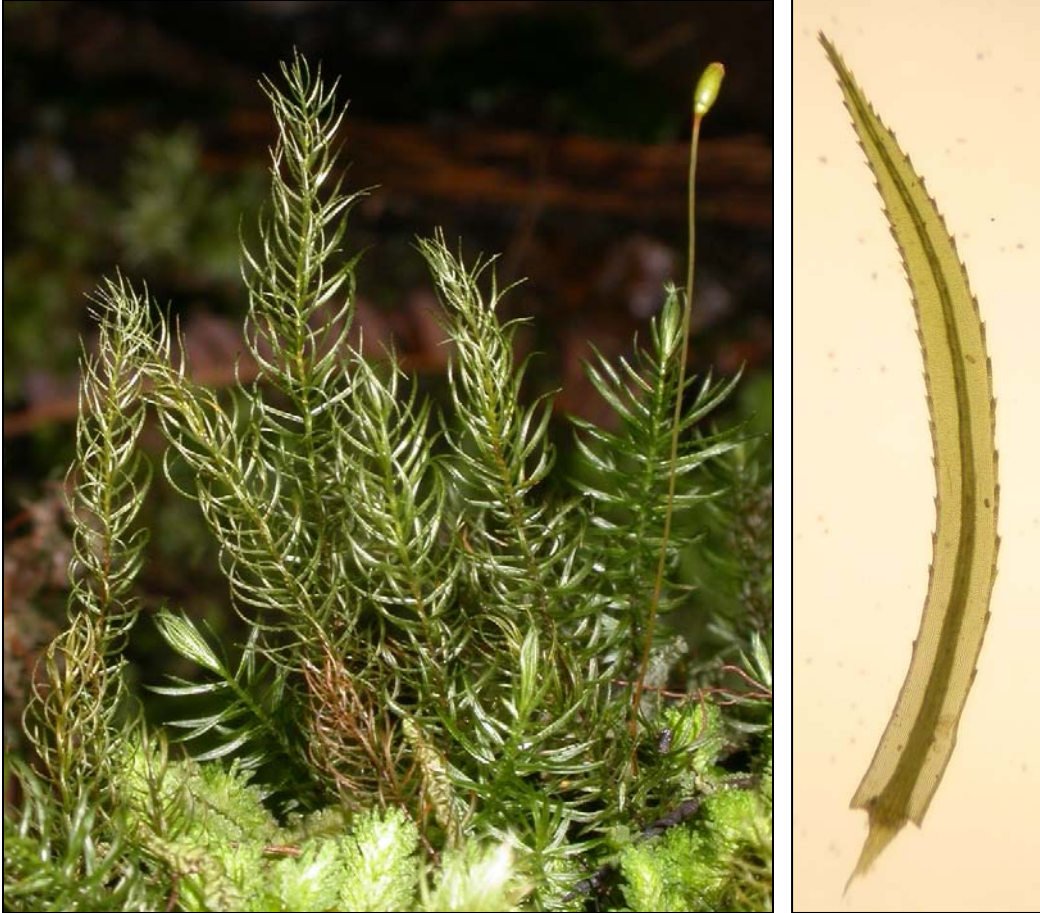
Figure A15. Pyrrhobryum spiniforme from Olaa Trench. Leaf microphotograph from Oahu specimen.