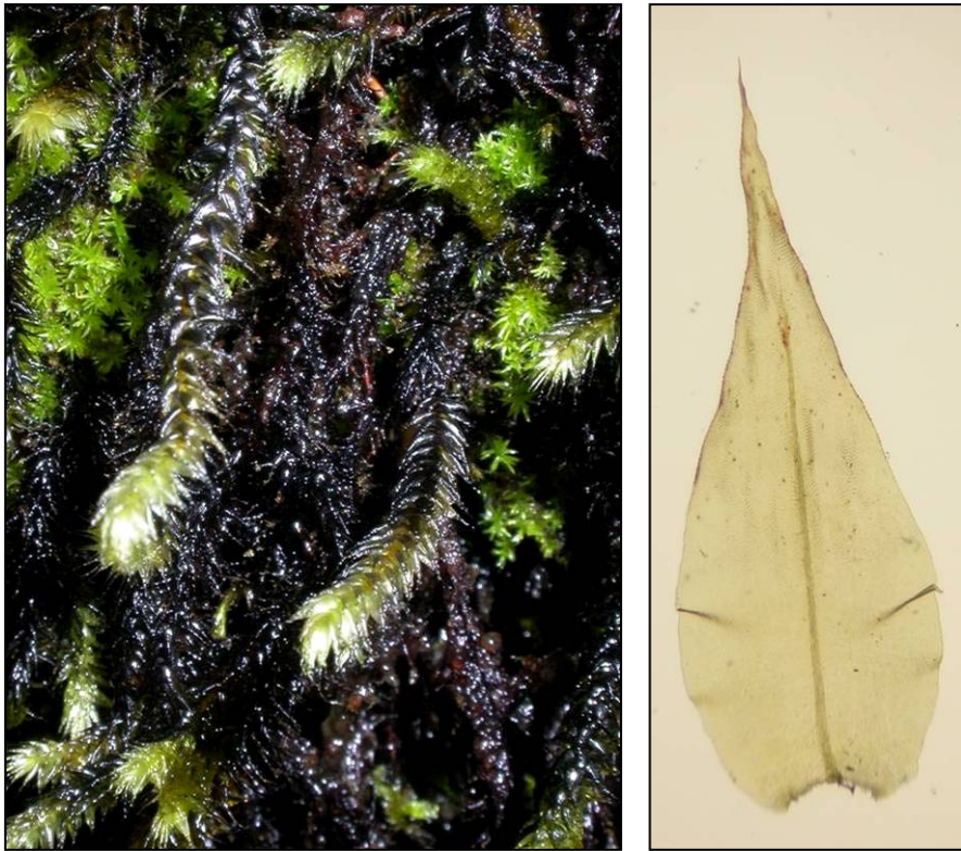
Figure A2. Aerobryopsis subdivergens ssp. scariosa from Olaa Trench. Leaf microphotograph from Oahu specimen.