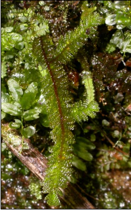
Figure A3. Baldwiniella kealeensis from Olaa Trench