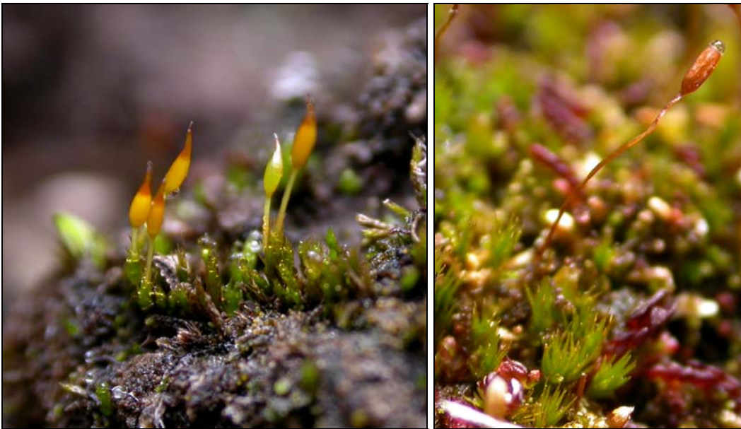
Figure A4. Brachymerium exile with immature sporophytes from West Kahuku and with mature sporophytes from Crater Rim Trail.