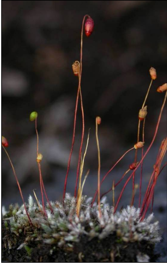
Figure A5. Bryum argenteum var. lanatum from West Kahuku.