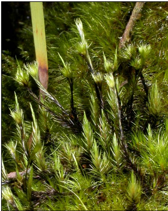
Figure A6. Campylopus umbellatus from Olaa Trench.