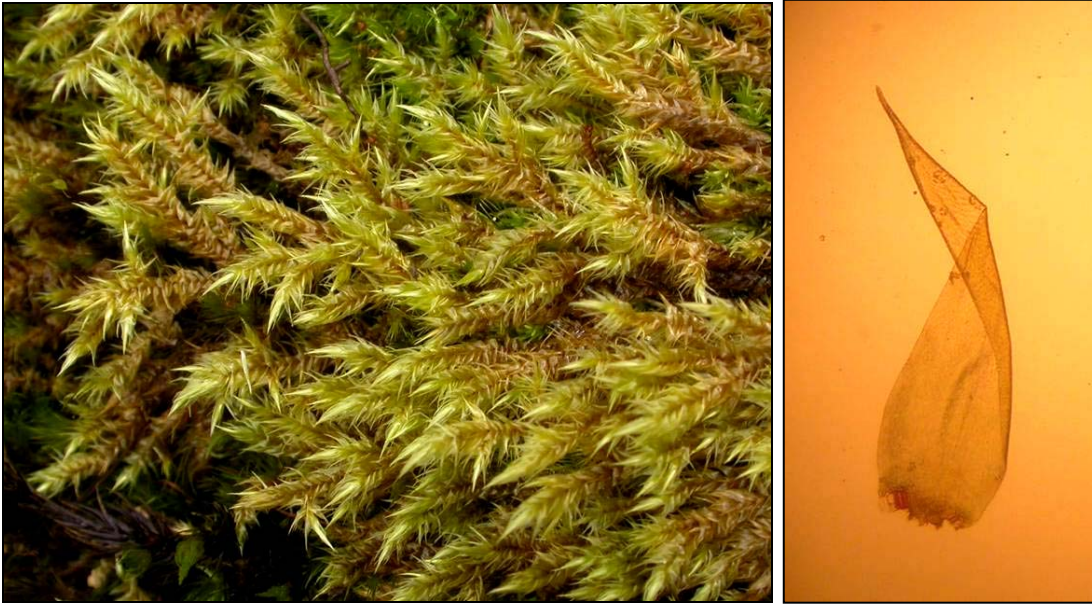
Figure A1. Acroporium fuscoflavum from Olaa Trench. Leaf microphotograph from Oahu specimen.