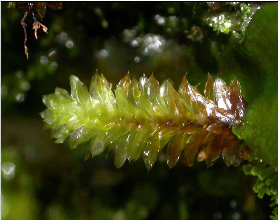
Figure A8. Distichophyllum freycinetii from Thurston Lava Tube area.