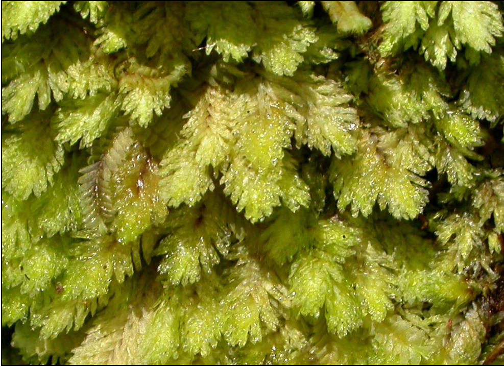
Figure A9. Distichophyllum paradoxum from Thurston Lava Tube area.