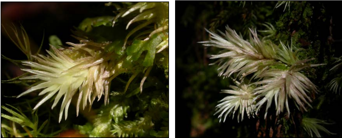
Figure A10. Leucobryum seemanii from Thurston Lava Tube area.