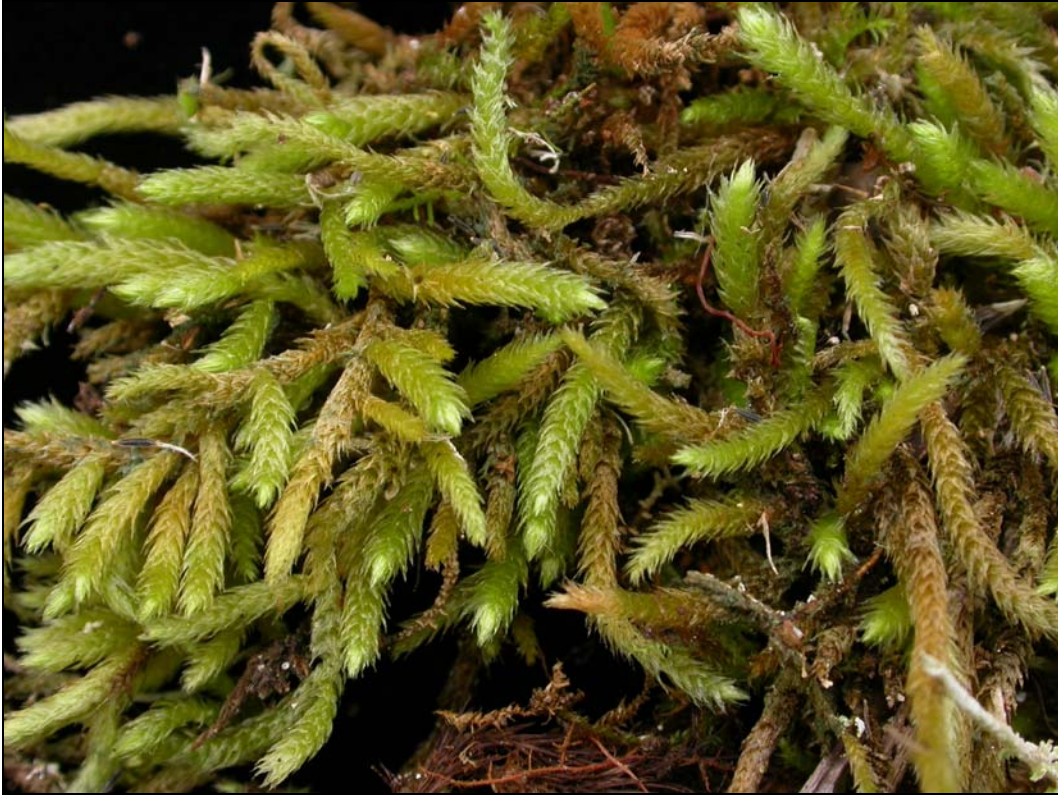
Figure A11. Palamocladium wilkesianum from West Kahuku.