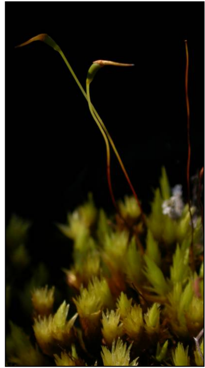
Figure A7. Dicranum speiophyllum from West Kahuku.