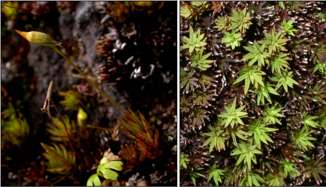
Figure A13. Pogonatum tahitense from Crater Rim Trail.