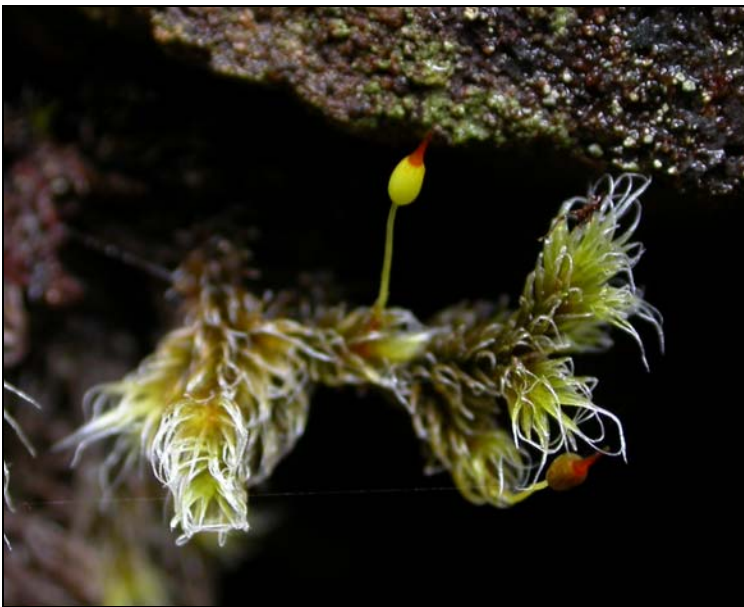
Figure A16. Racomitrium lanuginosum with sporophytes, West Kahuku.