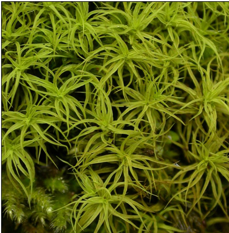
Figure A14. Pseudosymblepharis angustata from Olaa Trench.