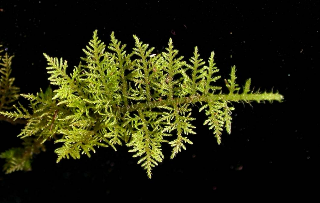
Figure A17. Thuidium cymbifolium . This photograph from plant collected on Oahu