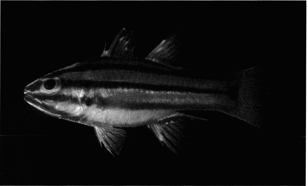
FIGURE 3. Holotype of Apogon relativus , BPBM 11699, 71.8 mm, Fatu Hiva, Marquesas Islands.

359800, 11: 21.3–75.5 mm, Nuku Hiva, Taipi Vai, Haka Puuae, rotenone, D. W. Strasburg, Charles H. Gilbert Cruise 30, 9 September 1956; AMS I.39937-001, 12: 22.2–66.5 mm, Nuku Hiva, Taiohae Bay, coral reef, 0.3–3 m, rotenone, crew of Charles H. Gilbert , Cruise 54, 11 October 1961; CAS 211005, 14: 21.6–65.8 mm, same data as preceding; BPBM 38690, 4: 69.2–73.8 mm, same data as holotype; BPBM 11030, 9: 23.9–71.3 mm, Ua Pou, S side of Vaeho Bay off entrance to large cave, rocky shore in 0–9 m, rotenone, J. E. Randall, D. B. Cannoy, G. S. Haywood, and J. D. Bryant, 29 April 1971; MNHN 2000-190, 6: 57.0–68.8 mm, Nuku Hiva, Taiohae Bay, W side near head of bay, 1–2 m, rotenone, J. E. Randall and J. D. Bryant, 10 May 1971; NSMT-P 59101, 52.0 mm, Nuku Hiva, Taiohae Bay, rocky shore to nearby zone of large heads of Porites , 0–2 m, rotenone, J. E. and H. A. Randall, 19 May 1971; BPBM 38518, 2: 34.0–36.7 mm, Eiao, about one-half mile S of Vaituha Bay, boulder bottom, 7 m, rotenone, J. E. Randall and J. L. Earle, 7 October 1998.