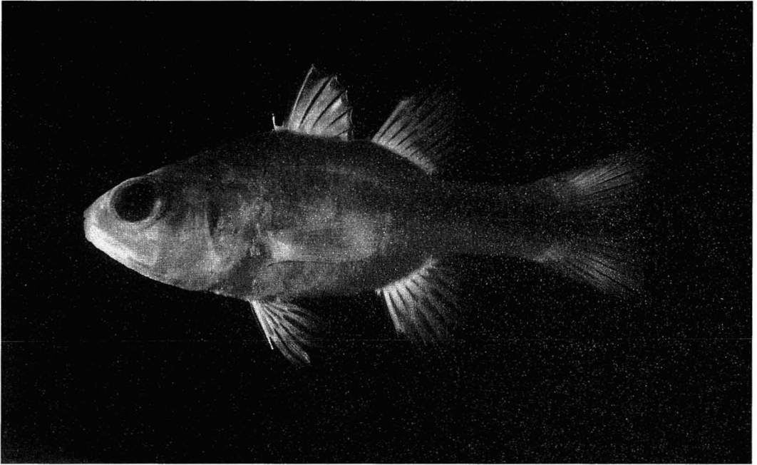
FIGURE 1. Holotype of Apogon lativittatus , BPBM 11665, 54.3 mm, Fatu Hiva, Marquesas Islands.

proportions in the text are step-in measurements rounded to the nearest 0.05. Data in parentheses in the descriptions refer to paratypes if different from the holotype.