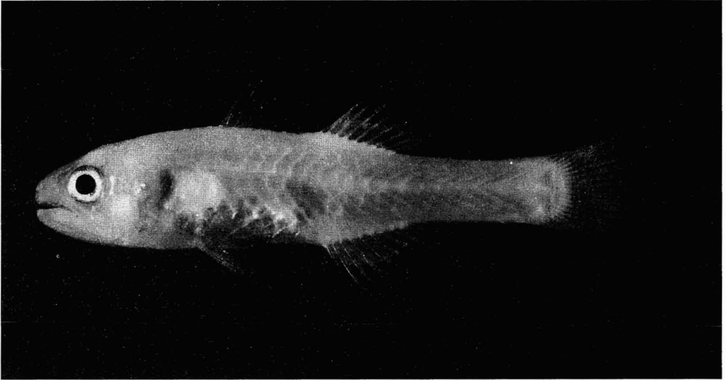
FIGURE 5. Holotype of Pseudamiops phasma , BPBM 12651, 33.7 mm, Nuku Hiva, Marquesas Islands.

Mouth large, the maxilla extending beyond a vertical at posterior edge of orbit, the upper-jaw length 1.7 in head; mouth very slightly inferior and moderately oblique, the gape forming an angle of about 20^\circ to horizontal axis of head and body; supramaxilla absent; posterior end of maxilla truncate, the lower corner angling ventrally as a broad V-shaped flat spine with an acute point; jaws with one to two irregular rows of small conical teeth, the front of upper jaw with three pairs of long slender canines that are sessile and inward-projecting; lower jaw with an inner row of larger, well-spaced, incurved teeth, those at front of jaw moderately large, those on side of jaw increasing to longest about halfway back in jaw; vomer with a V-shaped patch of very small conical teeth in 2 rows; palatines with an irregular row of very small conical teeth. Free part of tongue a slender knob. First gill raker on lower limb longest (one at angle nearly as long), about 1.5 in orbit diameter.