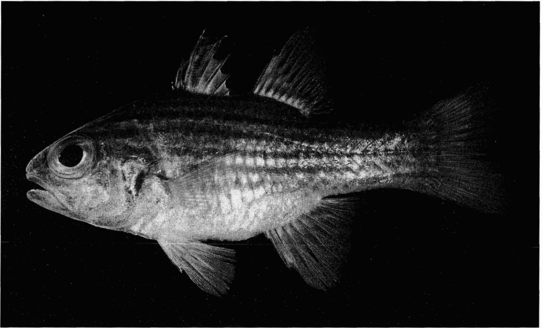
FIGURE 4. Holotype of Apogon sinus , BPBM 12117, 80.5 mm, Hiva Oa, Marquesas Islands.

the two species are generally found. All of the type specimens of Apogon relativus were collected in less than 9 m. Allen (1997:102) reported Apogon angustatus as occurring "usually below 10–15 m depth." Of 20 lots of this species at the Bishop Museum, three were taken in 8–11 m, 11 in 15–27 m, and six in 30–40 m. Eichler and Myers (1997:126) gave the maximum depth as 65 m.