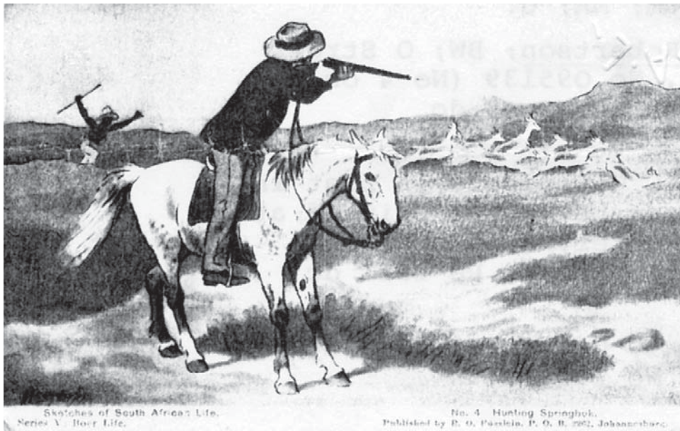
Figure 6: ‘Sketches of South African Life: Hunting Springbok’ (c. 1908)

The role of the colonial underclass in the springbok Hunt was that of driver (as pictured here) or achter ryder . This image is something of a caricature of the well-defined racial roles of the rural Cape Colony, with the comic, shirtless figure of the ‘nigger’ juxtaposed with the sure and composed figure of the sportsman.