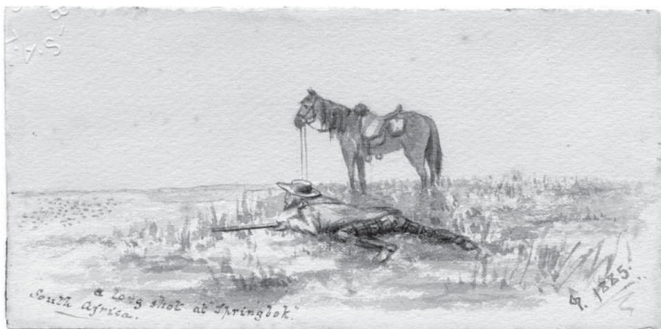
Figure 1: ‘A long shot at springbok’

This sketch depicts the utilitarian springbok shooting that occurred throughout the period but which was characteristic of the earlier stages. Worthy of note here is the flat open terrain that, in springbok hunting, necessitated either the kind of ambush or stalk portrayed here or the kinds of drives described later.