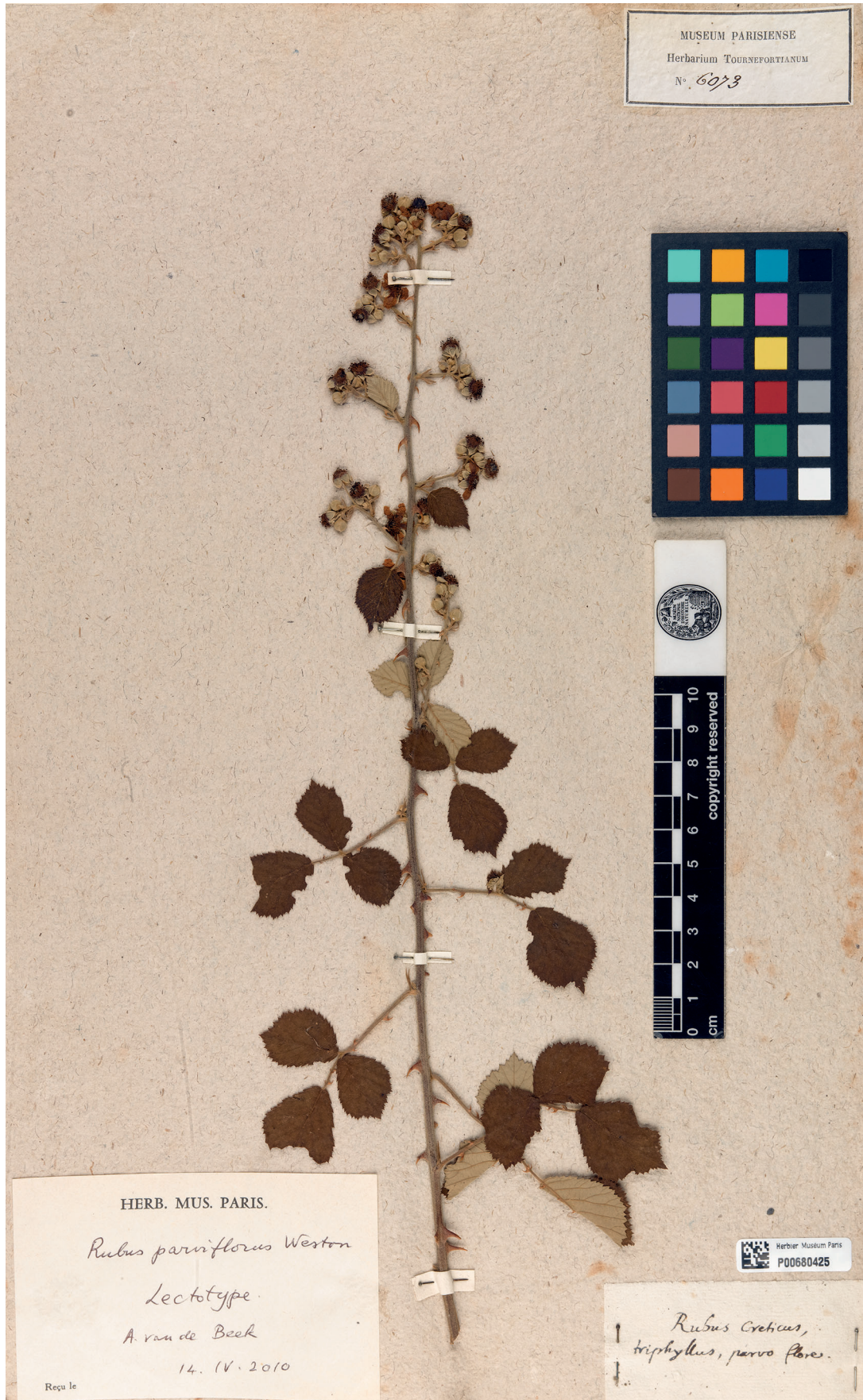
Fig. 6. — Lectotype of R. creticus Tourn. ex L. (P00680425).