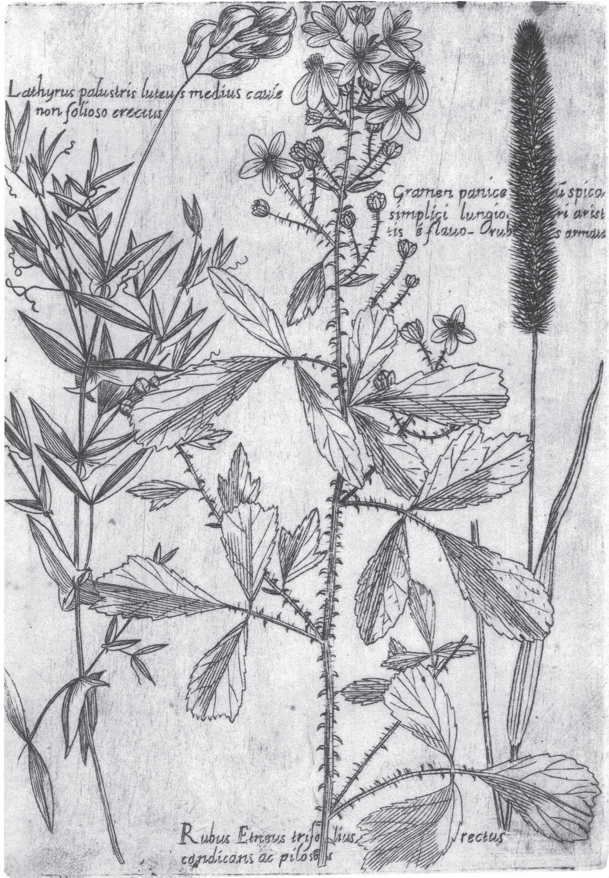
FIG. 4. — Neotype of R. aetnicus Cupani ex Weston.