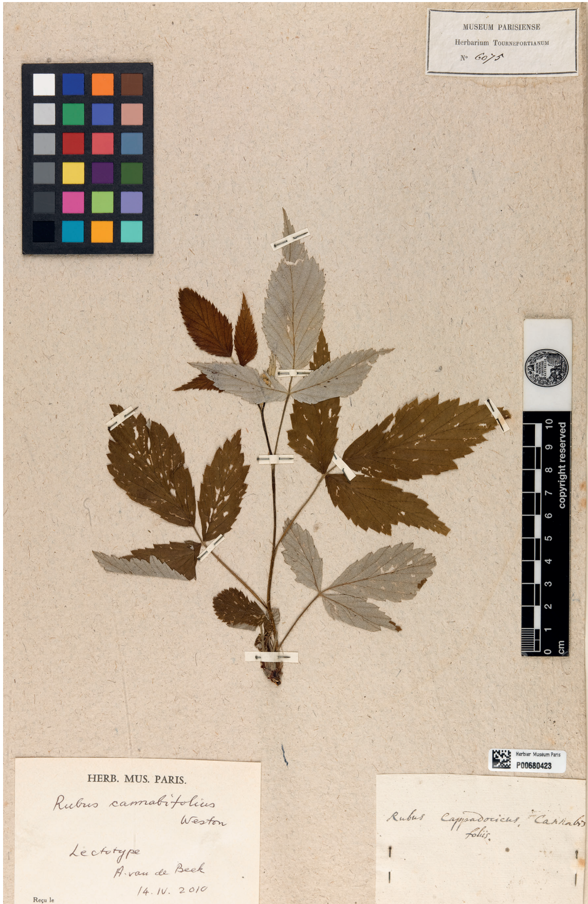
FIG. 8. — Lectotype of R. cannabifolius Tourn. ex Weston (P00680423).