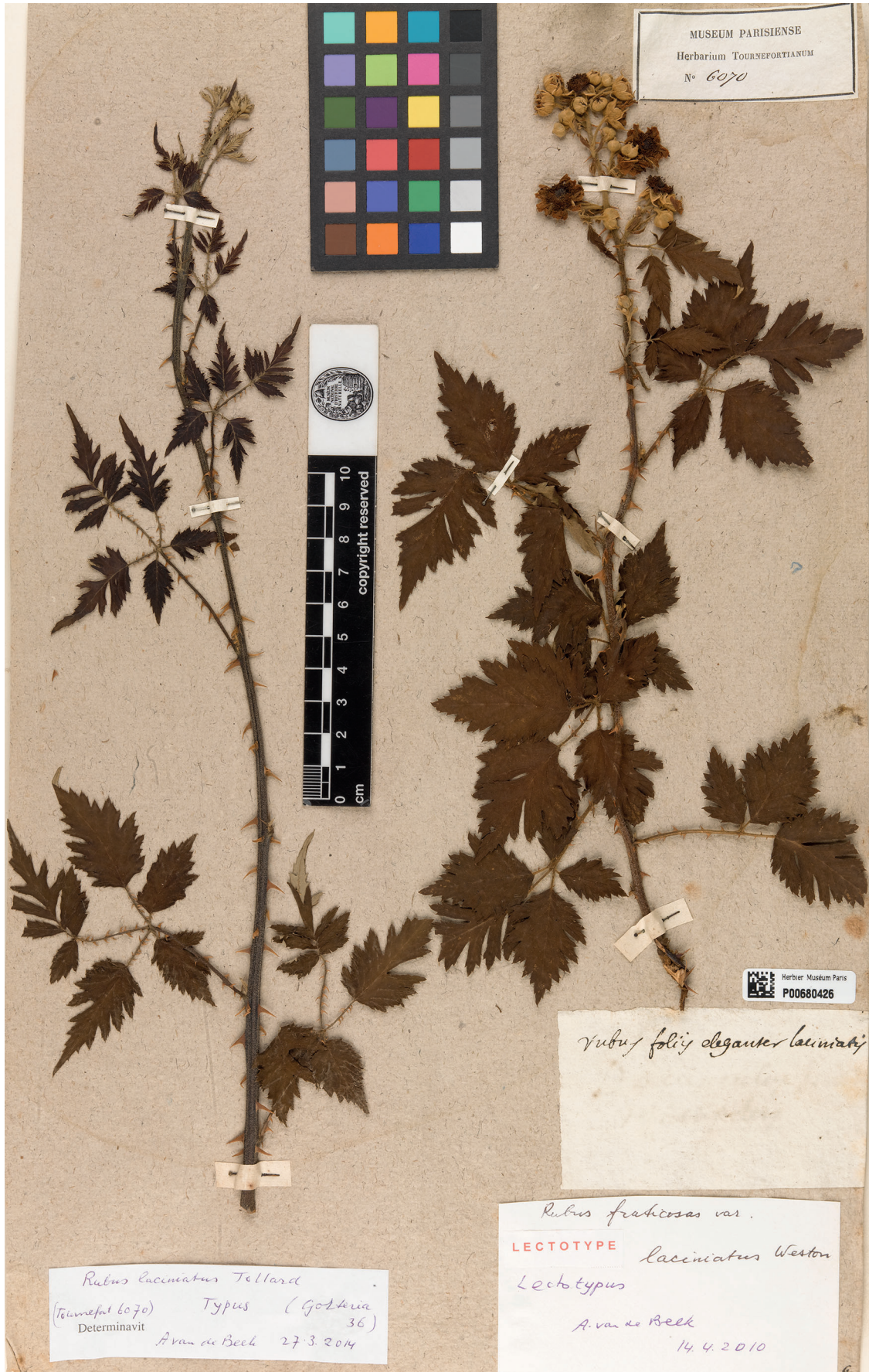
FIG. 3. — Lectotype of R. ulmifolius f. laciniatus (Tourn. ex Weston) A.Beek (P00680426).