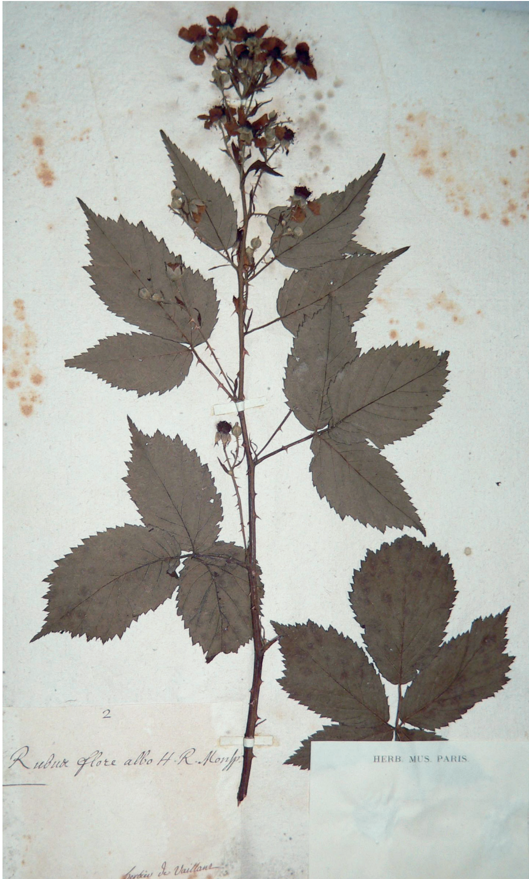
FIG. 1. — Lectotype of R. fruticosus var. albus Tourn. ex Weston.