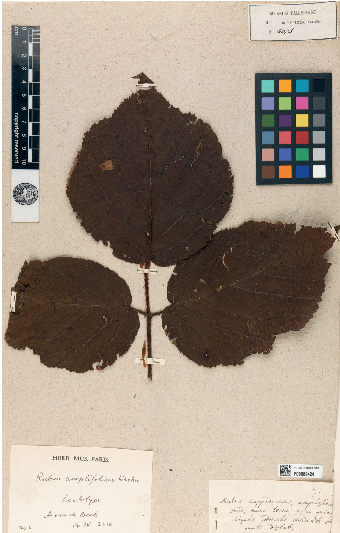
FIG. 7. — Lectotype of R. amplifolius Tourn. ex Weston (P00680424).