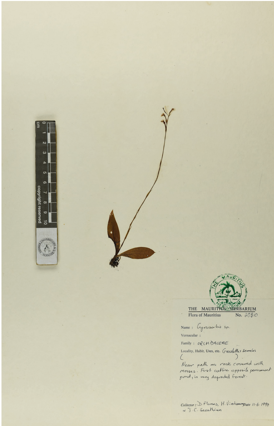
FIG. 2. — Cynorkis flexuosatis (Thouars) Hermans: only known specimen (MAU22810).