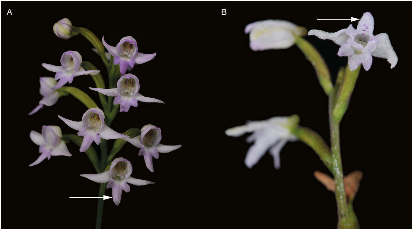
FIG. 3. — A , Cynorkis trilinguis (Frapp.) Schltr.; B , Cynorkis coccinelloides (Frapp.) Schltr. Arrows indicate the labellum.

Hemipervis exilis Frapp., Orchidées de l'Île de La Réunion : 11 (Frappier 1880), nomen nudum ; Frapp. in Cordem., Flore de l'Île de La Réunion : 238 (Cordemoy 1895), syn. nov. — Cynorkis exilis (Frapp.) Schltr., Beihfte zum Botanischen Centralblatt 33 (2): 400 (Schlechter 1915), syn. nov. — Type: France. La Réunion, Tampon, Pitons Mare à Boue, 1650 m, 1.III.2002, Pailler 36 (neo-, here designated: REU[REU017516]).