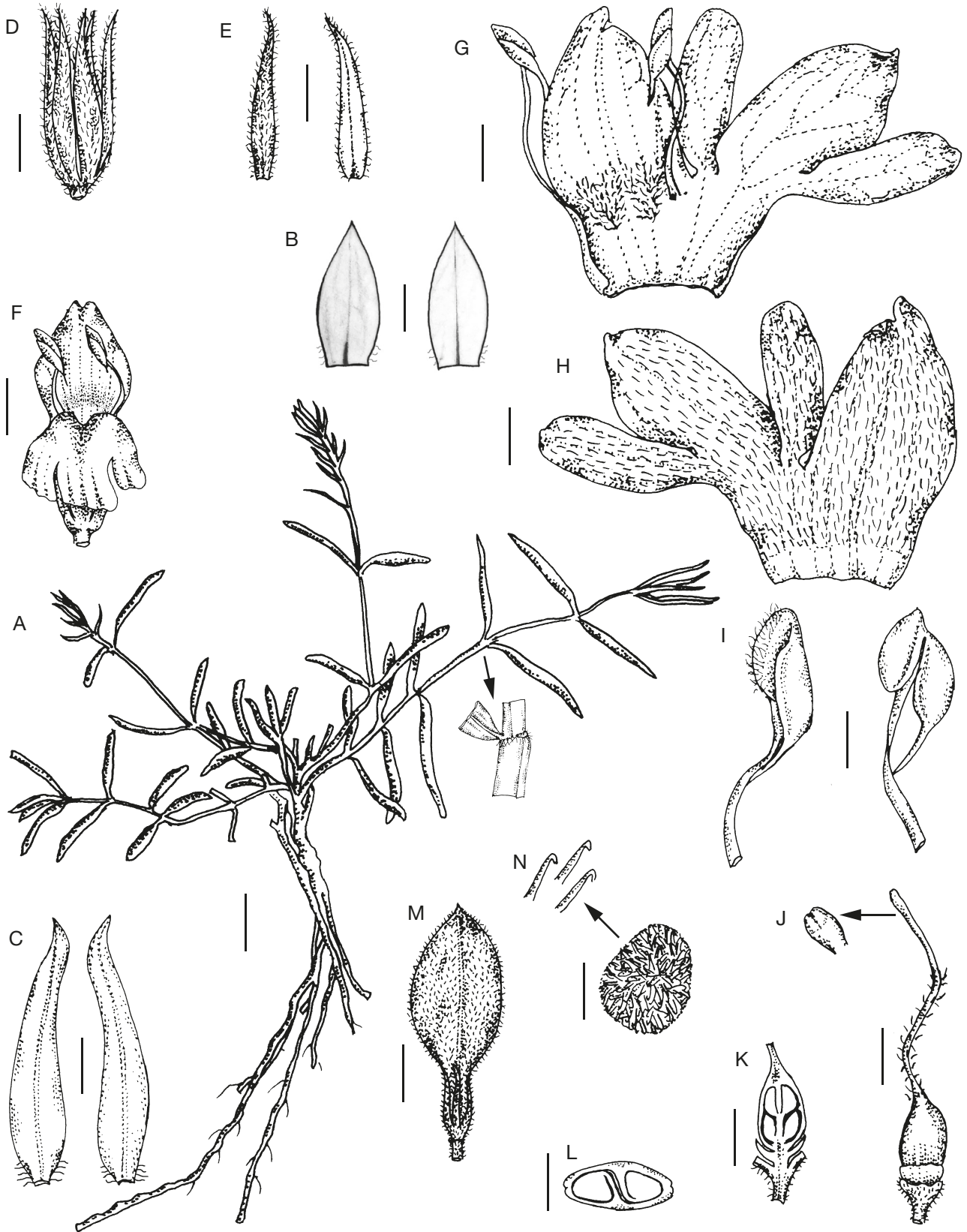
FIG. 1. — Justicia tamilnadensis P.Raja & Soosairaj, sp. nov.: A , habit; B , bract dorsal and ventral views; C , bracteoles; D , calyx; E , sepals dorsal and ventral views; F , corolla front view; G, H , corolla split open inner and outer views; I , stamens; J , pistil; K , l.s. of ovary; L , t.s. of ovary; M , capsule; N , seed; A–J , drawn from type P. Raja & S. Soosairaj 4760 . Scale bars: A , 14.3 mm; B , 2 mm; C, F, G, H, M, N , 2.5 mm; D, E, I, J , 1.25 mm; K , 1 mm; L , 0.67 mm.