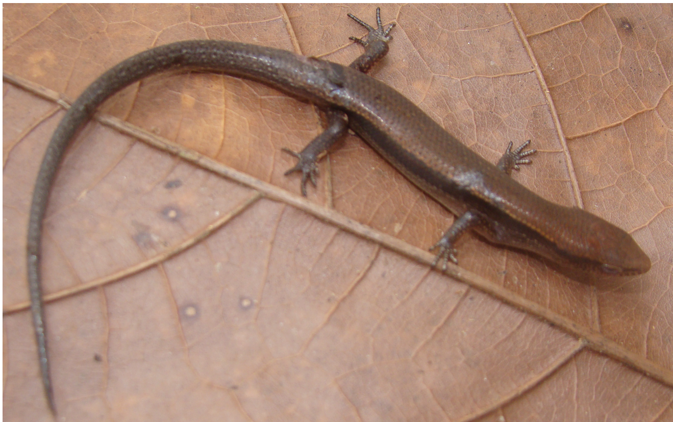
FIG. 5. — Panaspis togoensis (Werner, 1902).