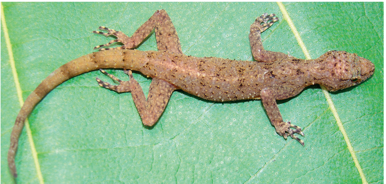
FIG. 7. — Cnemaspis spinicollis (Müller, 1907).

These localities are situated in the ecological zones III and V. Specimens of Hemidactylus albituberculatus were previously recorded in Togo (Segniabeto 2009) but identified wrongly as Hemidactylus angulatus Hallowell, 1854.