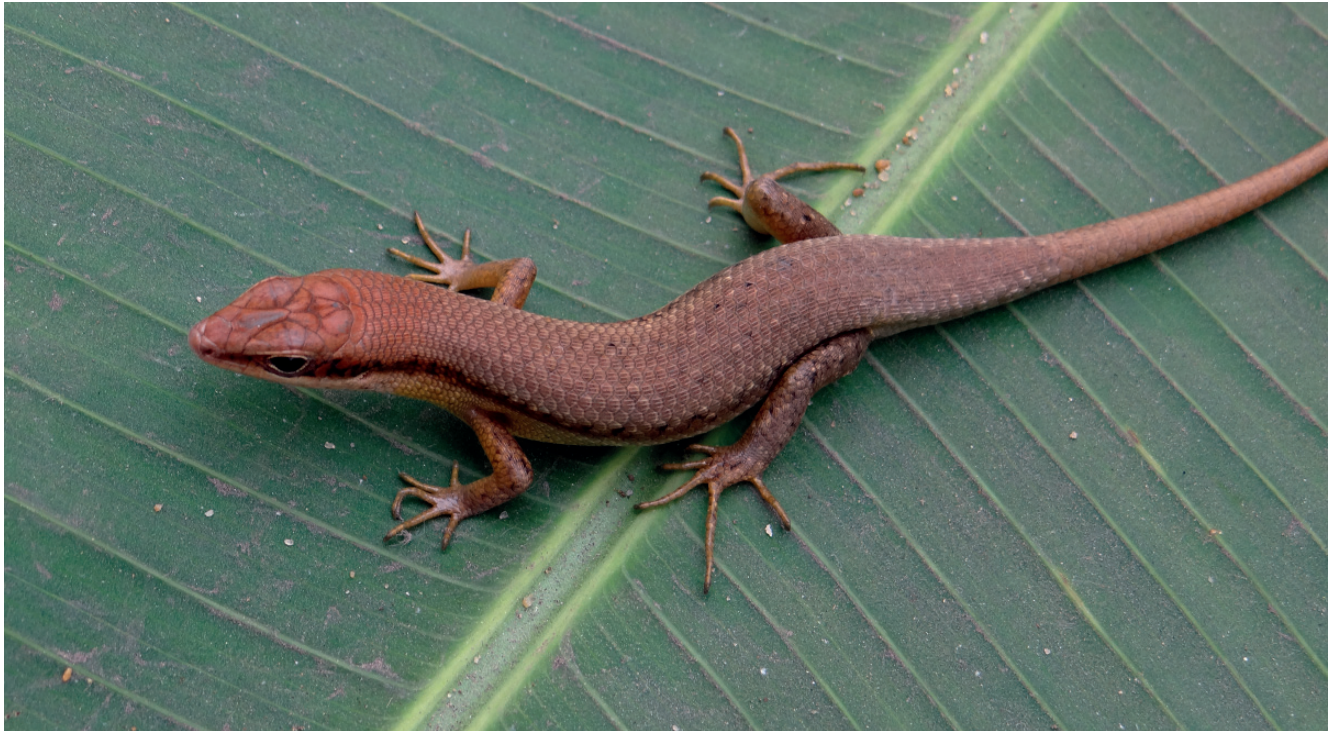
FIG. 3. — Trachylepis maculilabris (Gray, 1845).