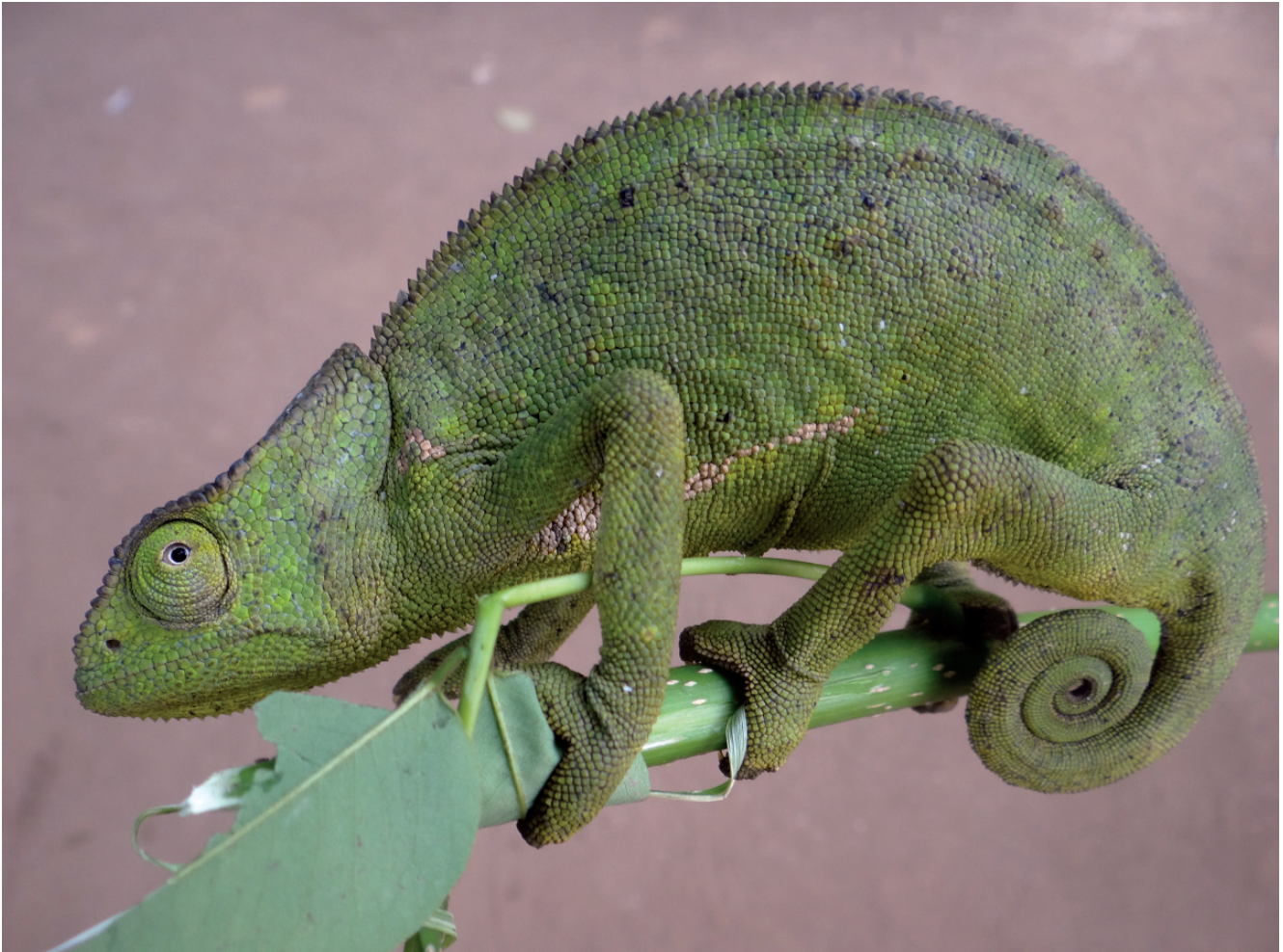
FIG. 15. — Chamaeleo gracilis Hallowell, 1842.