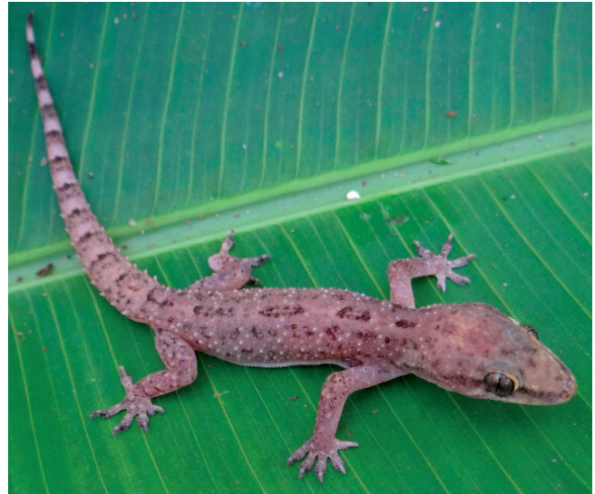
FIG. 8. — Hemidactylus angulatus Hallowell, 1854.

HABITATS AND DISTRIBUTION. — The single Togolese specimen of this species, recently described from Ghana and Togo, was collected in Assoukoko forest. This hilly forest is moist semi-deciduous, and is situated in the Togo Hills at the border between Togo and Ghana. This forest is nearby the type locality of this species, i.e. Kyabobo National Park. According to Wagner et al. (2014), the specimens of the species have been recorded in Misahohe, Bafilo in Togo. Based on these data, it is clear that the distribution area of this species included the Ecological zones IV and II of the country.