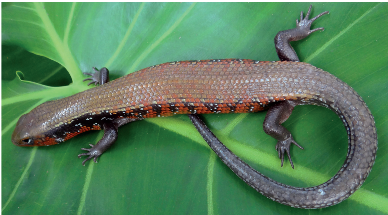
FIG. 4. — Lepidothyris fernandi (Burton, 1836).

regions in Africa (western Ghana, Ivory Coast, Liberia) than does T. polytropis (see Hoogmoed 1978).