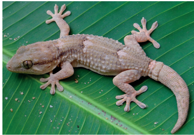
FIG. 14. — Tarentola ehippiata O'Shaughnessy, 1875.

not confirmed. It was first recorded in Togo by Tornier (1901) for Sokodé, Kété-Kratchi (today in Ghana), and Mango. Loveridge (1947), Grandison (1956) and Bauer et al. (2006) mentioned its presence in Togo as well. This species is intensively harvested for the international pet trade; for instance, between 2000 and 2005, a total of 2485 live specimens were exported according to the CITES commission of the DFC of the Ministère de l'Environnement.