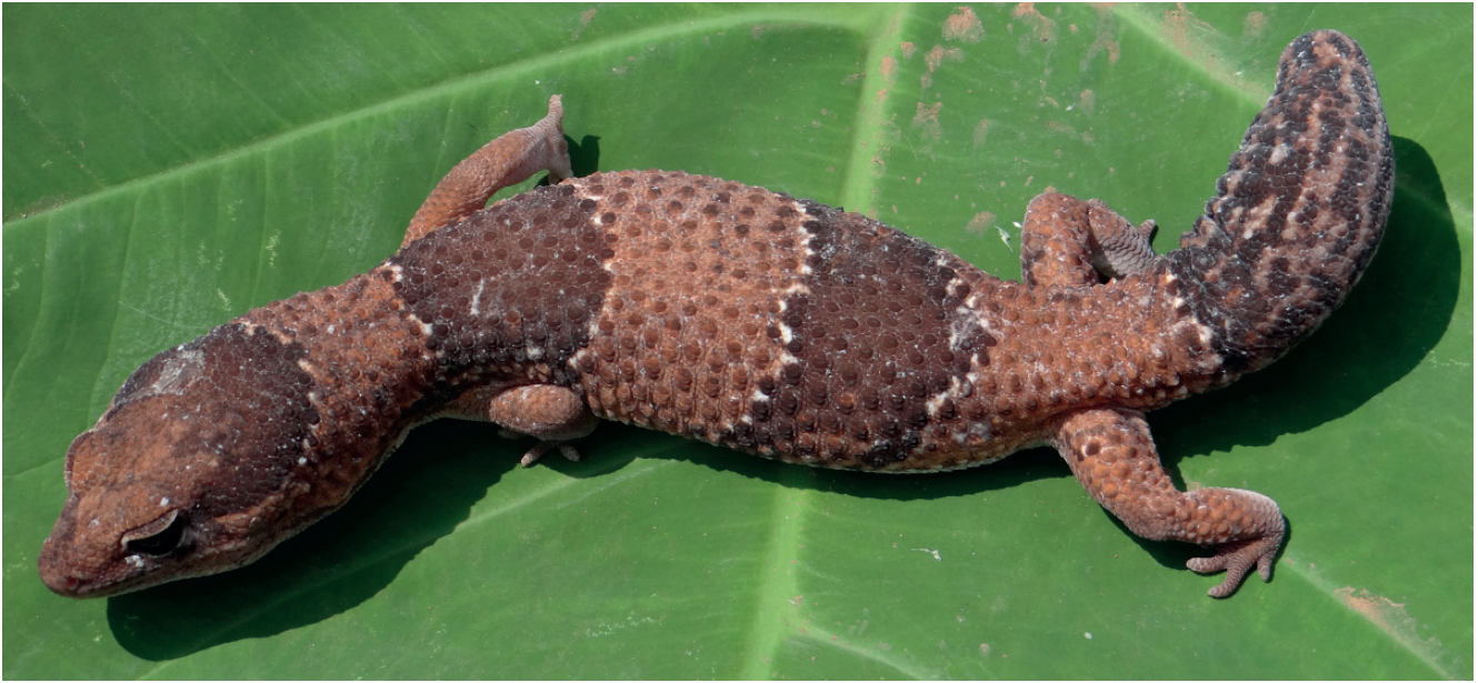
FIG. 12. — Hemitheconyx caudicinctus (Duméril, 1851).