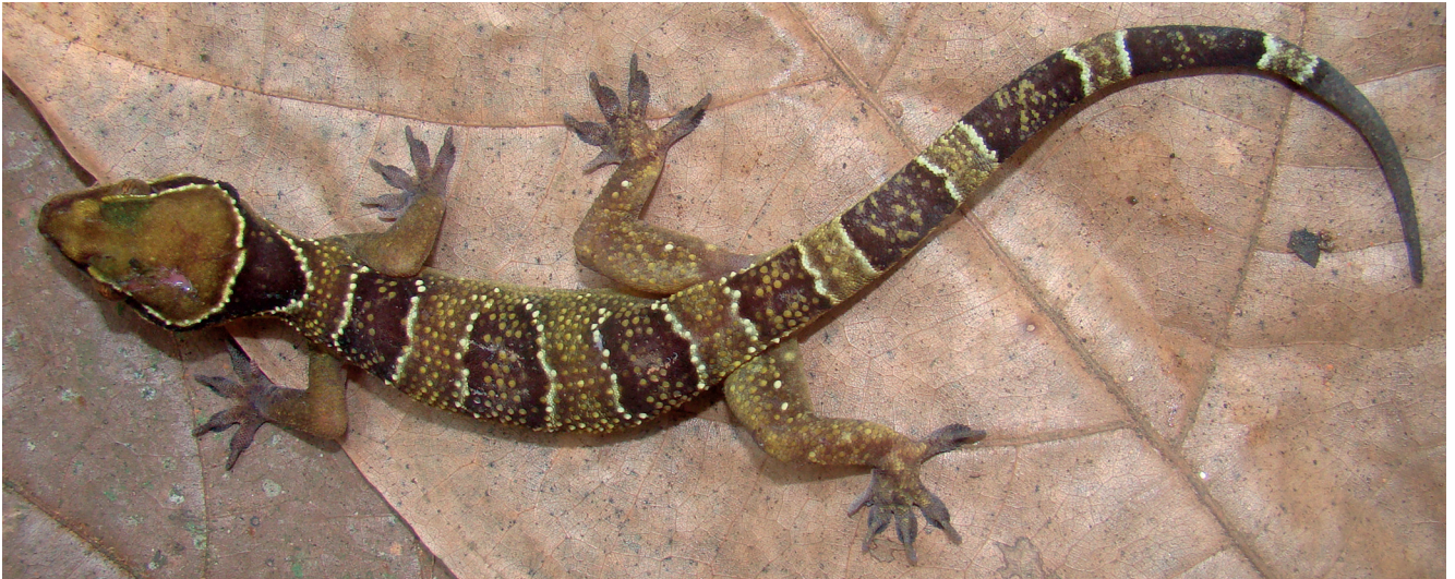
FIG. 10. — Hemidactylus kyaboboensis Wagner, Leaché & Fujita, 2014.