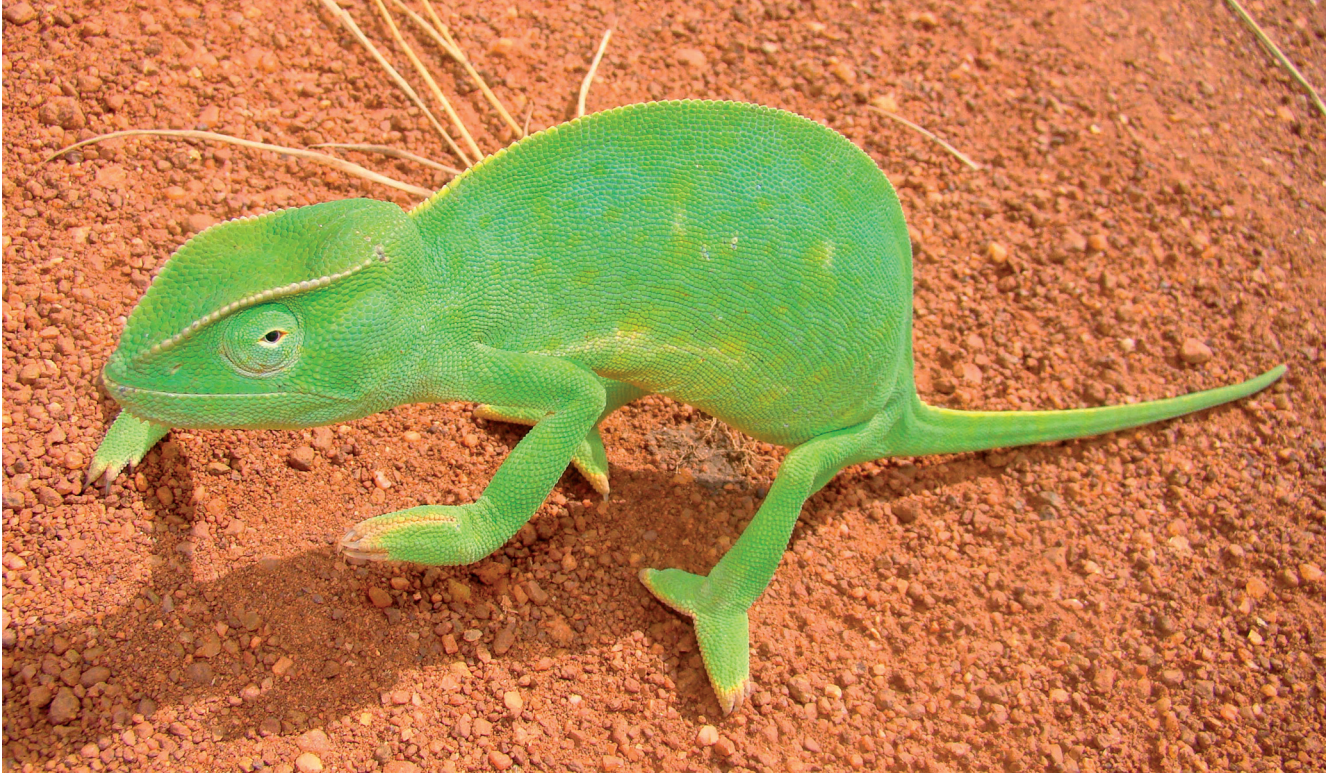
FIG. 16. — Chamaeleo senegalensis Daudin, 1802.

status. In Togo, it is found in the forests of ecological zone IV, as well as in the coastal marshlands and swamps and in the mangrove swamps. Its presence in Togo was first mentioned by Matschie (1891), and later by Tornier (1901) and Mertens (1942a-c) from Bismarkburg (Adélé) and Sebbe (Zébé actually Aného), under the synonymy of Varanus niloticus . Bayless (2002) confirmed its presence in the country. From the ecological point of view, it is noteworthy that in Togo this species occurs syntopically with Varanus niloticus (for instance, from Aneho: 06°13'44.30"N, 01°36'22.80"E to Yegue: 08°10'58.80"N, 00°38'60.00"E), whereas the two species always occur parapatrically or allopatrically in Nigeria (Angelici & Luiselli 1999). The diet of this species was studied in the mangrove and swamp forest habitats of southern Nigeria, and there it has been seen mainly feeding upon crabs (Luiselli et al. 1999). This species is certainly exploited for the international pet trade, but the number of exported individuals remains unknown given that they are exported under the V. niloticus quotas.