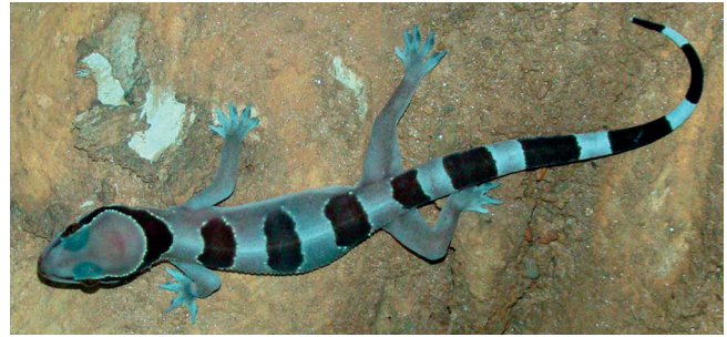
FIG. 9. — Hemidactylus fasciatus Gray, 1842.