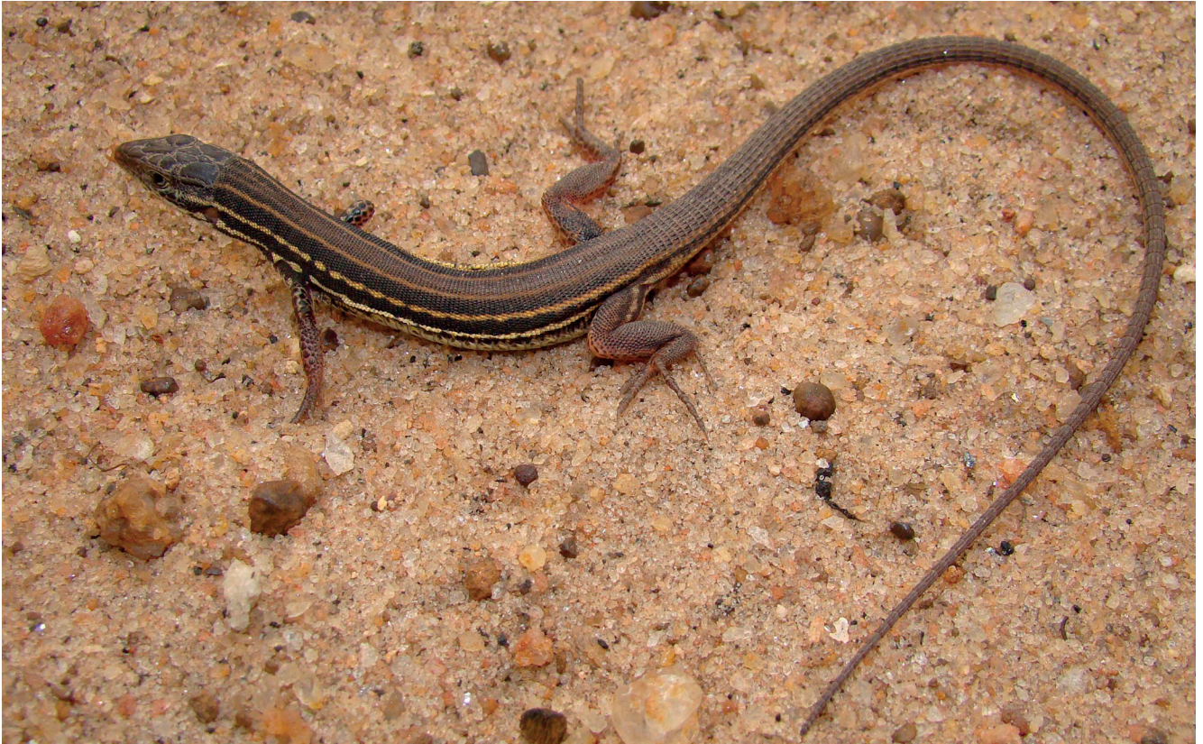
FIG. 6. — Heliobolus nitidus (Günther, 1872).