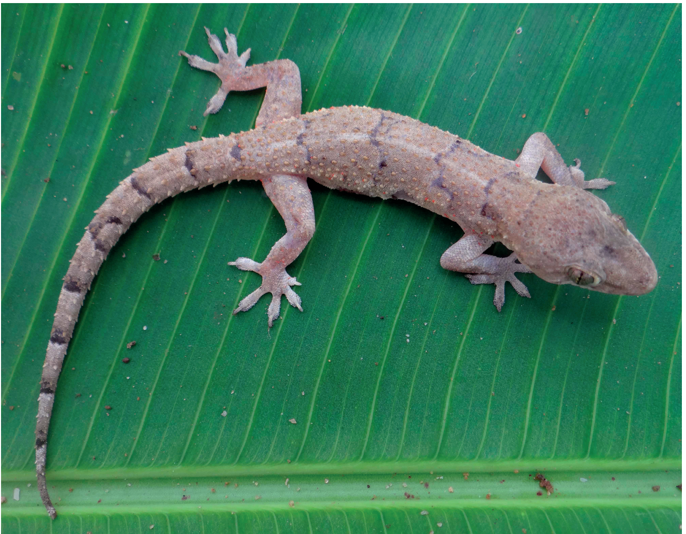
FIG. 11. — Hemidactylus mabouia (Moreau de Jonnés, 1818).