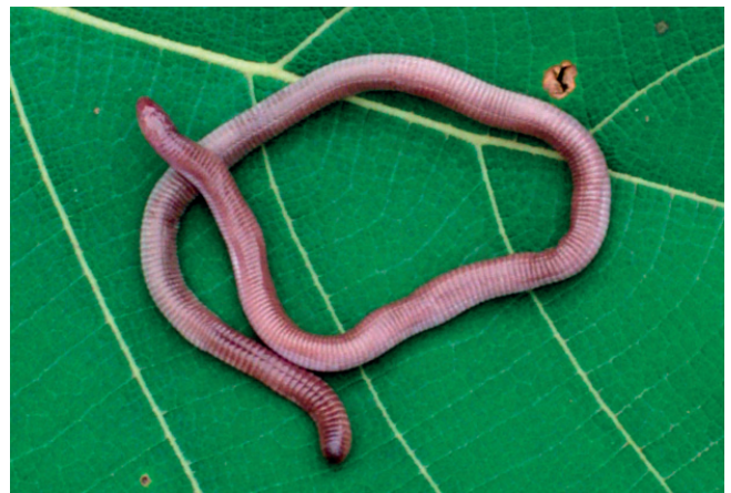
FIG. 17. — Cynisca leucura (Duméril & Bibron, 1839).

HABITATS AND DISTRIBUTION. — This species is found throughout Togo. It was, for example, captured at N'Gambi, Alédjo, Faza, and