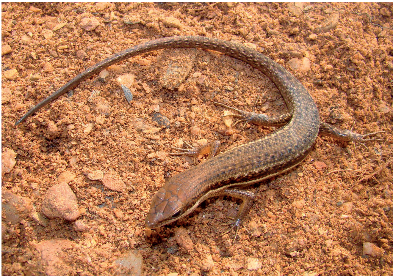
FIG. 2. — Trachylepis affinis (Gray, 1838).

according to Leaché et al. (2006). Further studies are needed to resolve this problem.