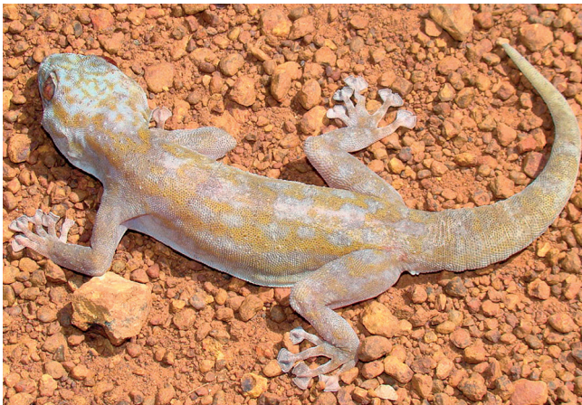
FIG. 13. — Ptyodactylus ragazzi Anderson, 1898.