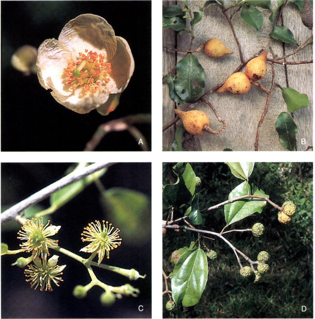
Fig. 3.—Photographs of Sphaerosepalaceae : A, Dialyceras coriaceum (Schatz 3848); B, D. parvifolium (Schatz 3082); C, Rhopalocarpus lucidus (Schatz 2472); D, R. thouarsianus (Schatz 3634).—A, photo P. LOWRY; B-D, photos G. SCHATZ.