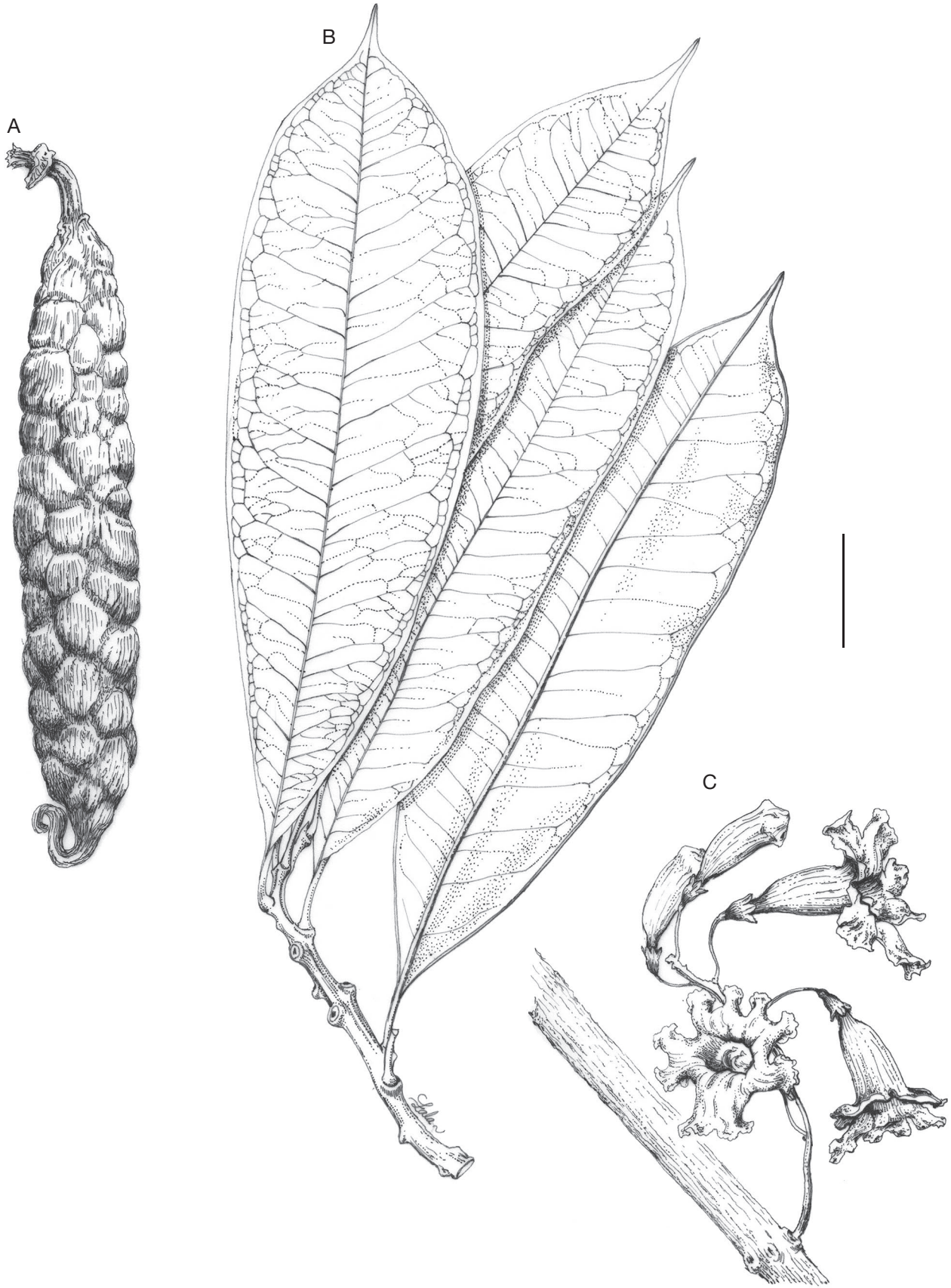
FIG. 2. — Phyllarthron longipedunculatum Callm. & Phillipson, sp. nov.: A , fruit; B , branch; C , cauliflorous inflorescence; A , Antilahimena et al. 414 (paratype, G); B , Antilahimena et al. 824 (paratype, TAN); C , Rakotovao et al. 3753 (paratype, P). Scale bar: 2 cm.