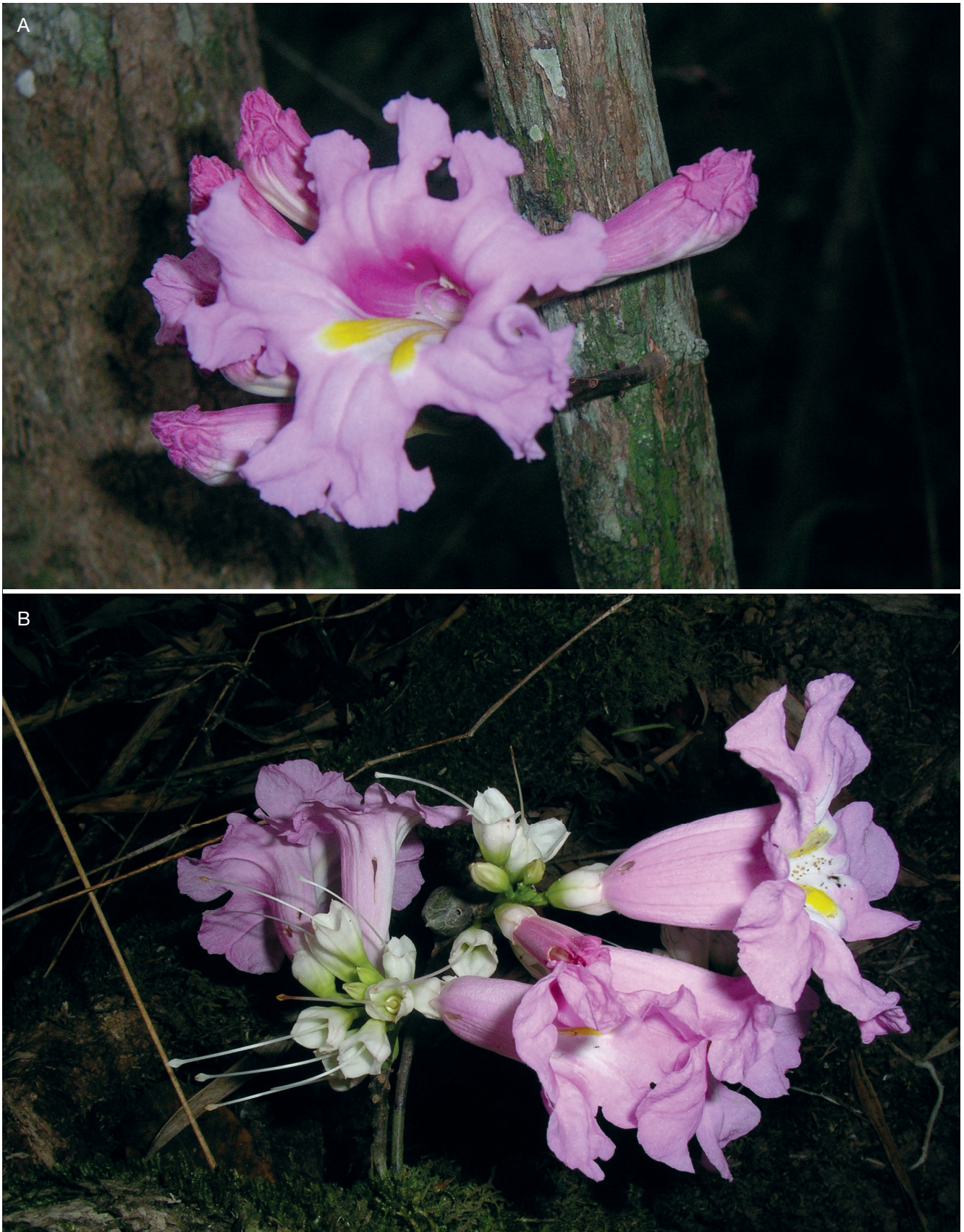
FIG. 3. — Phyllarthron longipedunculatum Callm. & Phillipson, sp. nov., living plant from Kalobinono ( Rakotovao et al. 3753): A , inflorescence on a trunk with buds and one open flower; B , another inflorescence with open and fallen flowers.