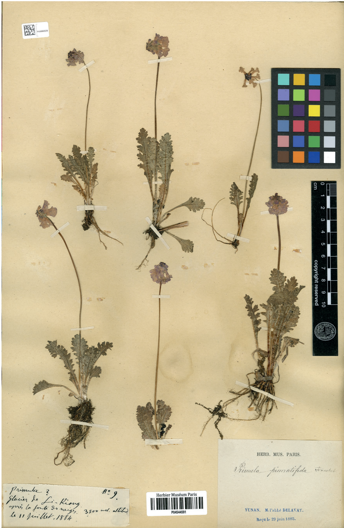
FIG. 6. — Lectotype of Primula pinnatifida Franch. (P04544591).