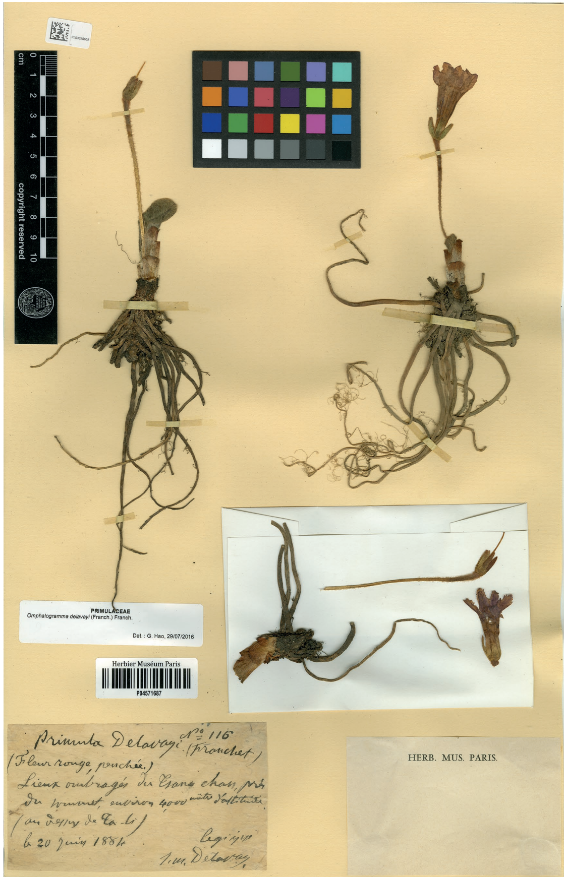
FIG. 4. — Lectotype of Primula delavayi Franch. (P04571687).