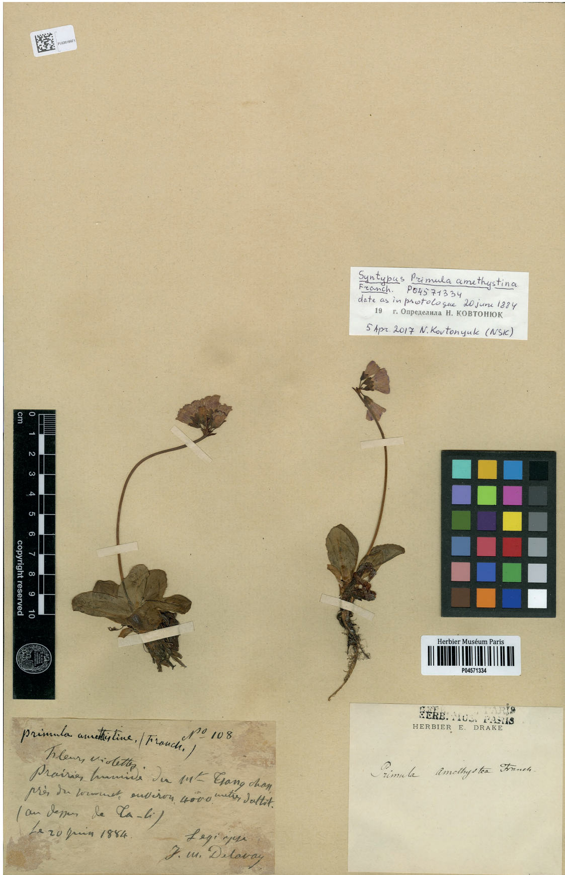
Fig. 1. — Lectotype of Primula amethystina Franch. (P04571334).