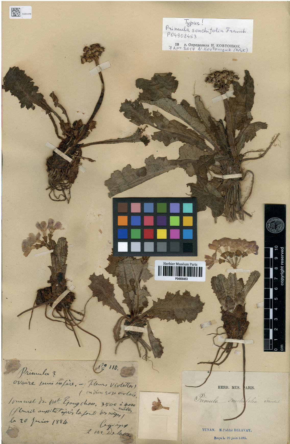
Fig. 9. — Lectotype of Primula sonchifolia Franch. (P04908453).