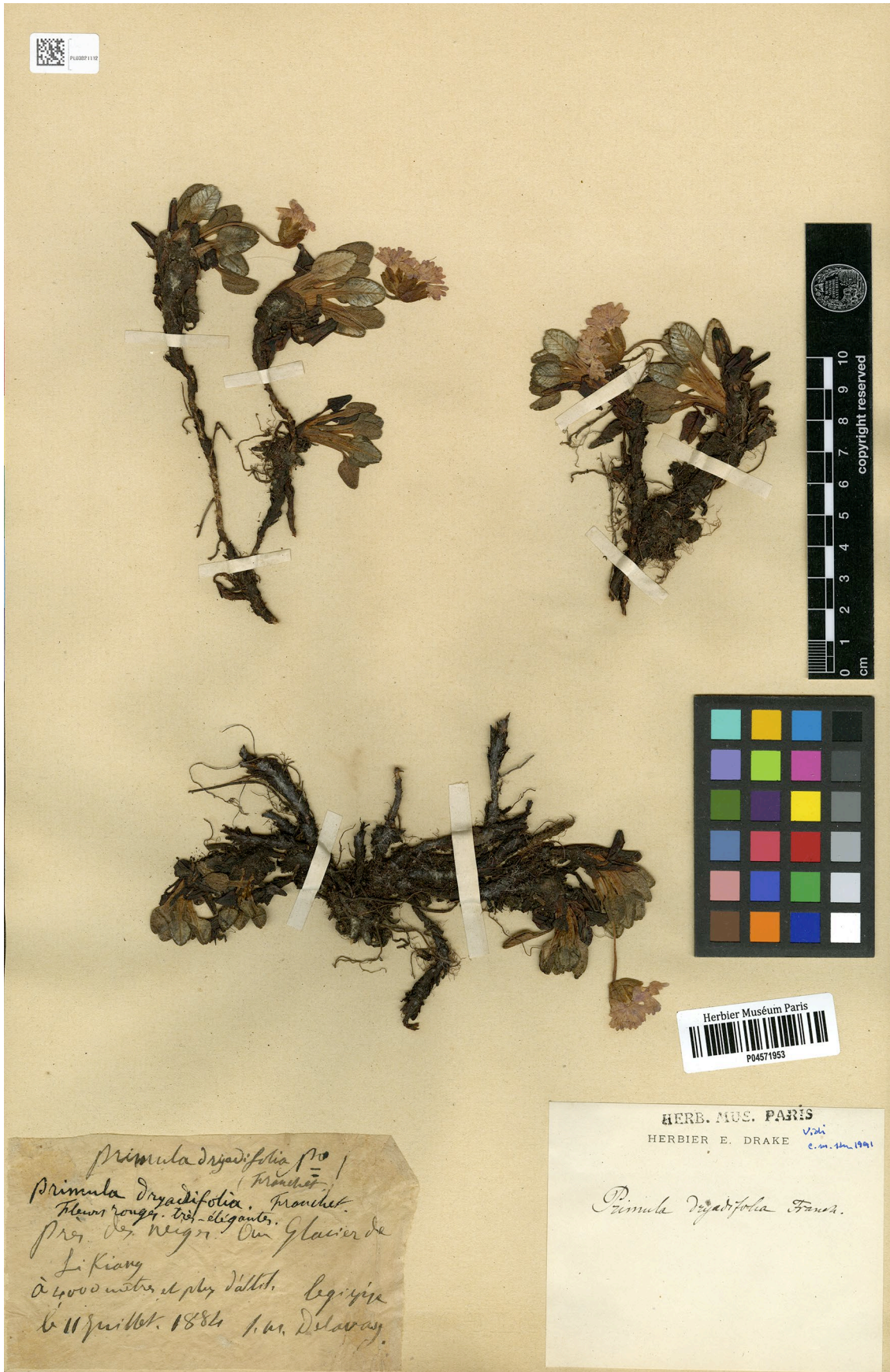
FIG. 5. — Lectotype of Primula dryadifolia Franch. (P04571953).