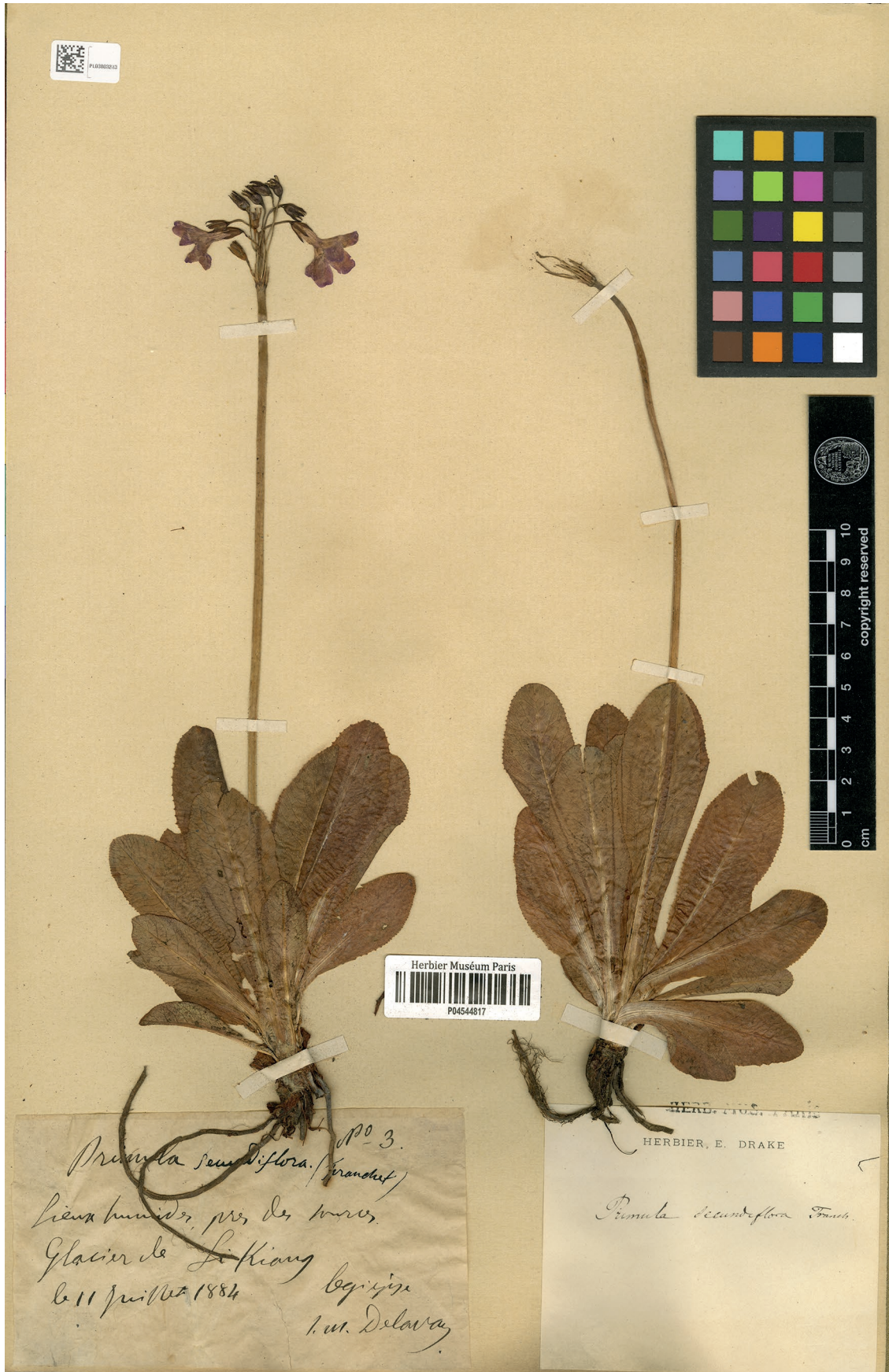
Fig. 7. — Lectotype of Primula secundiflora Franch. (P04544817).