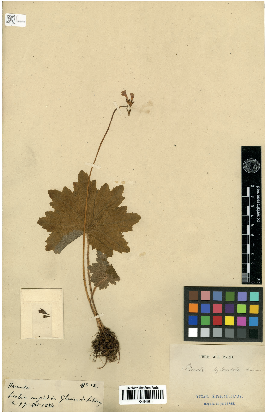
FIG. 8. — Lectotype of Primula septemloba Franch. (P04544807).