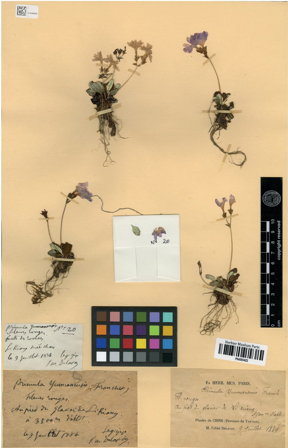
Fig. 11. — Lectotype of Primula yunnanensis Franch. (P04595422).