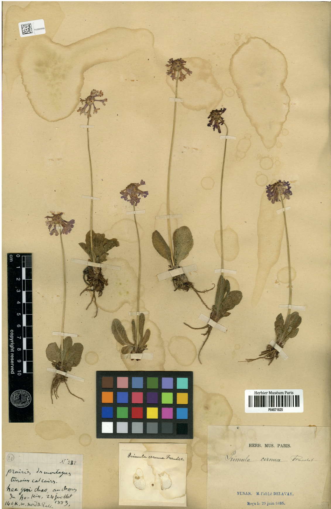
FIG. 3. — Lectotype of Primula cernua Franch. (P04571825).