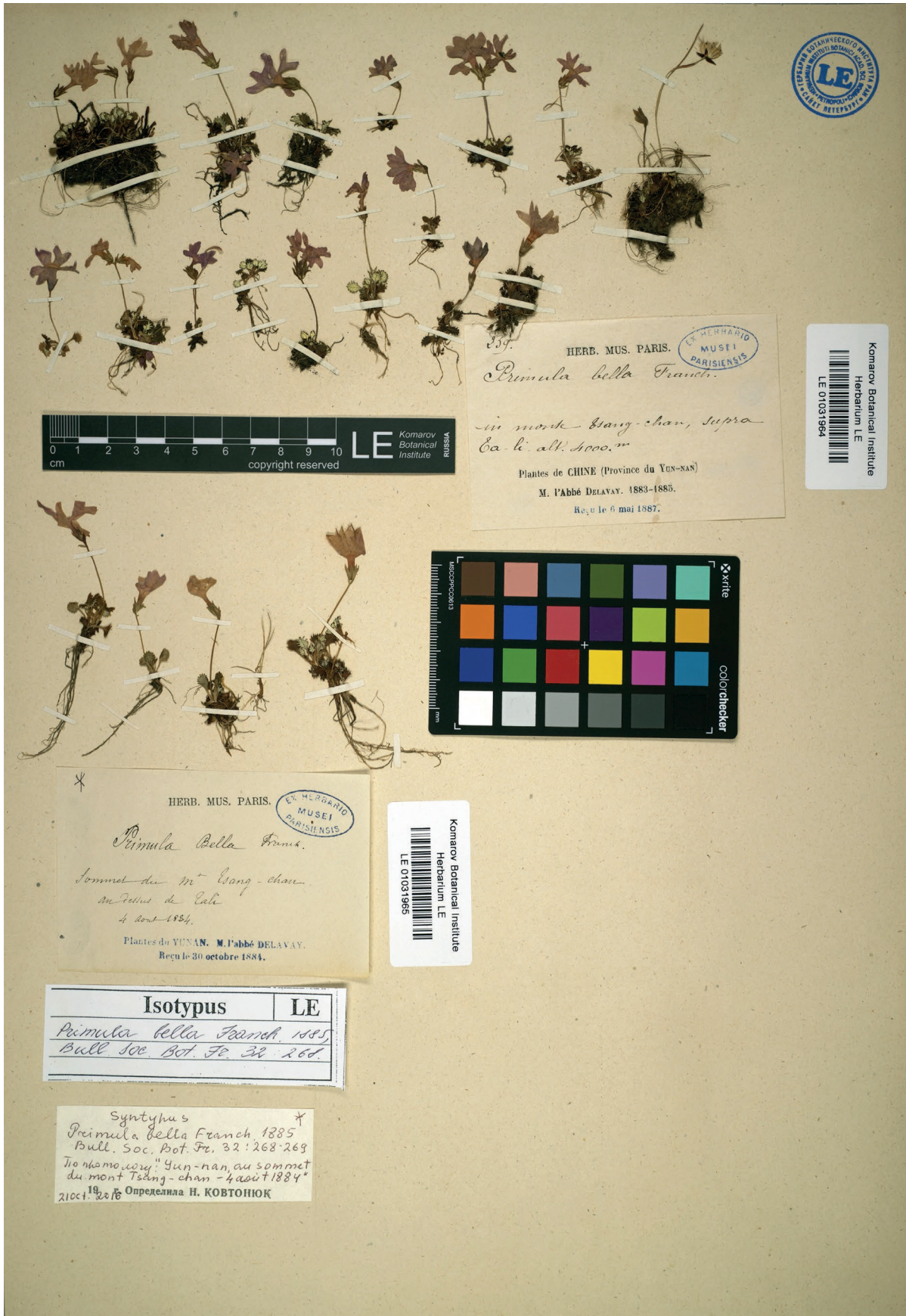
Fig. 2. — Lectotype of Primula bella Franch. (LE011031965), at left of the sheet.