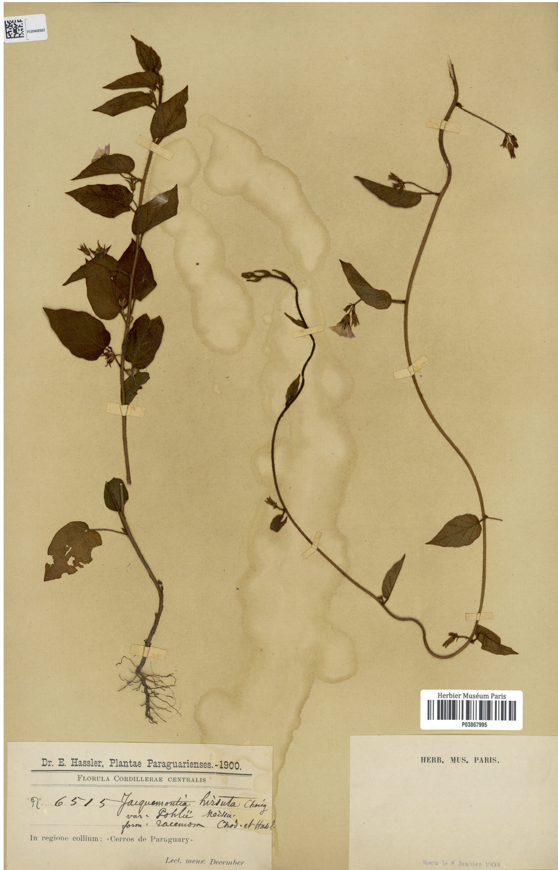
FIG. 10. — Isotype of Jacquemontia hirsuta var. pohlii f. racemosa (P03867995).