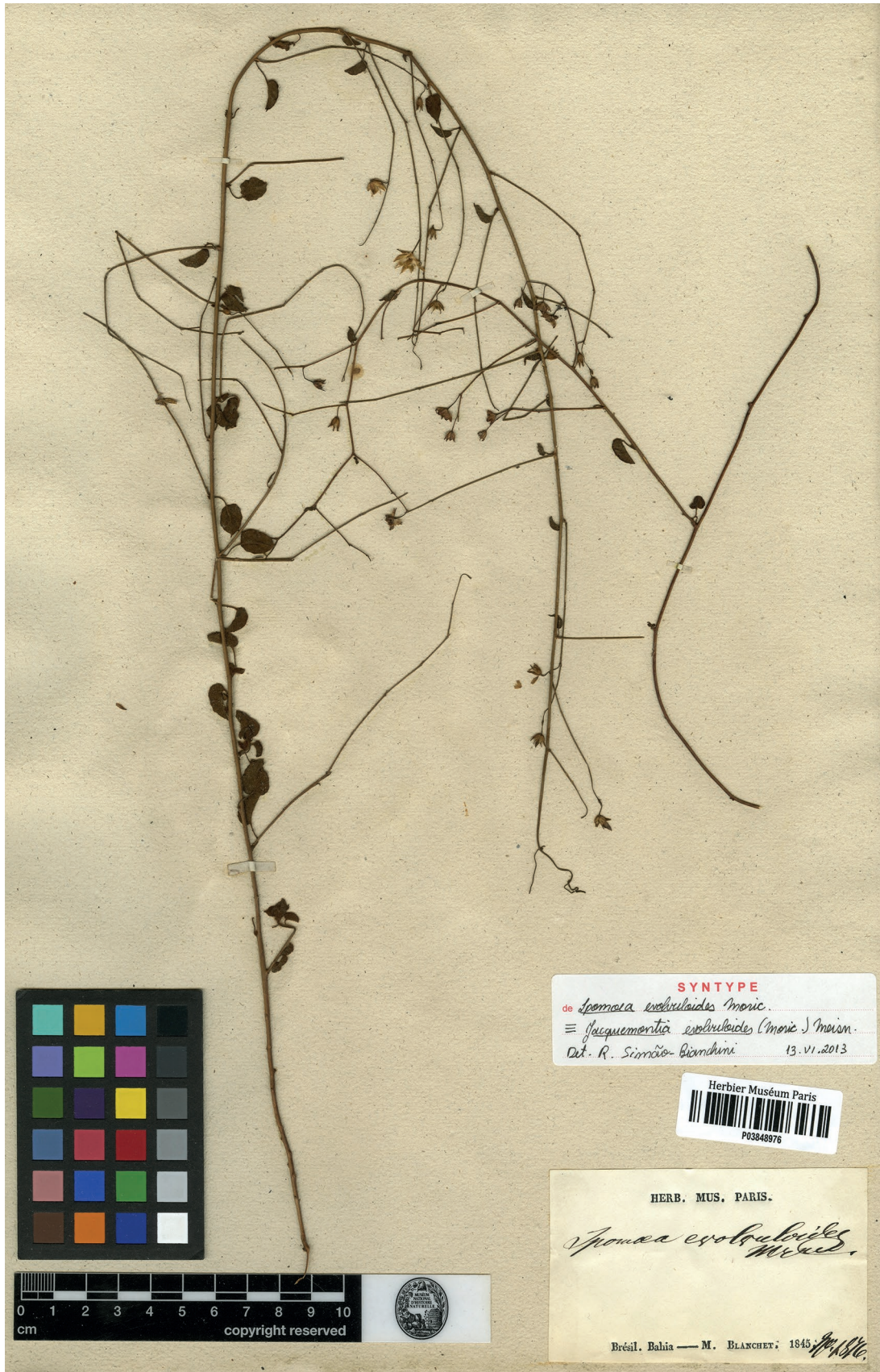
FIG. 3. — Isolectotype of Jacquemontia evoluloides (P03848976).