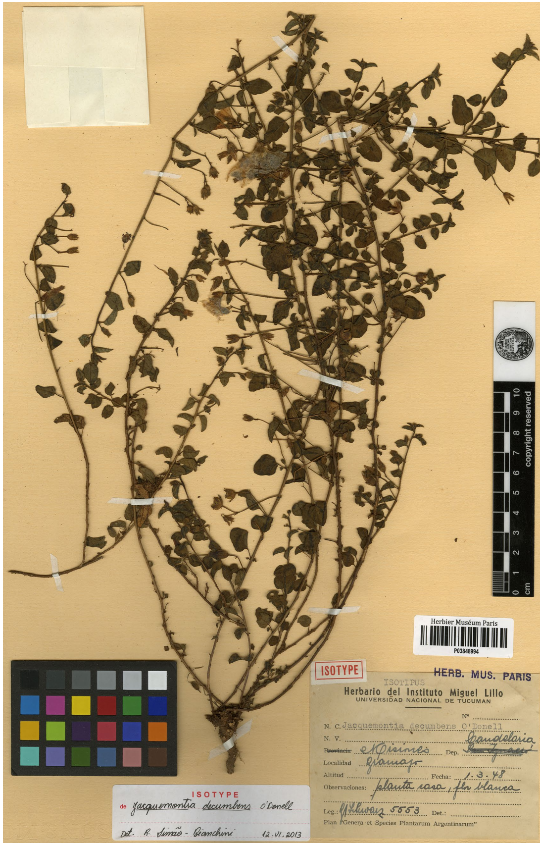
Fig. 5. — Isotype of Jacquemontia decumbens (P03848994).