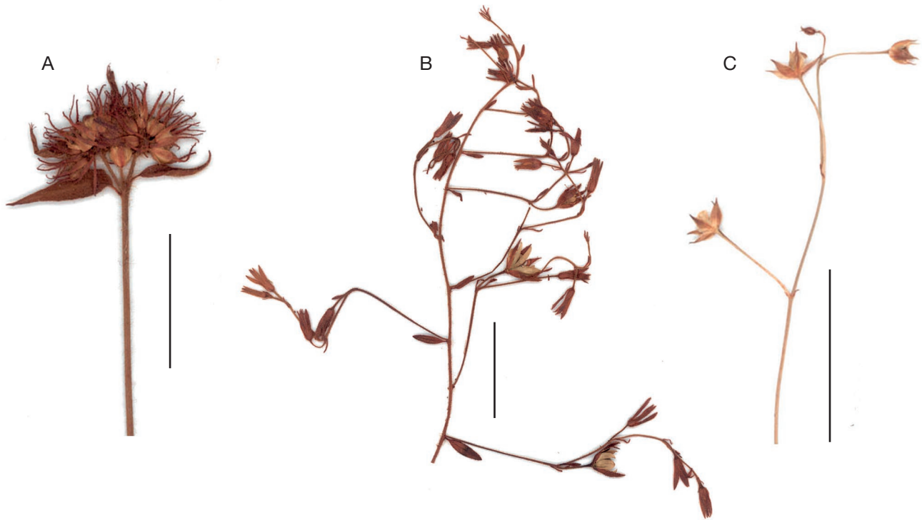
FIG. 1. — Representative inflorescences: A , inflorescence dichasial congested in Jacquemontia sphaerostigma (M. Kuhlmann & A. Geht s.n. [SP39995]); B , inflorescence thyrsoid in Jacquemontia warmingii (S.M. Soares 565); C , inflorescence monochasial in Jacquemontia evolvuloides (G. Pereira-Silva 6283). Scale bars: A, B, C, 1 cm.

photo!; isolecto-, G[G00222068] photo!, P[P03848976]! (Fig. 3); lectosyn-, Brazil, Bahia, Blanchet 2050 G[G00222067] photo!).