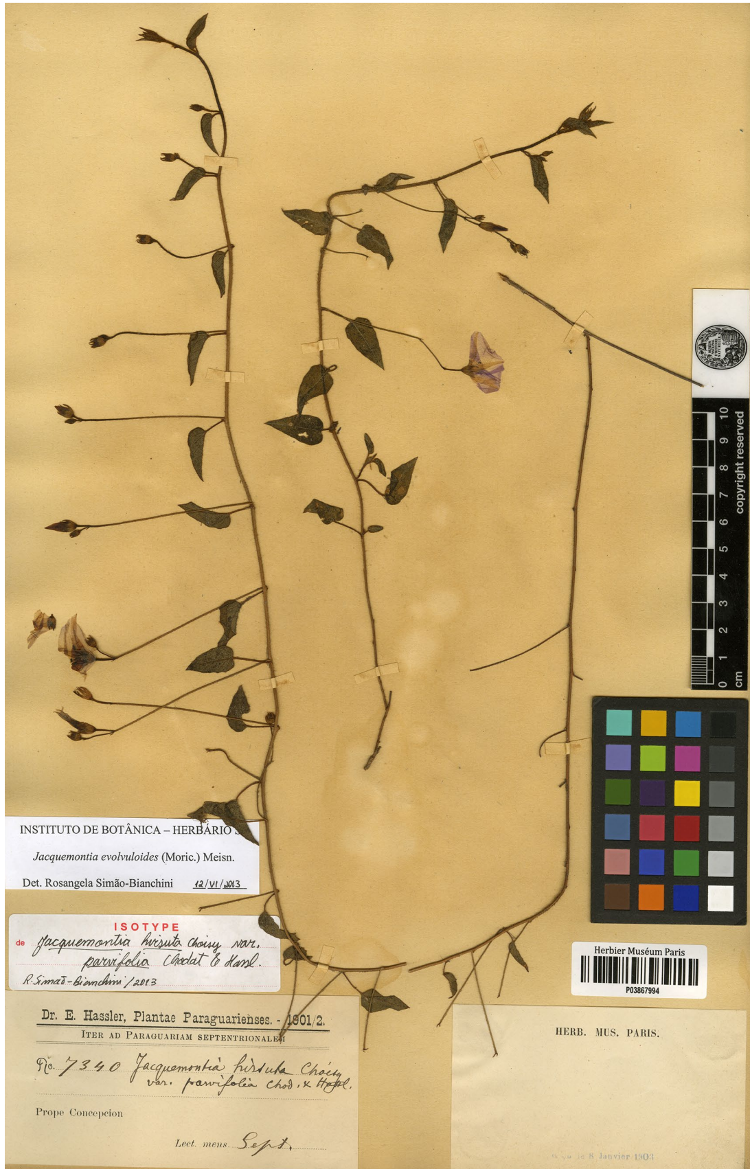
Fig. 4. — Isotype of Jacquemontia hirsuta var. parvifolia (P03867994).