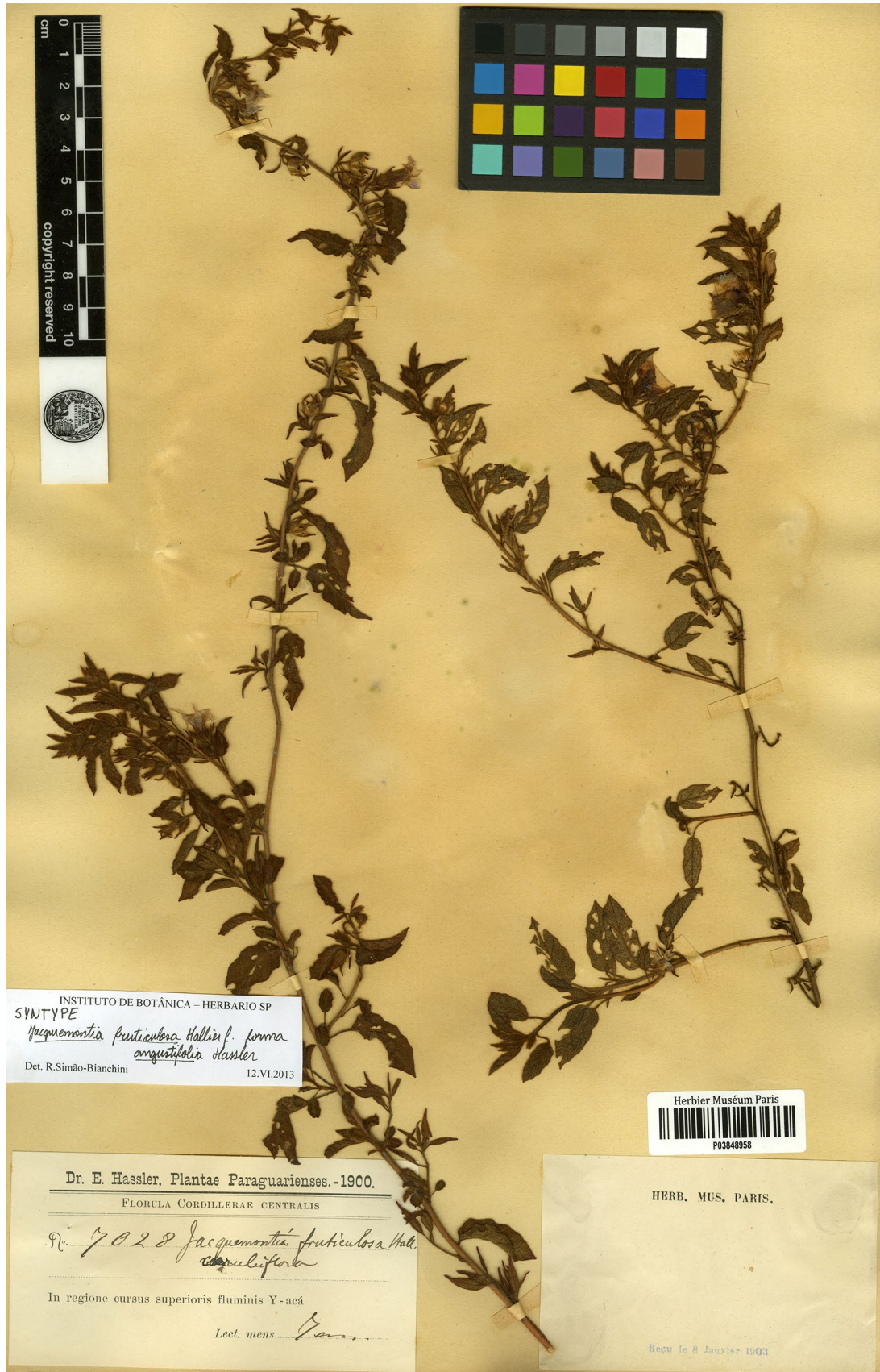
FIG. 7. — Isosyntyple of Jacquemontia fruticulosa var. glandulifera f. angustifolia (P03848958).