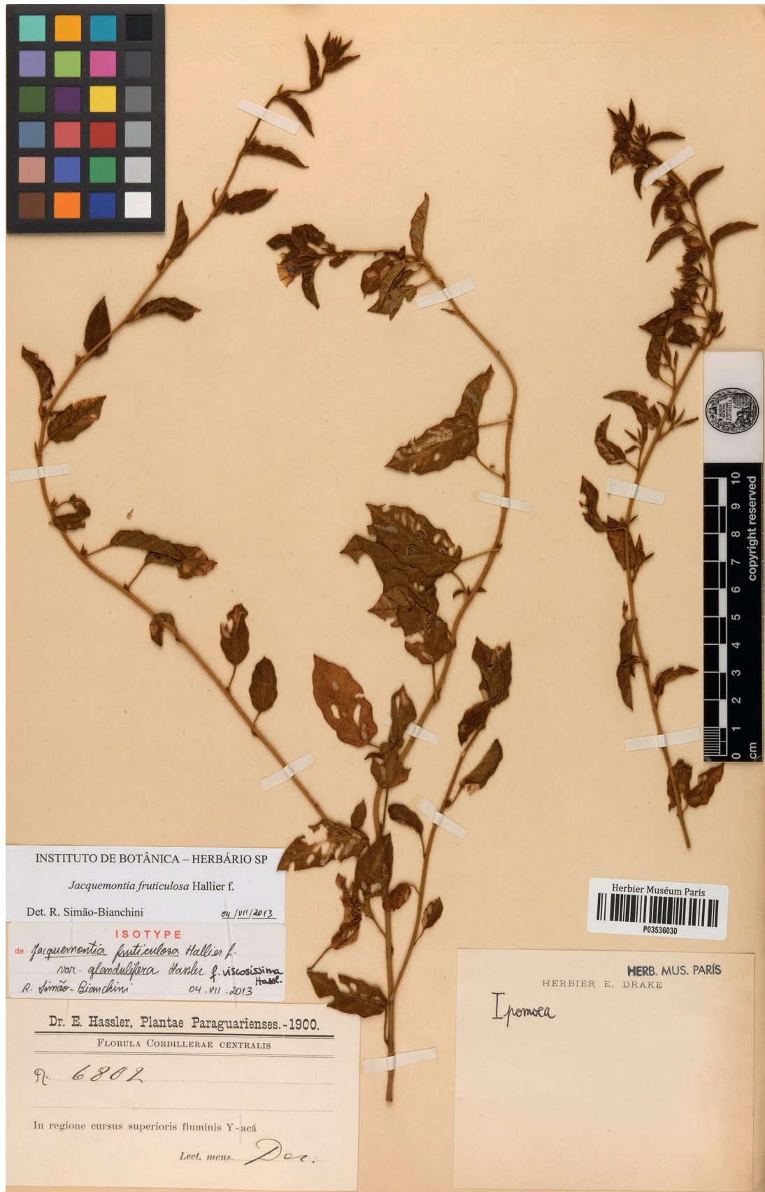
Fig. 6. — Isotype of Jacquemontia fruticulosa var. glandulifera f. viscosissima (P03536030).