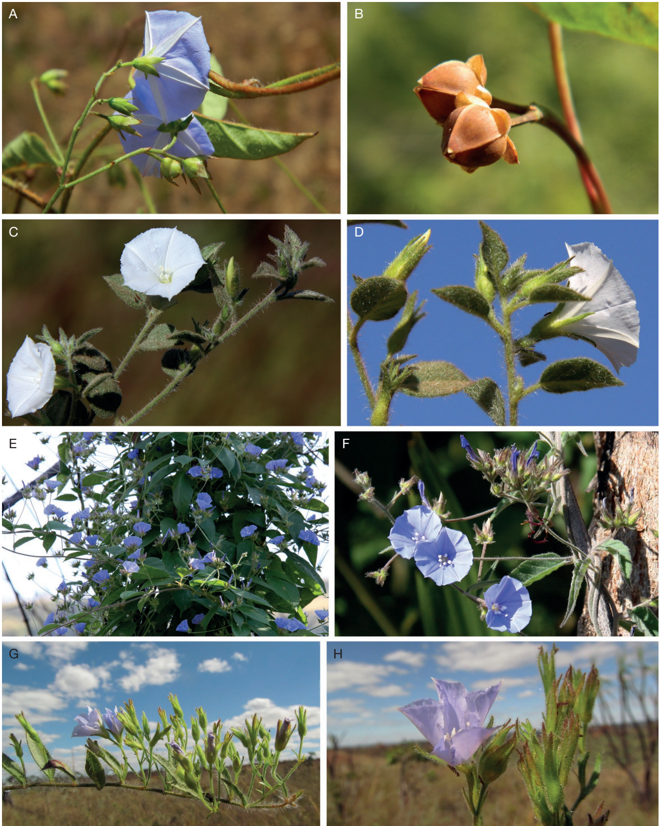
FIG. 8. — A, B, Jacquemontia evolvuloides ; C, D, Jacquemontia heterotricha ; E, F, Jacquemontia sphaerostigma ; G, H, Jacquemontia warmingii.