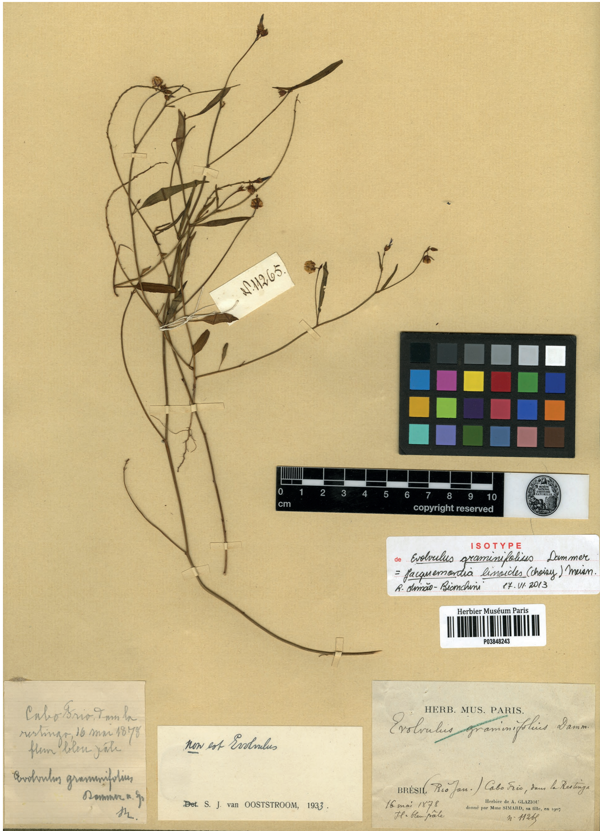
Fig. 9. — Lectotype of Evolulus graminifolius (P03848243).