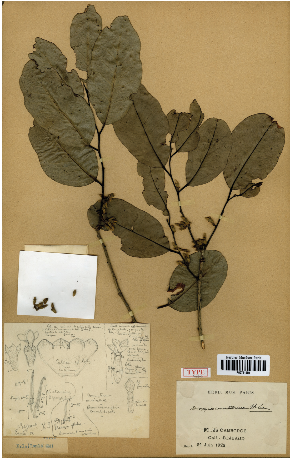
Fig. 1. — Lectotype of Diospyros cambodiana Lecomte, Béjeaud s.n. (P00721450).