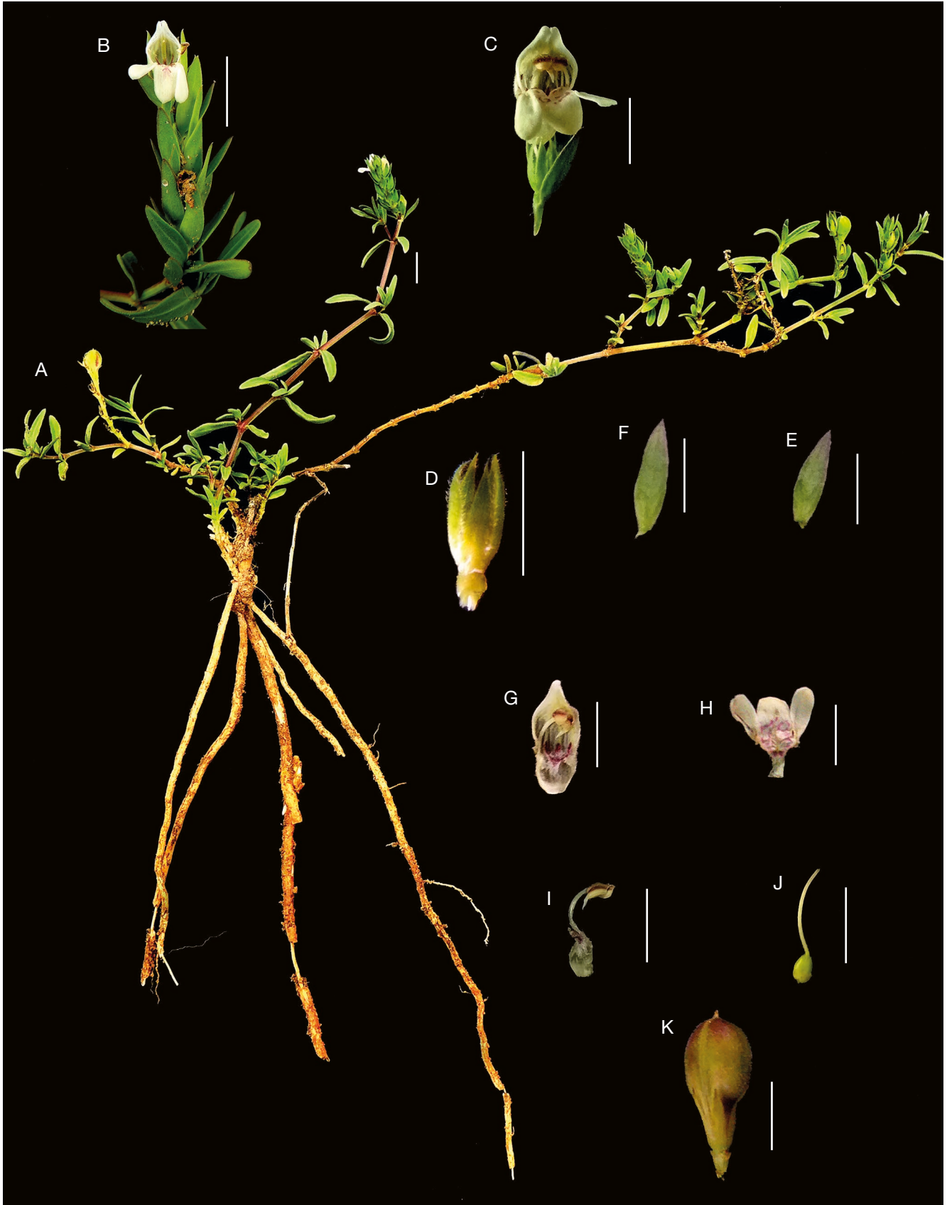
FIG. 2. — Justicia tamilnadensis P.Raja & Soosairaj, sp. nov.: A , habit; B , inflorescence; C , flower; D , calyx; E , bract; F , bracteole; G , corolla upper lobes with stamens; H , corolla lower lobes; I , stamen; J , pistil; K , capsule. Scale bars: A, B, 10 mm; C–M, 5 mm.