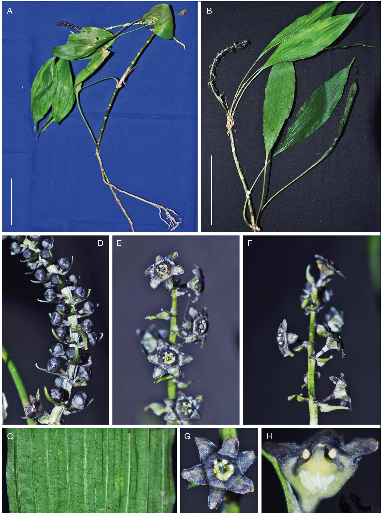
FIG. 3. — Peliosanthes sinica F.T.Wang & Tang.: A , entire plant; B , distal part of flowering plant in late anthesis; C , abaxial surface of leaf; D , young inflorescence; E , F , portion of inflorescence in late anthesis; G , flower; H , longitudinal section of flower. layout by D. Borah & N. Tanaka. Scale bars: A, B, 10 cm.