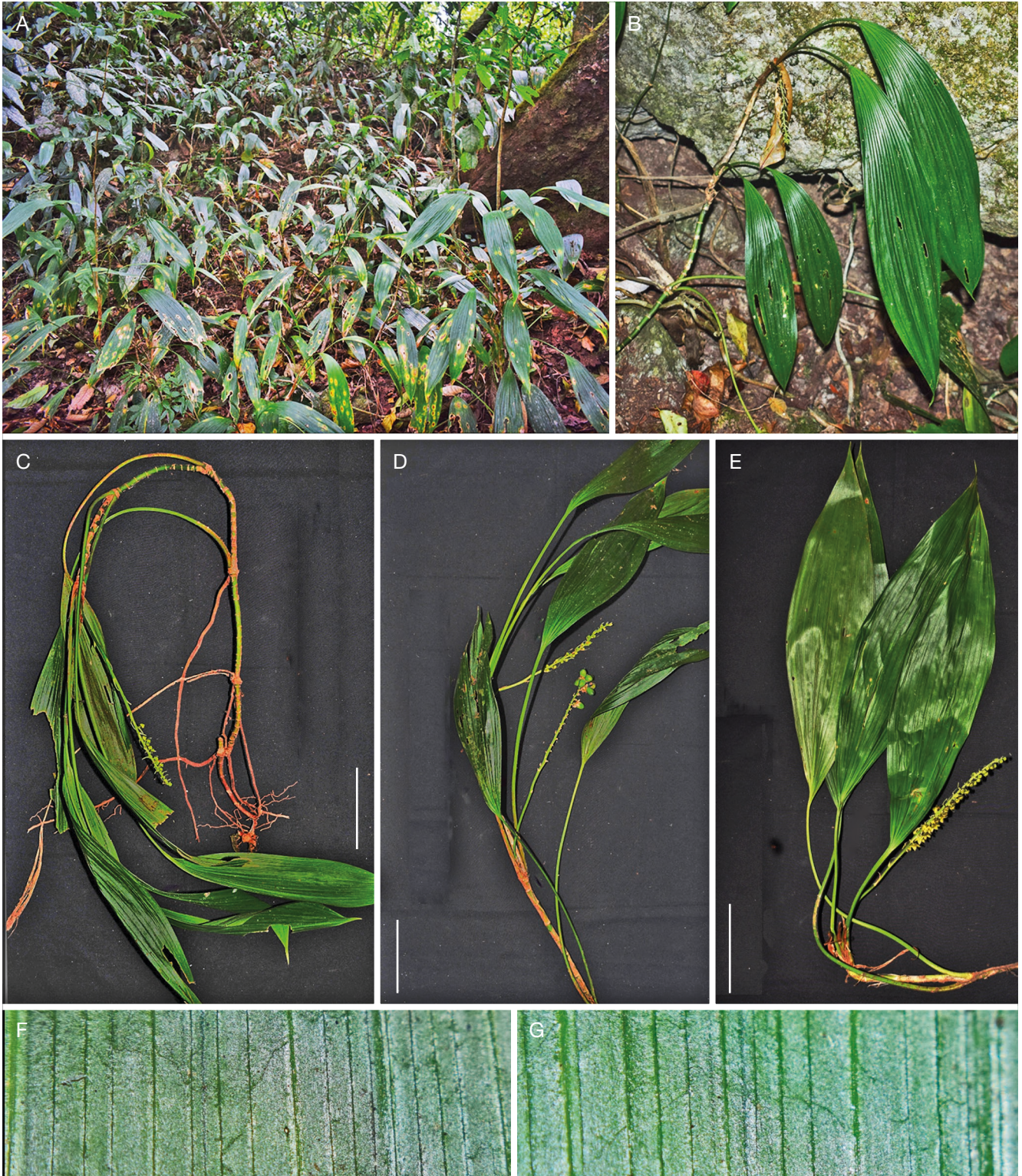
FIG. 1. — Peliosanthes maheswariana D.Borah, N.Tanaka & Taram, sp. nov.: A, B , plants in habitat; C , entire plant; D , distal part of flowering and fruiting stem; E , distal part of flowering stem; F , adaxial surface of leaf; G , abaxial surface of leaf. layout by D. Borah & N. Tanaka. Scale bars: C-E, 10 cm.

ephemeral, those sheathing apical portion of stem several, basally imbricate; scars (nodes) of scales between annual nodes 11-15, often with fibrous remnants, spaced at intervals up to 1.7 cm long. Roots 1 to a few ( c. 3) from annual