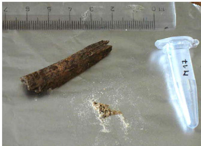
Fig. 2. Taking a sample from a fragment bone.

The cooked species identification kits are sandwich-type EIAs utilising a biotin-avidin enhancement process. During this procedure, specific proteins from a sample extract binds on the primary antibody (species-specific) at the bottom of the wells (antibody-coated). Samples are extracted using a simple saline solution. A positive control was prepared by adding 100 µl of kit controls/extracts for each species (beef, pork and sheep) for visual comparison with tested samples. Similarly, 100 µl of distilled water was used as a negative control. The incubation of sample proteins with a biotinylated species antibody locked in each microwell took 45 minutes. After this period, all solutions were removed from wells, which were immediately washed three times with the working wash solution (part of the ELISA kit). Next, 50 µl of anti-species biotinylate (secondary antibody) was added, respectively, for each tested species (beef, pork and sheep) and incubated for 45 minutes. Then, the microwells were washed three times. Subsequently, 50 µl of avidin peroxidase conjugate was added and the incubation lasted 15 minutes. After this step,