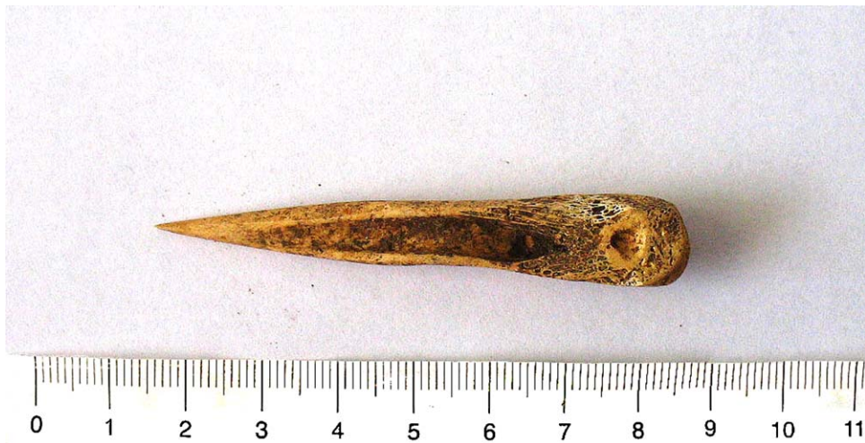
Fig. 1. The bone artefact tested (bone bodkin).