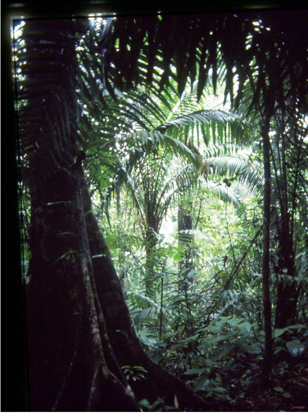
Fig. 2. Coastal rainforest at El Amargal, Chocó: type locality of Pycnolejeunea chocoensis .