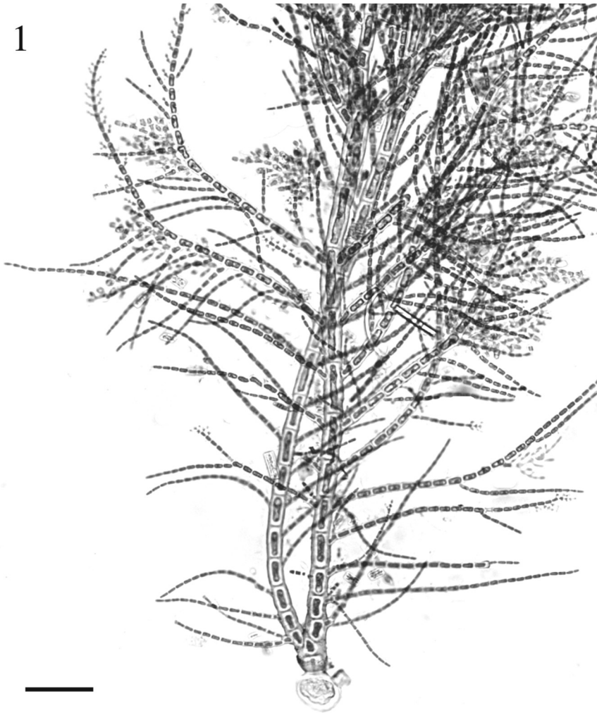
Fig. 1. Colaconema basiramosum . sp. nov. Habit of proximal portion of plant with pseudodichotomously branched axis. Carposporophytes present. Scale bar: 100 \mu m.

Lower cells of these principal axes are 26-30 \mu m wide and bear distichously arranged opposite branches for some distance. The opposite branches are determinate and in turn bear both opposite and alternate branches (usually short, simple and spine-like). Few-celled third-order branches are again pinnately arranged and present on older plants. Some of the second-order branches continue development in an indeterminate pattern, similar to the main axes. Which branches are so determined seems to be random. The principal axes are mostly straight or just slightly flexuous distally. Usually the final 7-9 cells of any axis or branch are unbranched. The ultimate cell of any branch ends in a conical tip. Cell walls reaching 2.5 \mu m thickness on main axis, thinning down gradually to 1 \mu m at the tips.