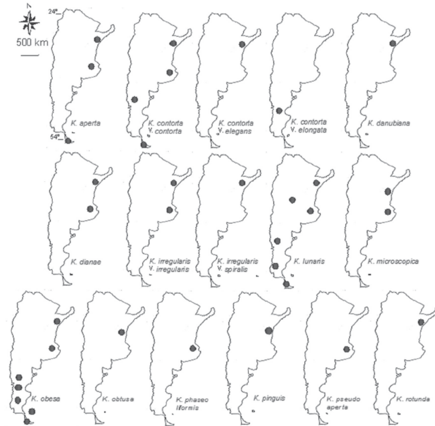
Fig. 17. Geographic distribution of the species of the genus Kirchneriella in Argentina.

The species is probably cosmopolitan, absent in our material. It has been cited for Argentina in shallow lakes (Buenos Aires Province, temperate waters).