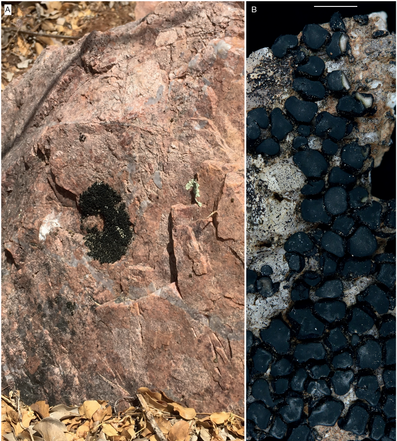
FIG. 3. — Peltula nigrotestudinea Aptroot & M. Cáceres, sp. nov., holotype: A , habitus on top of granite boulder, with a Xanthoparmelia ; B , detail showing thallus areoles. Scale bars: 1 mm.

any apparent source of water, while Peltula species usually grow close to streams or on places with run-off; 2) Synalissa mattogrossensis , which was known only from limestone, was found on siliceous rock, not on obviously dusty or eutrophicated places; 3) a Xanthoparmelia is found high up the trees on bark also not obviously dusty; with 820