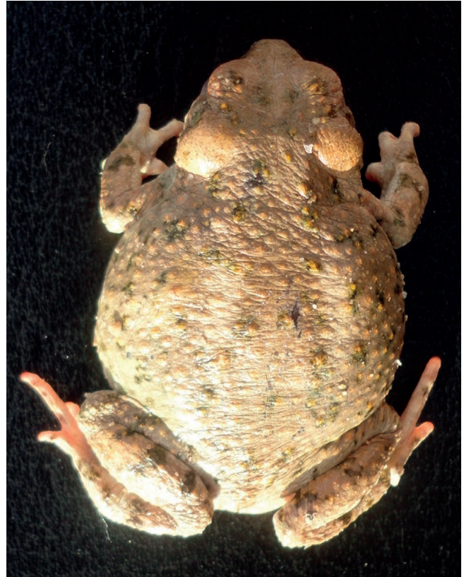
FIG. 1. — Bufo luristanicus (Schmidt, 1952).

DISTRIBUTION. — Mazandaran, Golestan and Gilan Provinces (Najibzadeh et al. 2017).