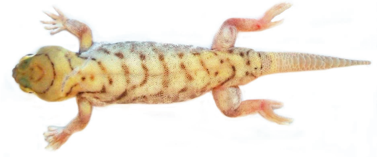
FIG. 6. — Teratoscincus sistanense Akbarpour, Shafiei, Sehhatiasabet & Damadi, 2017.

HABITAT. — Found in several tunnels in the Tang-e-Haft Region, South of Lorestan. The region has a warm climatic condition and is located between central Zagros Mountains and Khuzestan Plain.