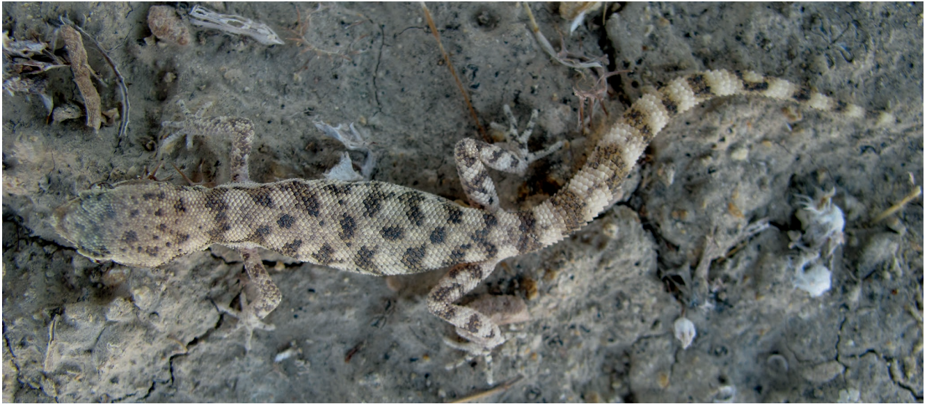
Fig. 4. — Tropiocolotes naybandensis Krause, Ahmadzadeh, Moazeni, Wagner & Wilms, 2013.

Family LACERTIDAE Bonaparte, 1831 Genus Acanthodactylus Fitzinger, 1834