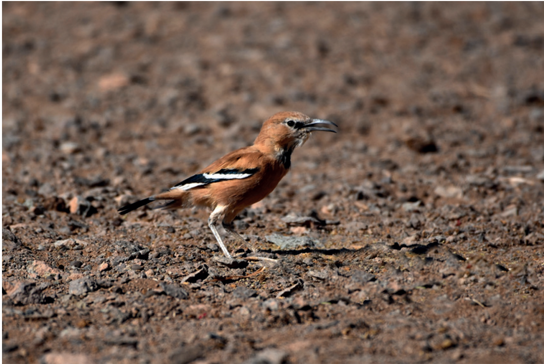
FIG. 8. — Podoces pleskei Zarudny, 1896.