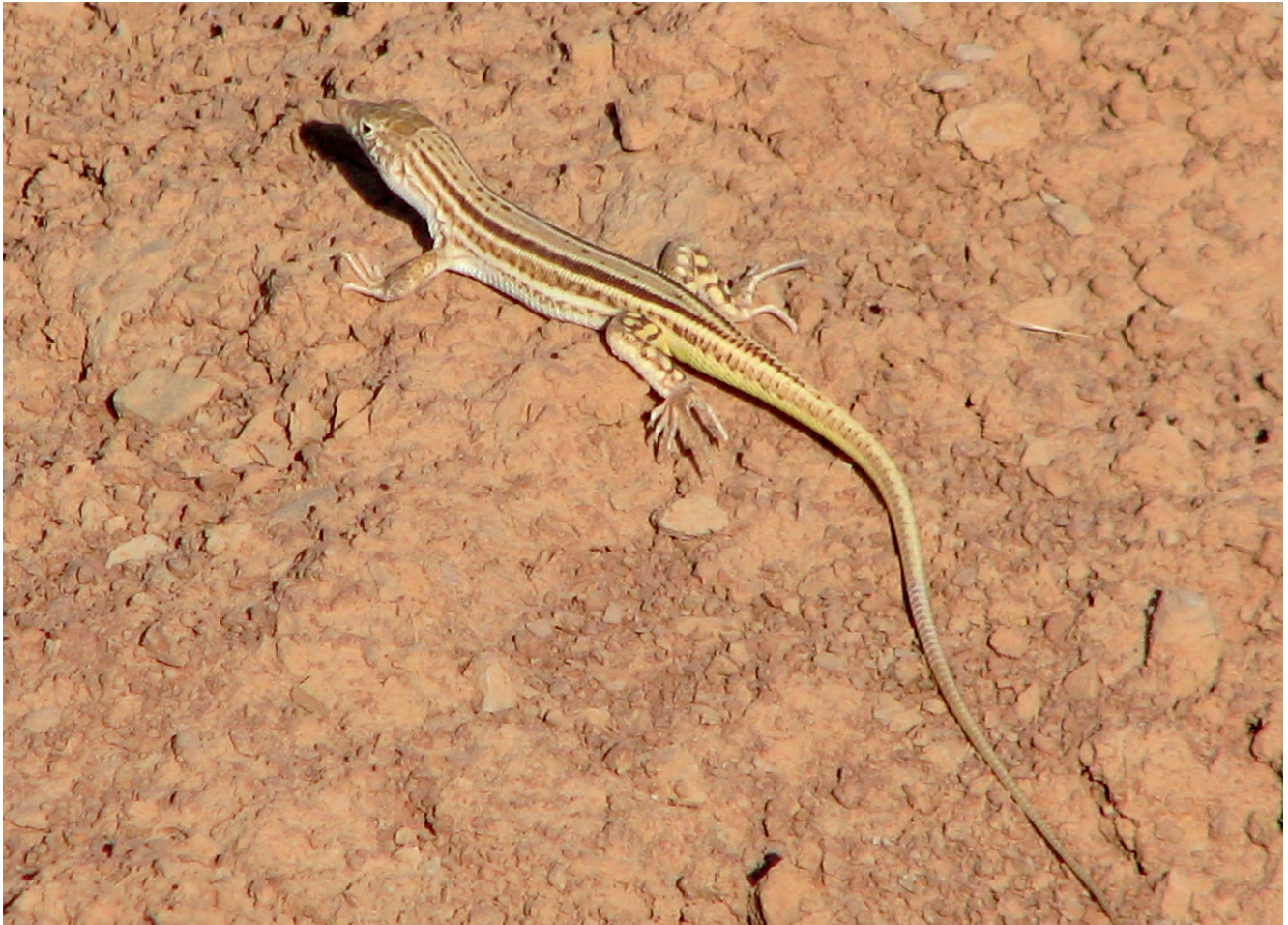
Fig. 5. — Acanthodactylus nilsoni Rastegar-Pouyani, 1998.