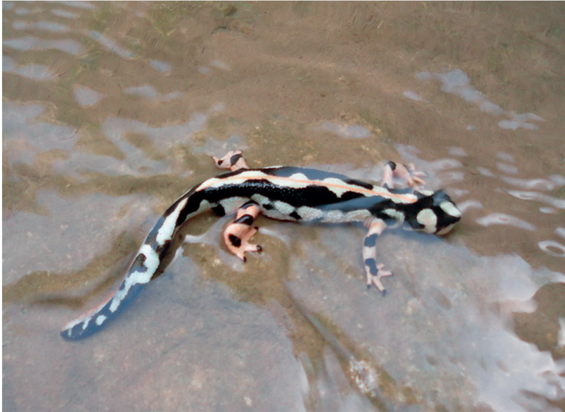
FIG. 3. — Neureergus kaiseri Schmidt, 1952.