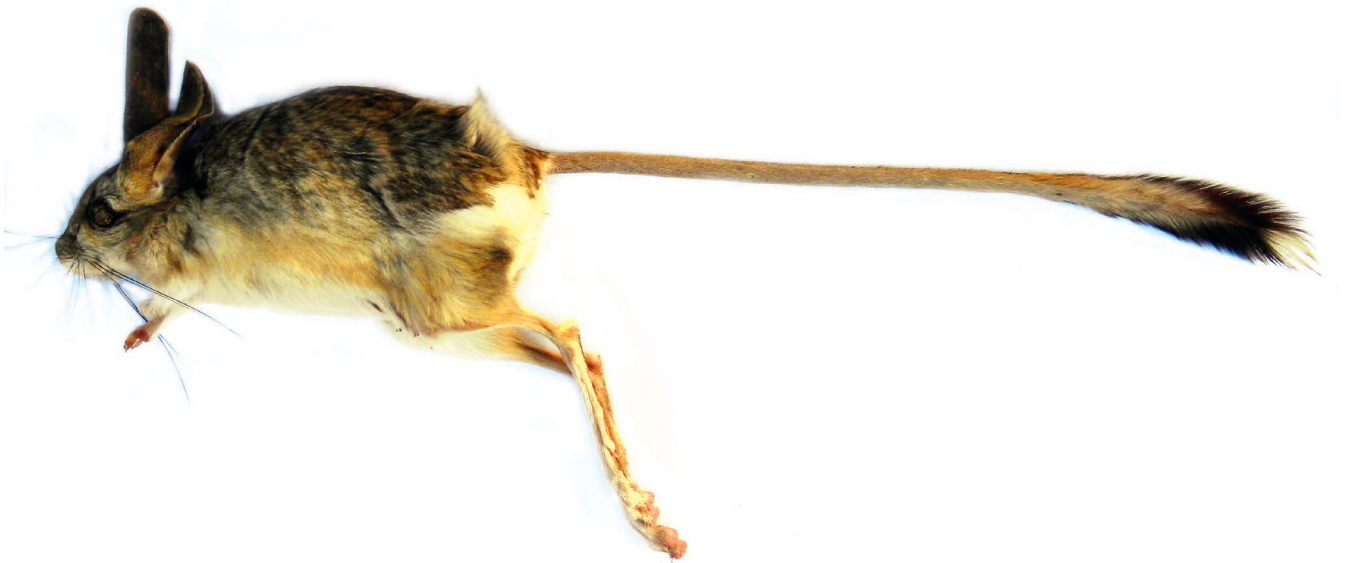
FIG. 9. — Scarturus cf. williamsi (Hamidi, Darvish & M. Matin, 2016). Photo by K. Hamidi.