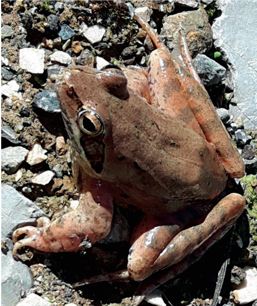
FIG. 2. — Rana pseudodalmatina Eiselt & Schmidtler, 1971.

HABITAT. — Living in wind-blown sand dunes.