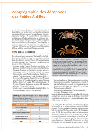
Zoogéographie des décapodes des Petites Antilles