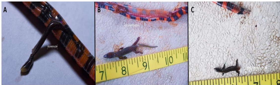
Figure 2. Stomach content of M. ruatanus . A) M. ruatanus juvenile with an adult of Epictia magnamaculata . B) Remains of Sphaerodactylus rosaurae in an adult M. ruatanus . C) Remains of Gymnophthalmus speciosus in and adult M. ruatanus . Scale displayed is in inches.

total length of 170 mm and 590 mm, respectively. The following prey items were present in their stomachs: an Epictia magnamaculata (72 mm TL) in the smaller specimen, and a Sphaerodactylus rosaurae (52 mm TL) and Gymnophthalmus speciosus (28 mm TL) in the larger specimen (Figure 2). The island presents scattered woodlands with dense forest towards the western end (Municipio José Santos Guardiola). The central area of Roatan is extremely fragmented because of anthropic development, reducing the odds of finding this coral snake. Moreover, there is no information regarding the presence of M. ruatanus on Santa Elena Island, since it is separated 4 km extent of marshes and mangroves.