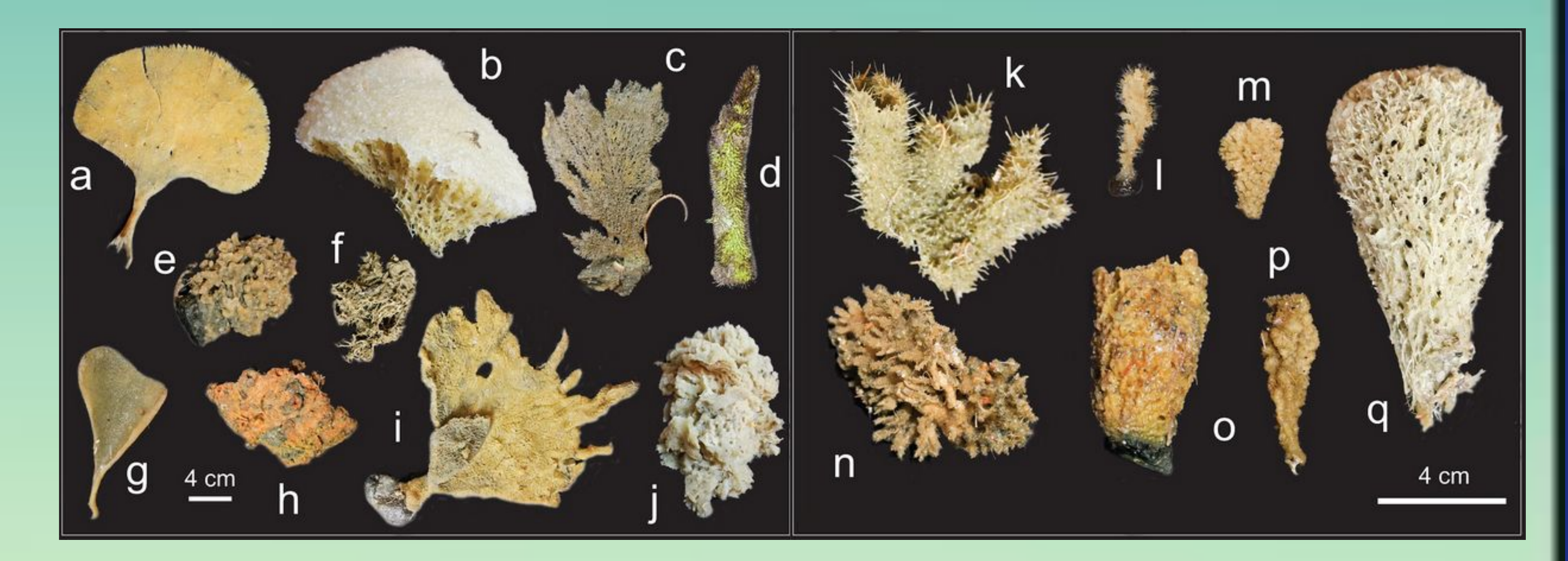
Figure References: Photographs of some of the several sampled species. a) Isodictya lankesteri; b) Mycale (O.) acerata; c) Kirkpatrickia aff. coulmani; d) Isodictya erinacea ; e) Tedania charcoti ; f) Mycale (M.) cf. tridens; g) Calyx cf. arcuarius; h) Artemisina apollinis ; i) Lissodendoryx (L.) flabellata; j) Haliclonissa verrucosa ; k) Microxina charcoti; l) Raspailia (H.) hentscheli; m) Lissodendoryx (E.) anacantha; n) Clathria (A.) nidificata; o) Myxodoryx hanitschi ; p) Lissodendoryx (E.) ramilobosa; q) Hemigellius cf. pilosus.