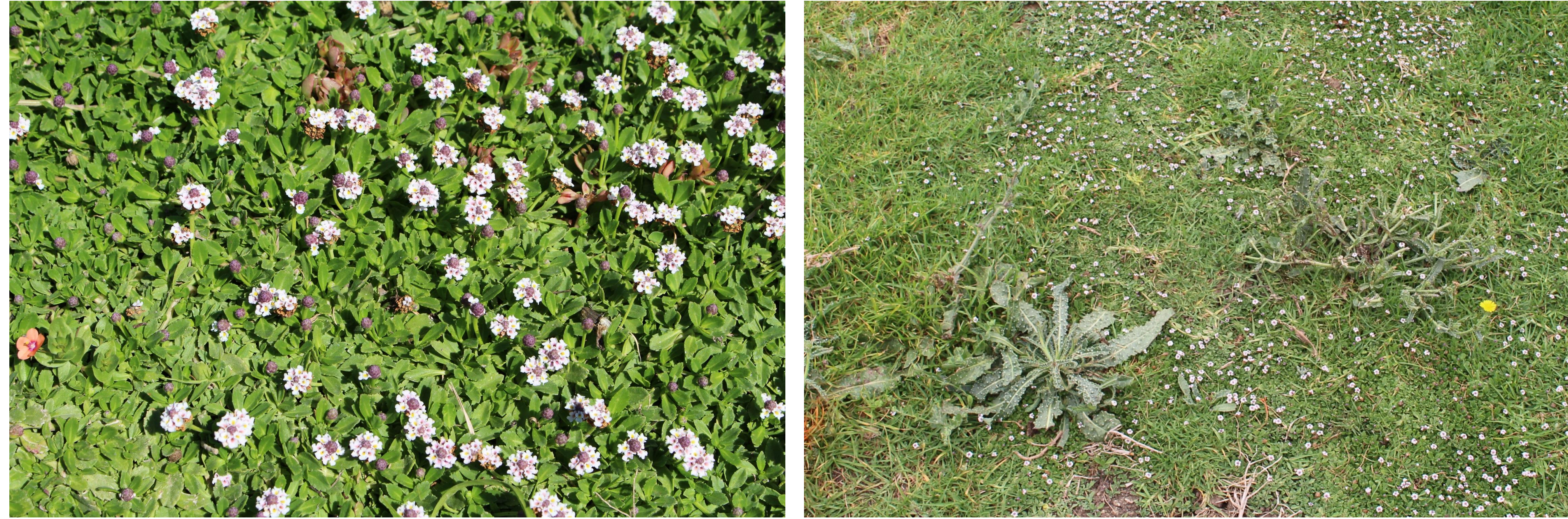
Figure 1. Kurapia (left) and weed encroachment in a mature plot of Kurapia (right).

Kurapia ( Lippia nodiflora L.) is a low-growing, broadleaf groundcover selected and developed in Japan that has recently been recognized for its low water use and salinity tolerance characteristics. Kurapia use is now increasing in California landscapes, but weed encroachment is a concern since establishment is from plugs and little is known about Kurapia tolerance to pre- and postemergence herbicides at various stages of establishment (Fig. 1).