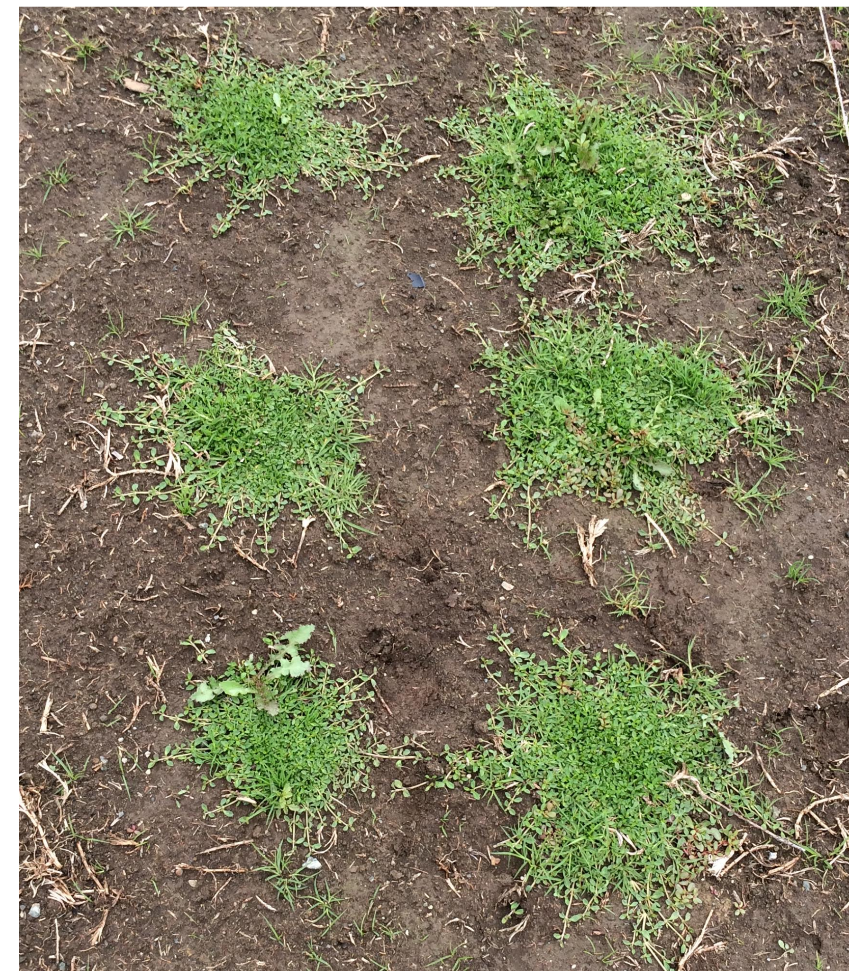
Figure 2. Kurapia plugs treated with herbicides six weeks after planting in San Luis Obispo on 23 April 2015.