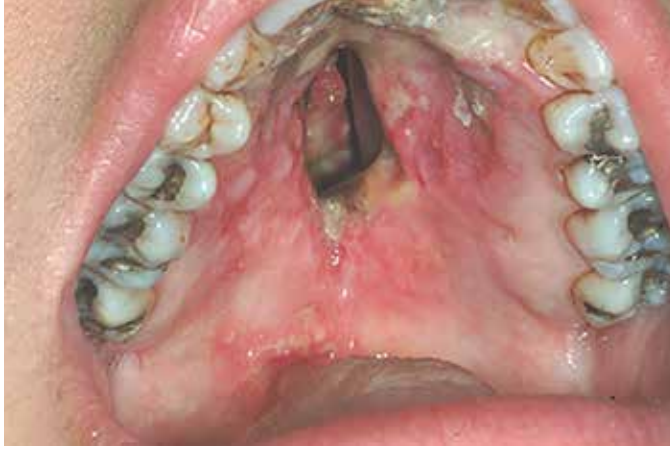
■ FIGURE 10. Granulomatosis with polyangiitis (Wegner's granulomatosis). Example of a palatal perforation in granulomatosis with polyangiitis. Note complete erosion of the bony palate.