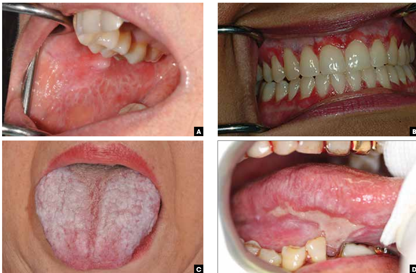
■ FIGURE 5. Lichen planus. A) Reticular form: Example of Wickham's Striae on the buccal mucosa of a lichen planus patient. Notice the lattice-like appearance of the most common form. B) Atrophic form: Example of atrophic form of lichen planus that can occur exclusively on the gingiva. Notice the widespread appearance that appears to be localized to the attached gingiva. C) Plaque form: Example of plaque-form of lichen planus on the tongue of patient which is similar in appearance to keratosis. It may be more prevalent in smokers. D) Erosive form: Example of a large map-like lesion of oral lichen planus on the ventral surface of the tongue. Notice hyperkeratosis surrounding ulcer.

mediated immunity may be important. 4 Since both minor and herpetic aphthous ulcers typically resolve in 7-10 days, treatment is varied and palliative. Treatments have included tetracycline or doxycycline mouth rinses, topical corticosteroids (fluocinonide), and silver nitrate cauterization. The latter reduces the pain of aphthae via necrosis of small nerve fibers, but usually results in prolonged healing. Intralesional or oral corticosteroids are indicated for major aphthae. For treatment of widespread, persistent disease; oral corticosteroids may be coupled with steroid-sparing drugs such as azathioprine or mycophenylate. Colchicine, dapsone, and pentoxifylline have also been used for major aphthae with varying degrees of effectiveness. 5