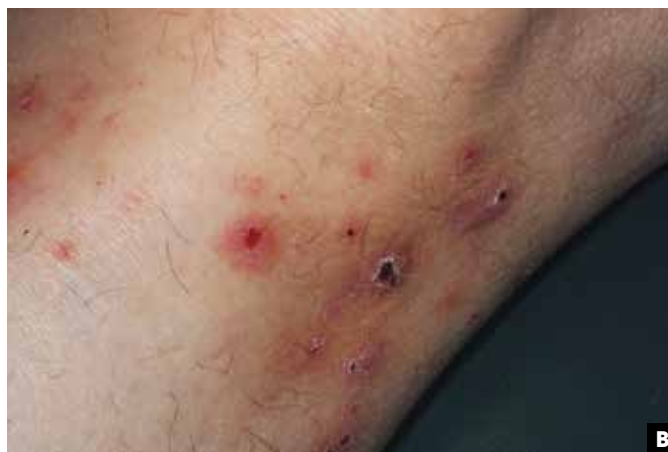
■ FIGURE 8. Erythema multiforme (EM). A) Oral EM: Example of the widespread ulcerations seen in EM. Ulcerations can be found on any surface including the lips, tongue, and buccal mucosa. B) Cutaneous EM: Example of typical “target” skin lesions associated with EM.