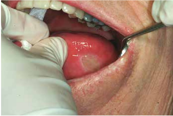
■ FIGURE 2. Traumatic ulcer on the tongue. Dental filling material was inadvertently left in between the lower left teeth, which resulted in chronic trauma and the formation of a large iatrogenic ulcer on the tongue. Patient has paresthesia on the left side and could not feel the ulcer forming.