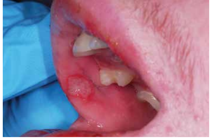
■ FIGURE 11. Behçet's Syndrome: Example of an aphthous-like ulcer in a patient with Behçet's syndrome.

Granulomatosis with polyangiitis (GPA; Wegner's Granulomatosis) presents as oral ulcers associated with upper respiratory tract, lung, and kidney involvement. 11 Initial disease presentation typically involves painful cobblestone changes to the mucosal surface of the palate and gingiva (strawberry gingiva). GPA is a form of necrotiz-