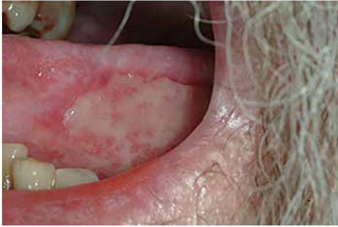
■ FIGURE 6. Pemphigus Ulceration: Example of a large pseudomembrane covered ulcer on the lateral border of the tongue due to pemphigus vulgaris.

with symptoms and/or the presence of ulceration, either topical or systemic corticosteroids may be used as treatment options.