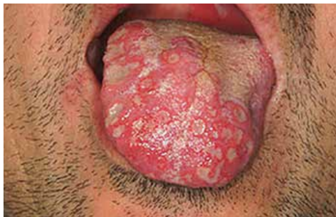
■ FIGURE 9. Herpes Simplex Virus I. Primary herpetic gingivostomatitis: Example of a primary herpetic outbreak in 35 year old male accompanied by headache, fever and overall malaise. Notice the ruptured vesicles on the tongue and the aphthous-like appearing lesion on the soft palate.

In an immunocompetent individual, oral Epstein-Barr virus (EBV) infections are rare. However, oral EBV infections are more common in the setting of immunosuppression. EBV infections most commonly manifest as the white lesion on the lateral border of the tongue, termed hairy leukoplakia (discussed in White Lesions in the Oral Cavity: Clinical Presentation, Diagnosis and Treatment [this issue]). An unusual form of EBV infection is seen in immunosuppressed individuals termed EBV-positive mucocutaneous ulcer. This is a self-limited, indolent disorder, generally responding well to conservative management. Lesions are histologically characterized by a polymorphous infiltrate and atypical large B-cell blasts often with Hodgkin/Reed-Sternberg (HRS) cell-like morphology. The B cells show strong CD30 and EBER (Epstein-Barr virus encoded small RNA) positivity, some with reduced CD20 expression, in a background of abundant T cells.