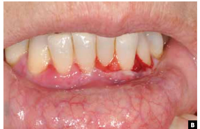
■ FIGURE 7. Pemphigus vulgaris. A) Bulla: Example of short-lived bullae on the gingival tissue area buccal to tooth #31. B) Mucous membrane pemphigoid. Gingival ulceration: Example of gingival ulceration and sloughing due to an uncontrolled mucous membrane pemphigoid. Note the generalized gingival recession due to the disease. Plaque control is essential to reduce the impact of the disease.