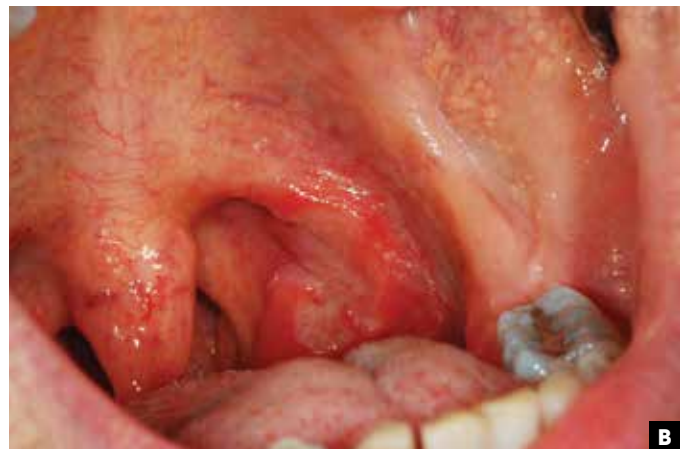
■ FIGURE 4. Aphthous stomatitis. A) Example of a classic minor aphthous ulcer appearing on the lower labial mucosa. The lesion is well defined with a pseudomembrane covering, with an erythematous halo surrounding the ulcer. The typical size is <5 mm. B) Example of a major aphthous ulcer on the left tonsillar fossae. Lesion is irregular in shape and deep. Scarring can occur. The typical size is >5 mm.