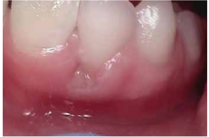
■ FIGURE 3. Factitial injury of lower gingiva. Repeated digging at the gingival collar as an unconscious habit resulting in localized trauma, gingival recession, and ulcer formation.

cancers have nodal metastases at time of diagnosis contributing to the poorer 5-year survival rate. 2 SCC of the oral cavity can mimic a variety of benign conditions occurring at multiple sites. Therefore, a careful soft tissue examination should be performed at each dental or medical appointment. Any ulcer that is present longer than 2 weeks and cannot be explained should be further evaluated and biopsied.