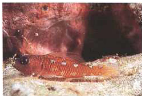
Fig. 7. The gobiid fish Trimma naudei , Mentawai Islands.