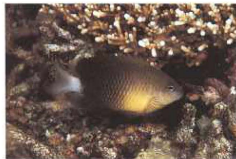
Fig. 9. Adult of the pomacentrid fish Pomacentrus xanhosternus , Mentawai Islands.