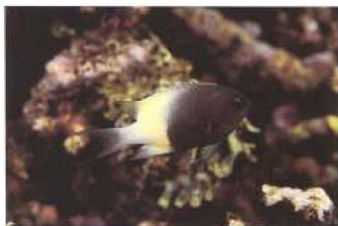
Fig. 4. The pomacentrid fish Chromis dimidiata , Mentawai Islands.