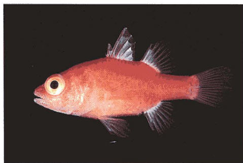
Fig. 3. The apogonid fish Fowleria flammea , Lombok, Indonesia.