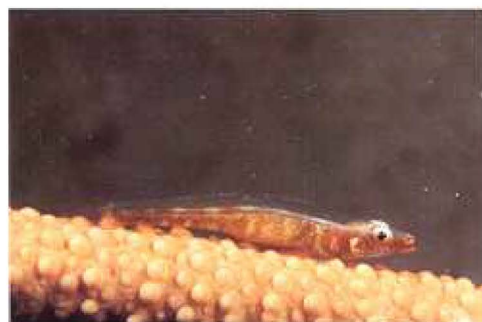
Fig. 6. The gobiid fish Bryaninops amplus on the gorgonian Junceella sp., Pulau Ular, West Sumatra.