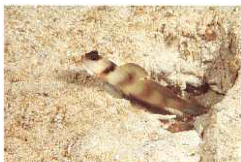
Fig. 5. The gobiid fish Amblyeleotris downingi , Pulau Ular, West Sumatra.