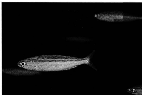
Fig. 2. Unidentified species of the caesionid fish genus Pterocaesio , Mentawai Islands.