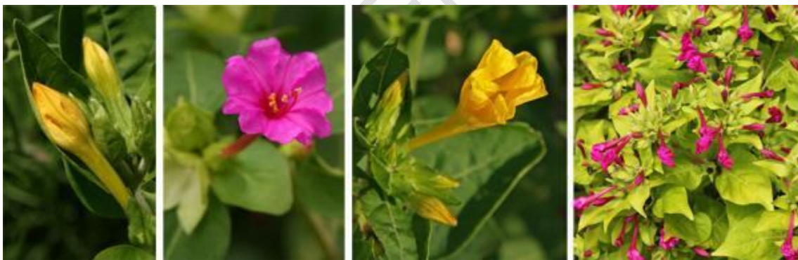
Flower buds, open flower, morning fading flower, and plant with many spent flowers[117].