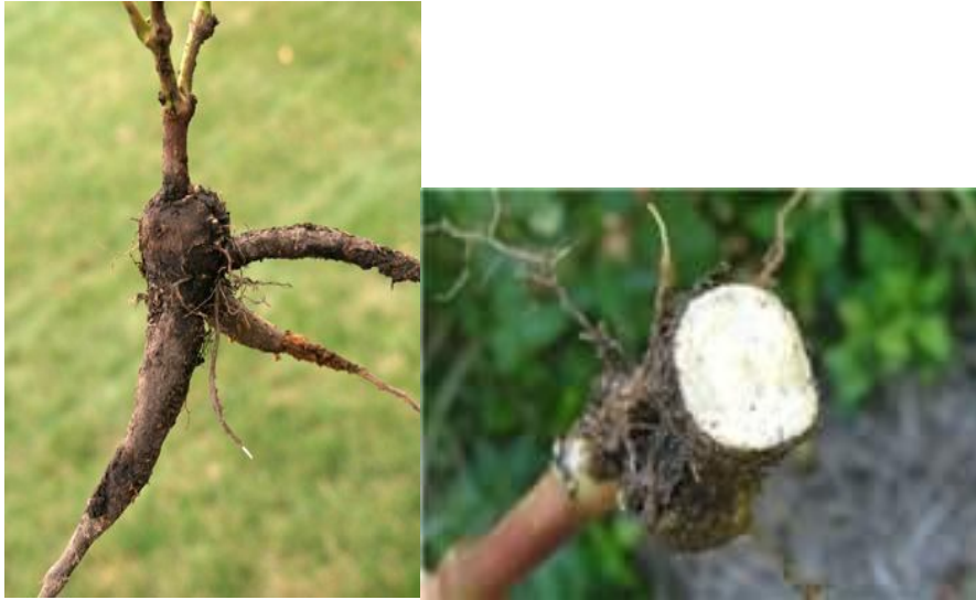
Figure 5: Tuberous root system of Mirabilis jalapa [117, 118].