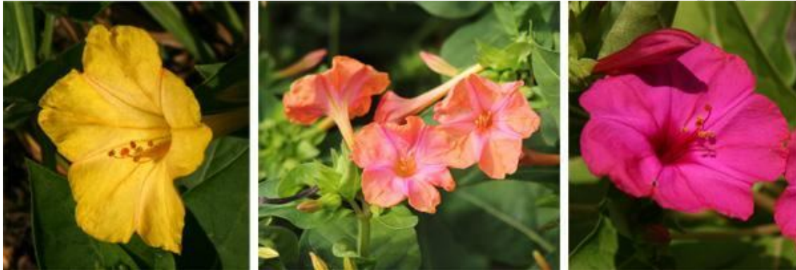
Figure 3: Different colors of the flower Mirabilis jalapa [117].