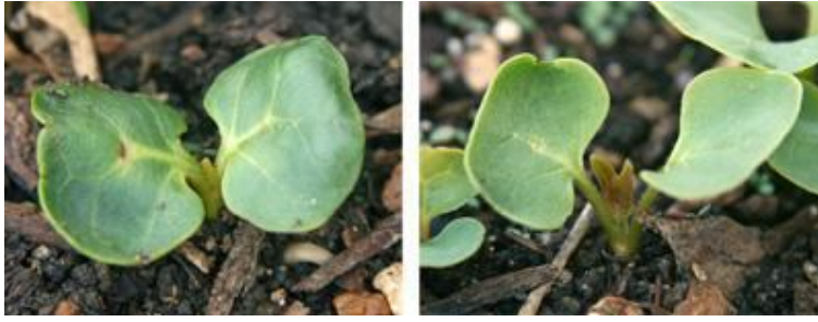
Figure 2: Seeding of Mirabilis jalapa with first true leaves[117].