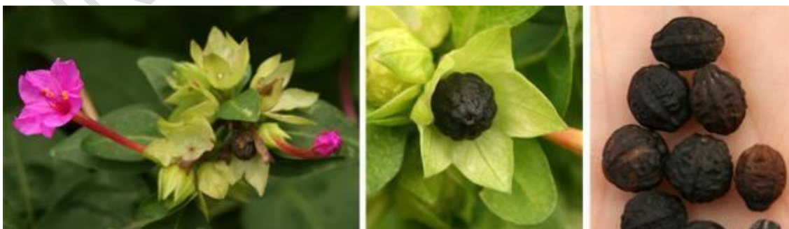
Figure 4: The plant's wrinkled, dark-colored fruits and harvested[117].