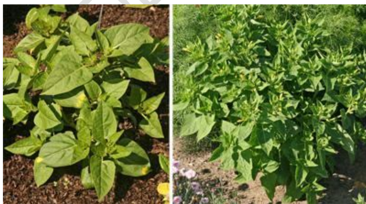
Figure 1: The foliage on the shrub-like plants appear in medium green color[117].

Mirabilis jalapa is a branched herb that consists of numerous branches. Leaves are pointed, have an egg shape, and can be up to 9 cm long, with a broad end at the base (ovate), oblong, or triangular; the leaf tip is sharp, and the base cordate. The petiole, or leaf stem, is 4 cm long[11]. Seeds are small and brown or black in color. After developing as round, wrinkled, and greenish-yellow single-seeded fruits, they mature into spherical, wrinkled, and black[12].