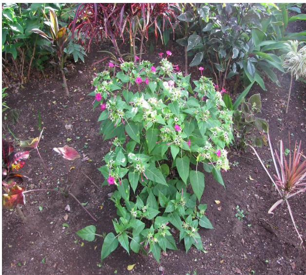
Figure 6: Well Grown plant of Mirabilis jalapa [119].